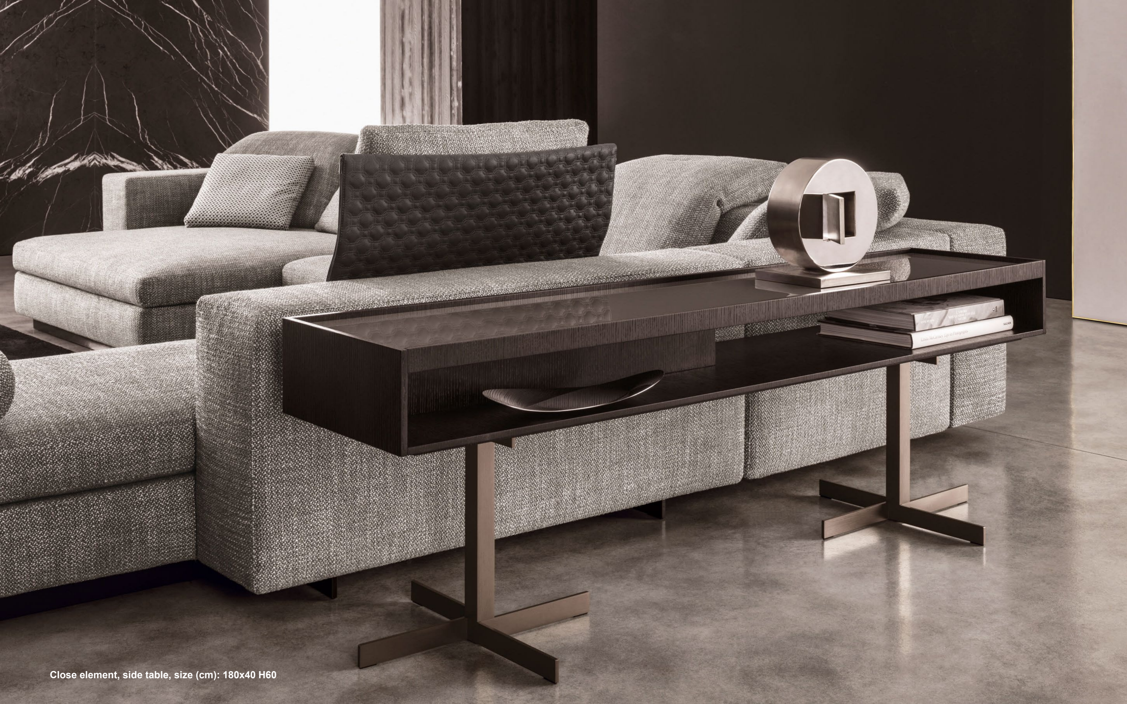
Close element, side table, size (cm): 180x40 H60