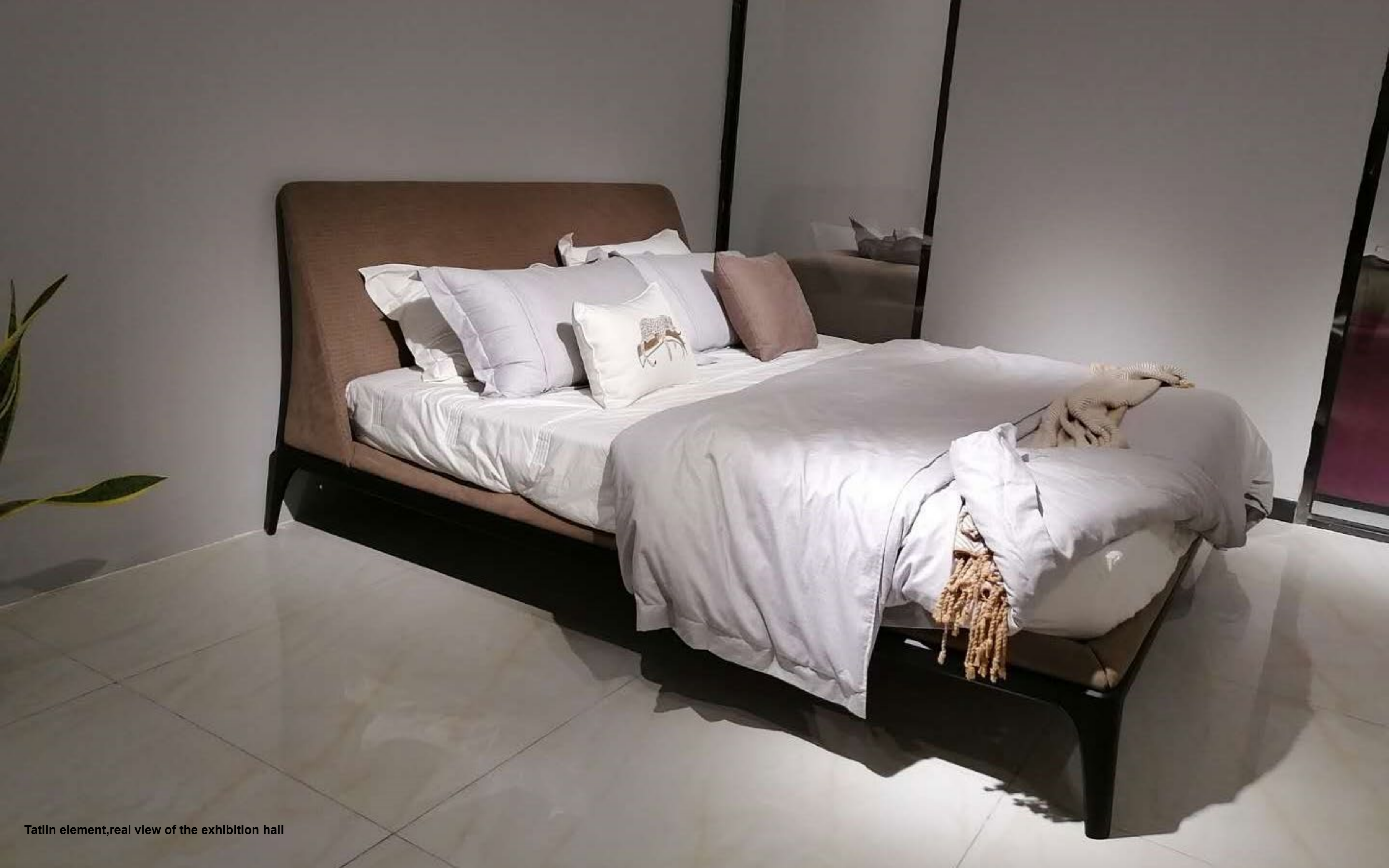
Tatlin element,real view of the exhibition hall