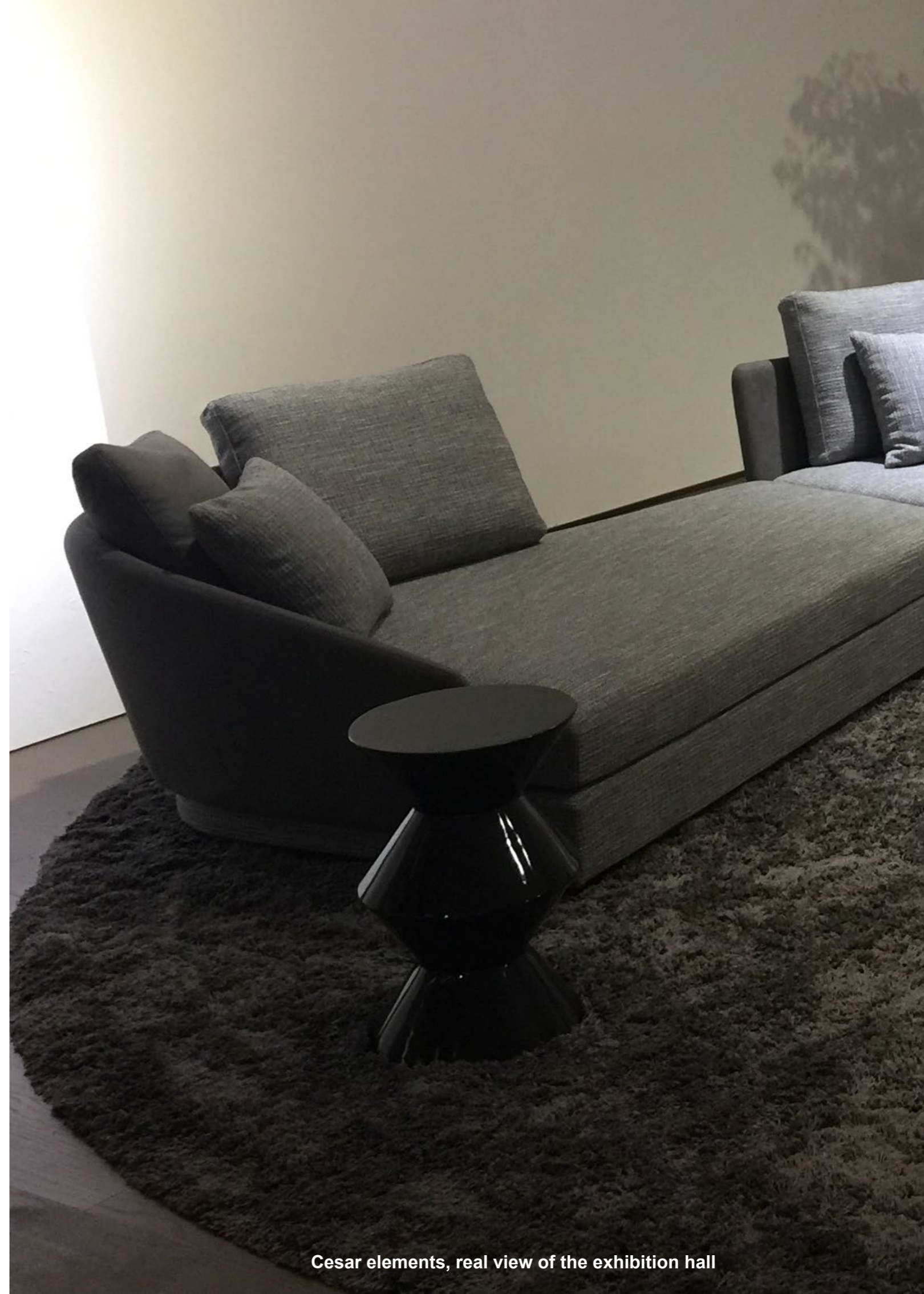
Cesar elements, real view of the exhibition hall