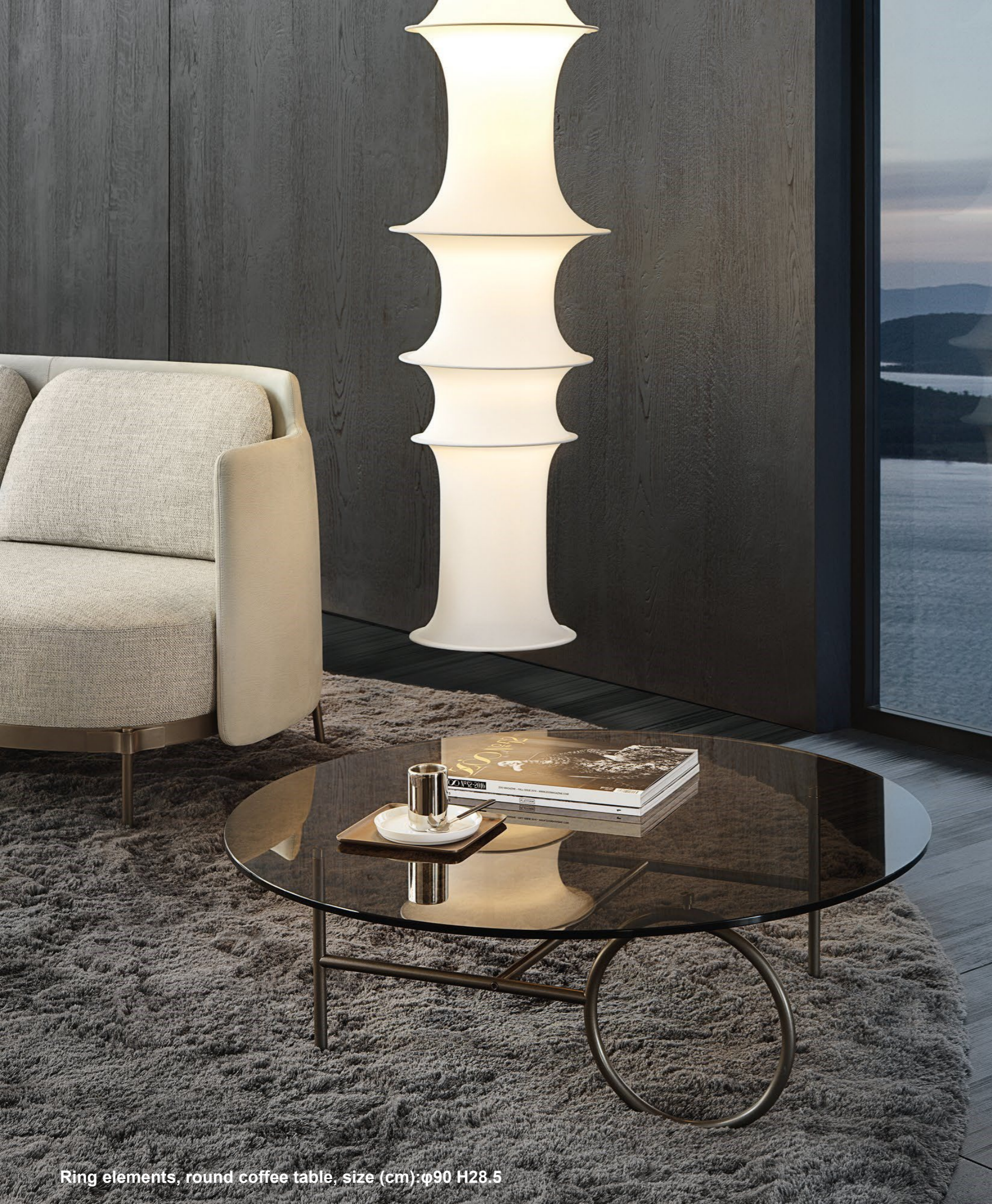
Ring elements, round coffee table, size (cm): \phi 90 H28.5