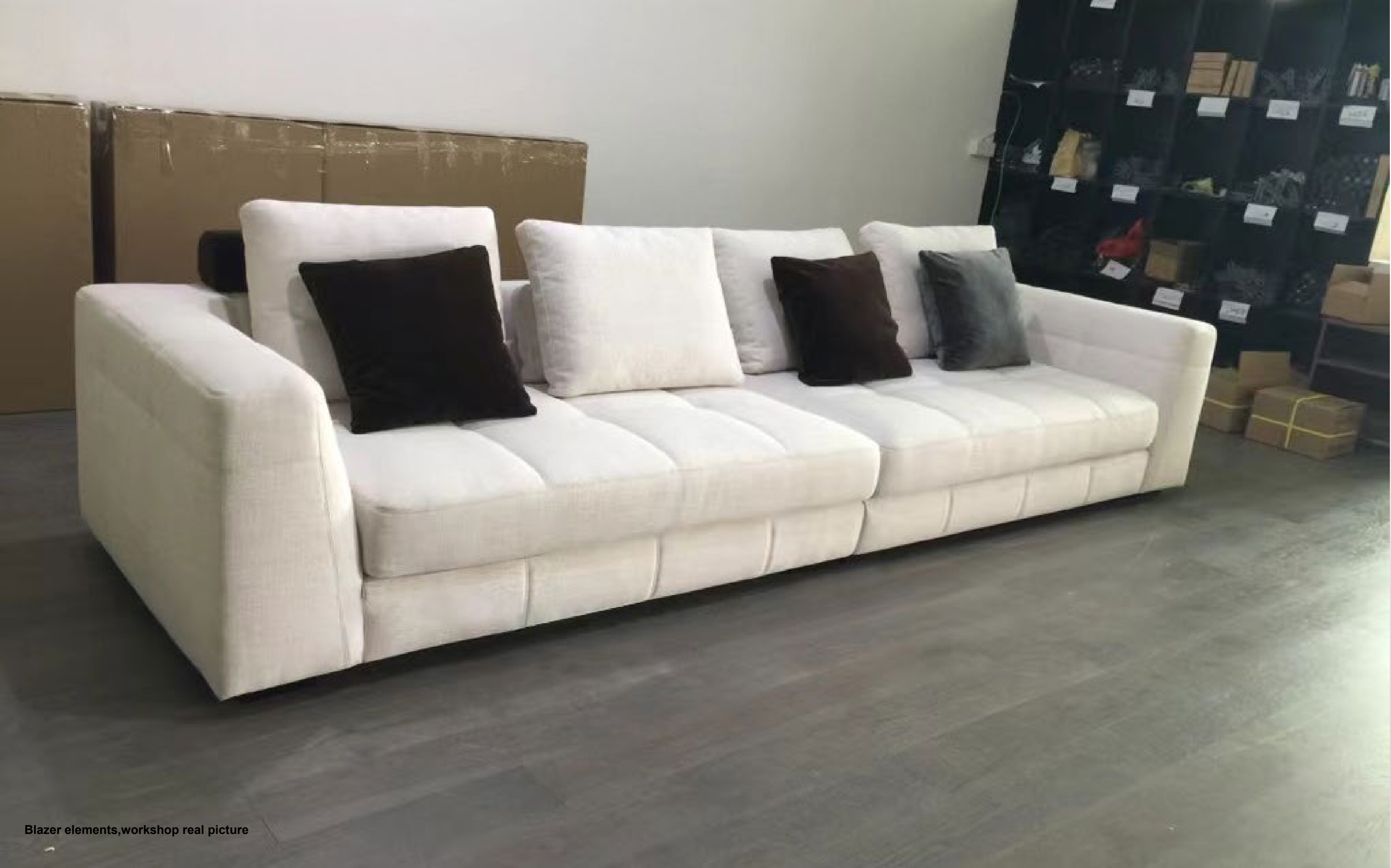
Blazer elements,workshop real picture