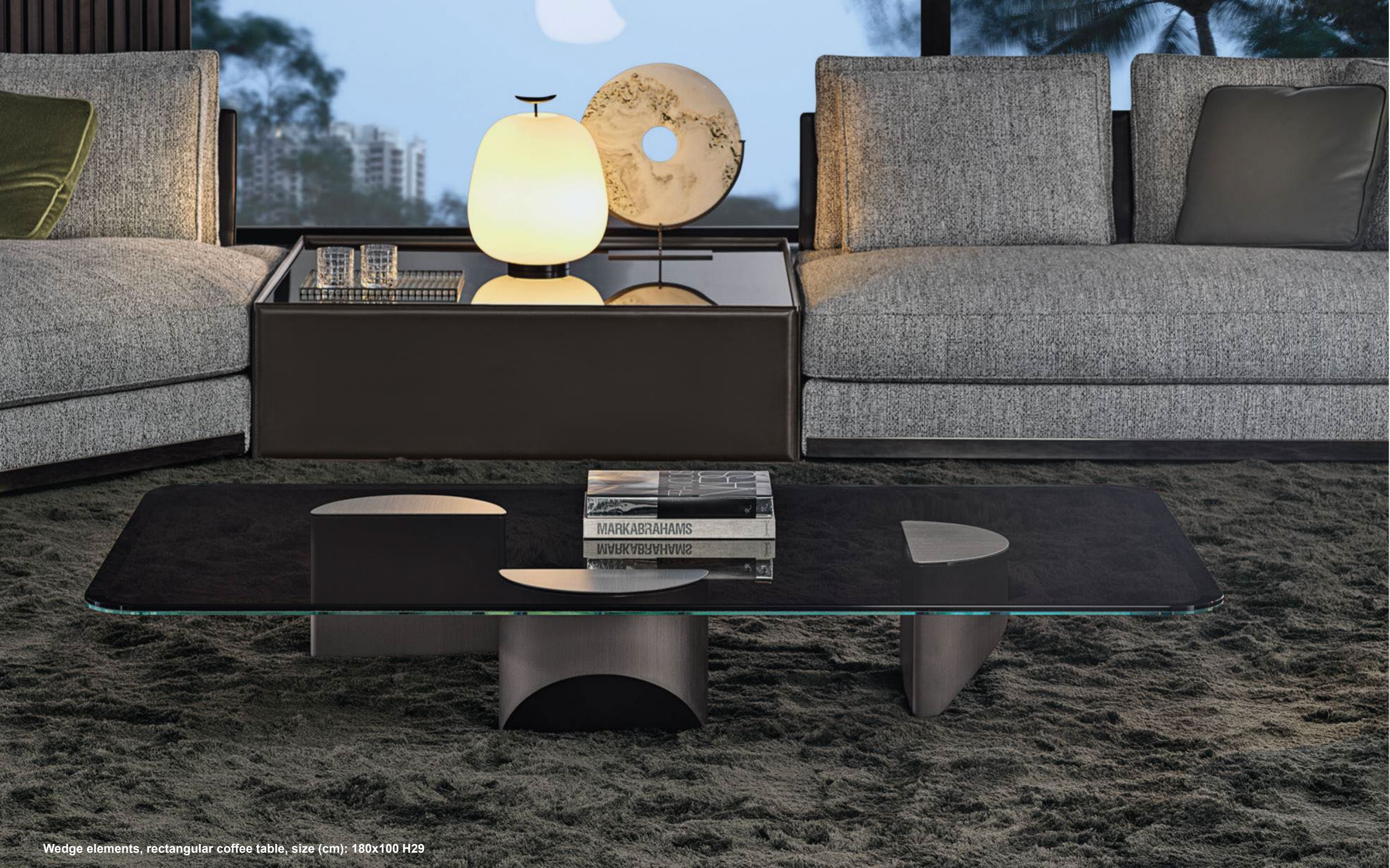
Wedge elements, rectangular coffee table, size (cm): 180x100 H29