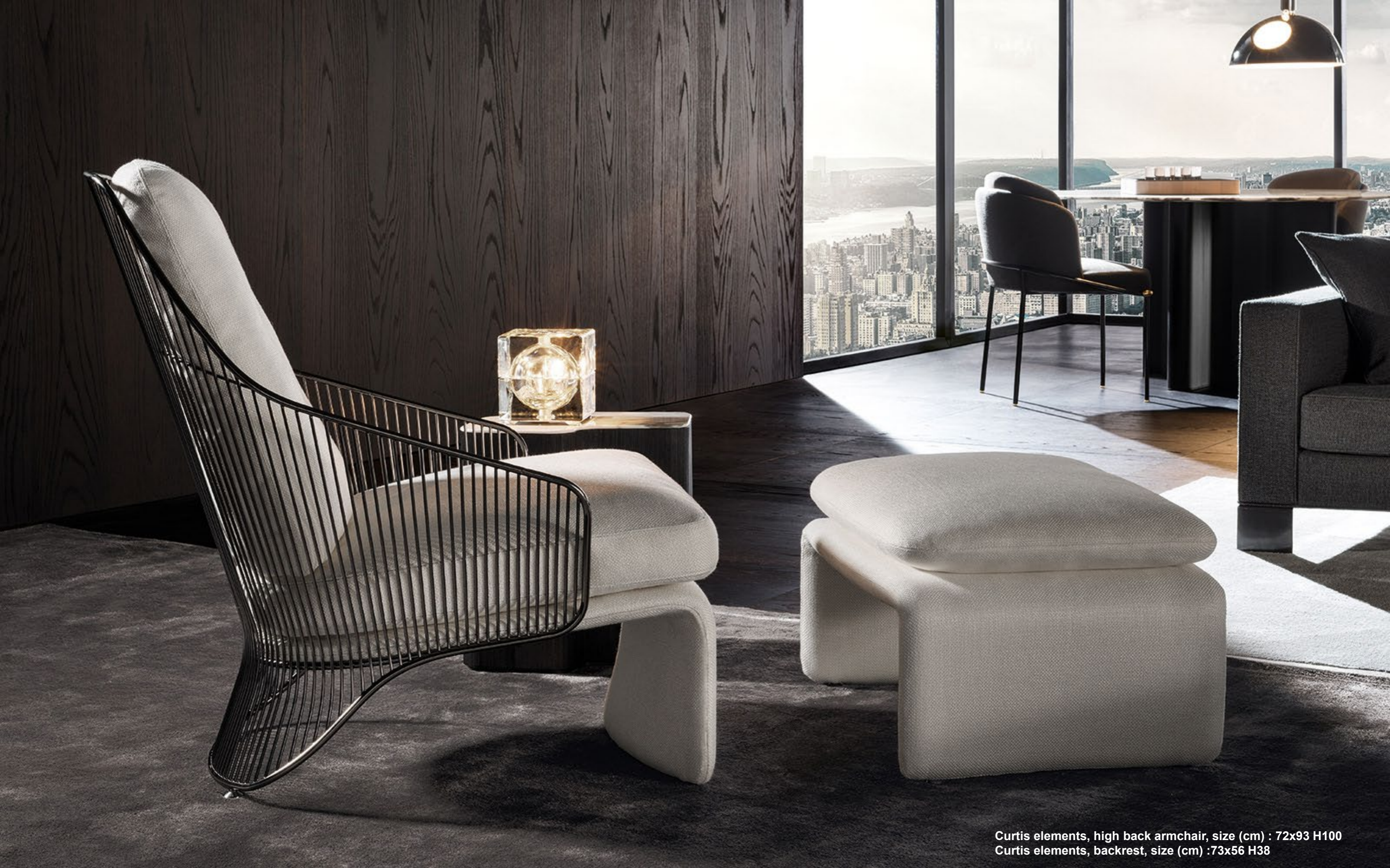
Curtis elements, high back armchair, size (cm) : 72x93 H100 Curtis elements, backrest, size (cm) : 73x56 H38