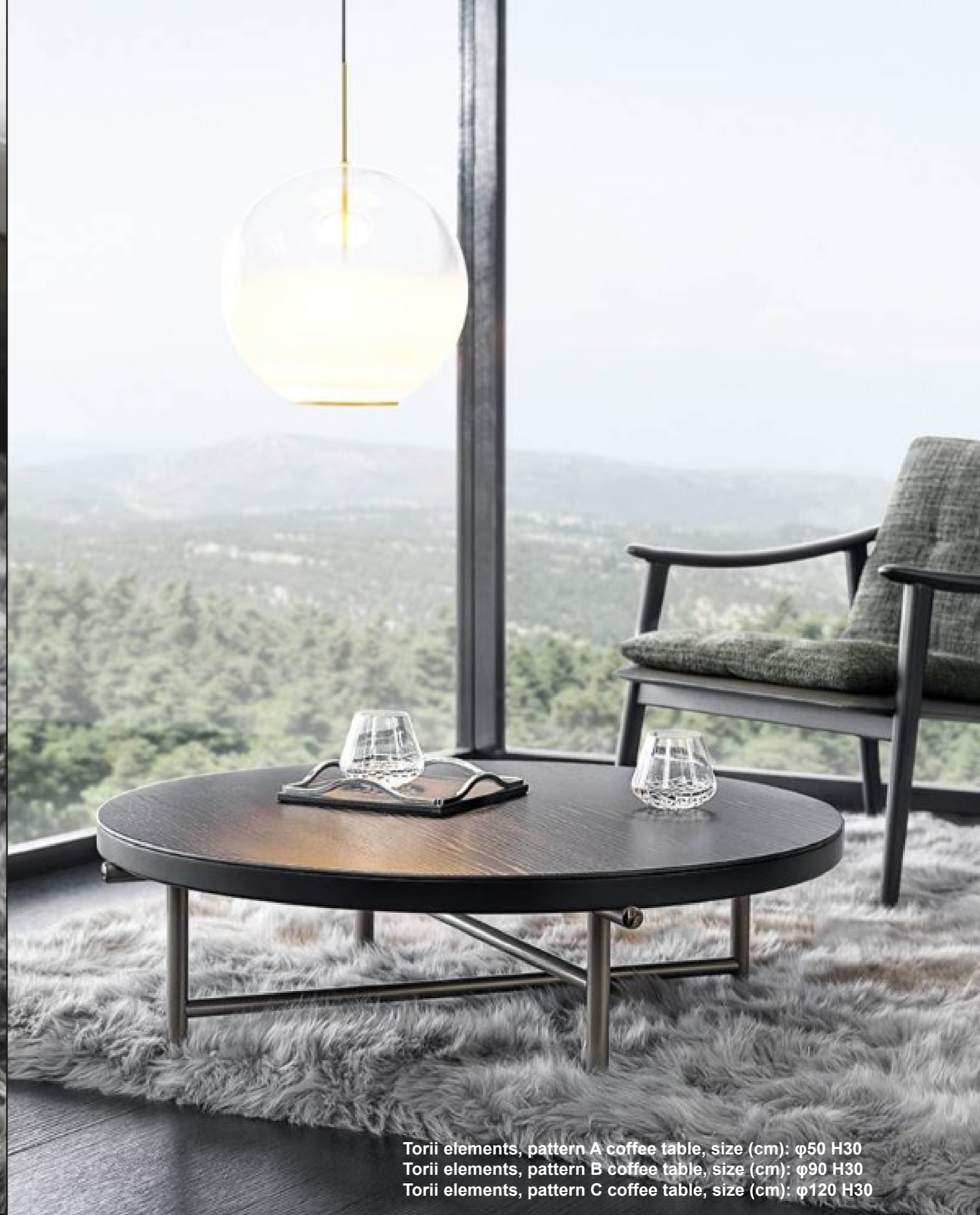
Torii elements, pattern A coffee table, size (cm): \phi 50 H30 Torii elements, pattern B coffee table, size (cm): \phi 90 H30 Torii elements, pattern C coffee table, size (cm): \phi 120 H30