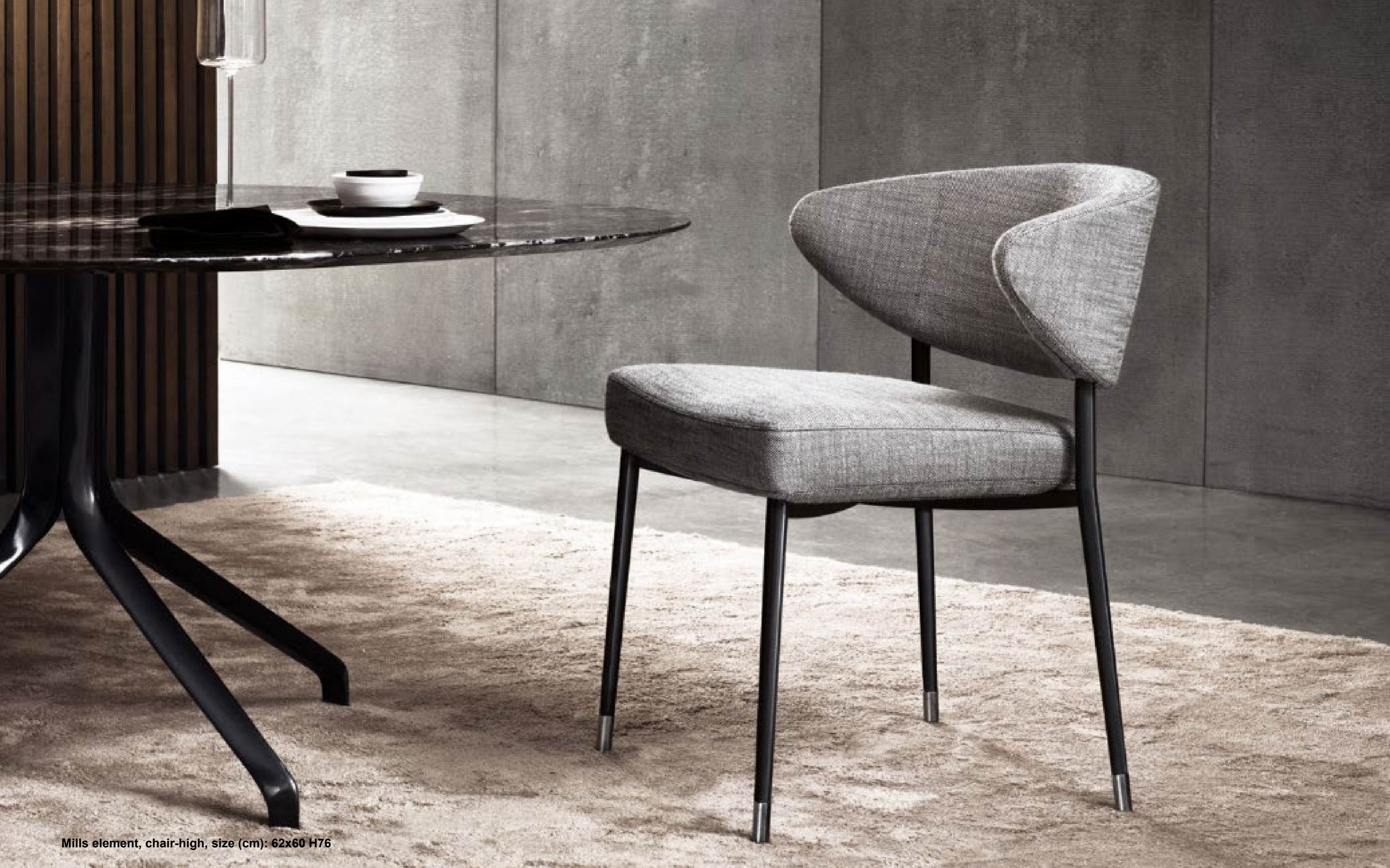
Mills element, chair-high, size (cm): 62x60 H76