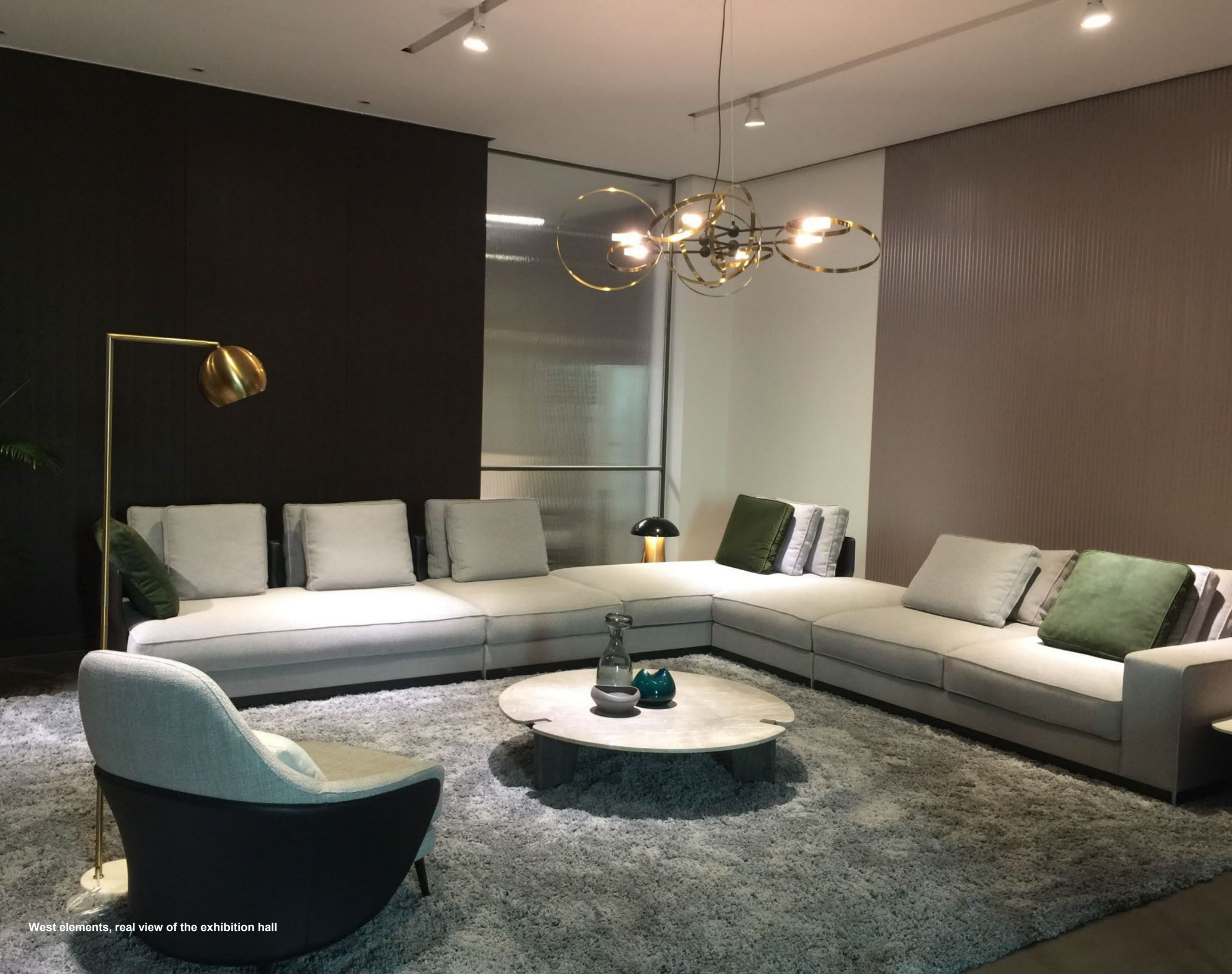
West elements, real view of the exhibition hall