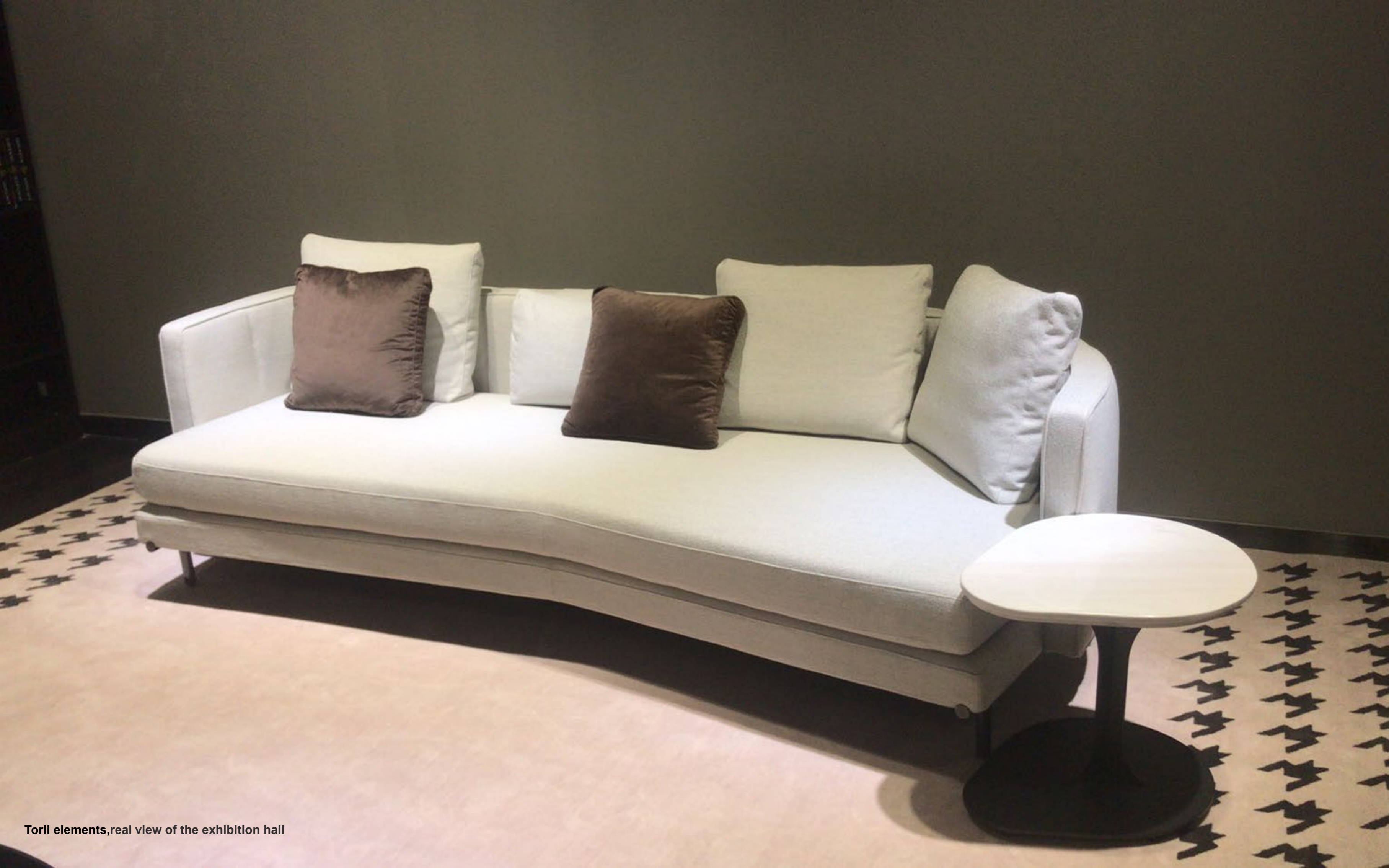
Torii elements,real view of the exhibition hall