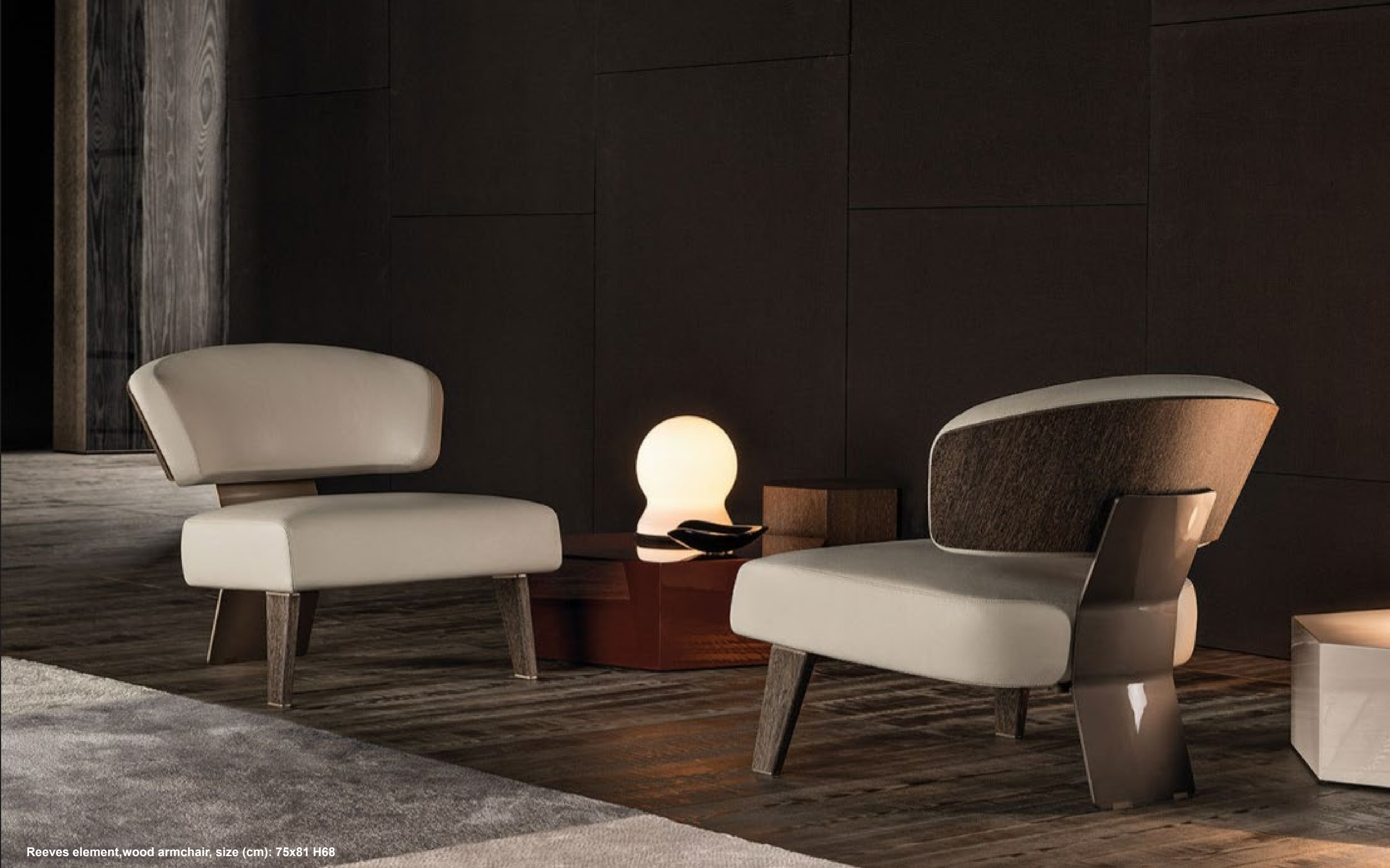
Reeves element, wood armchair, size (cm): 75x81 H68