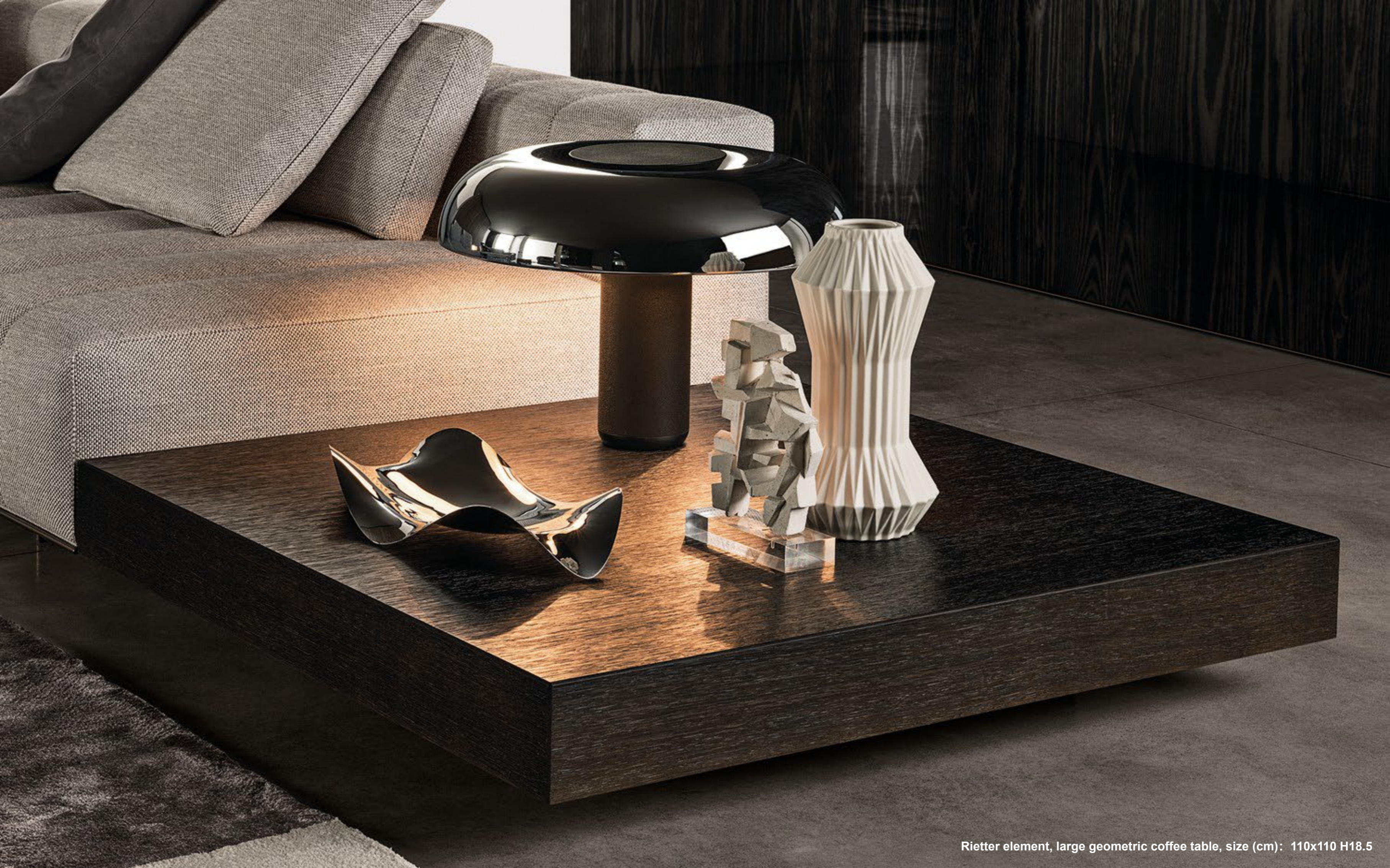
Rietter element, large geometric coffee table, size (cm): 110x110 H18.5