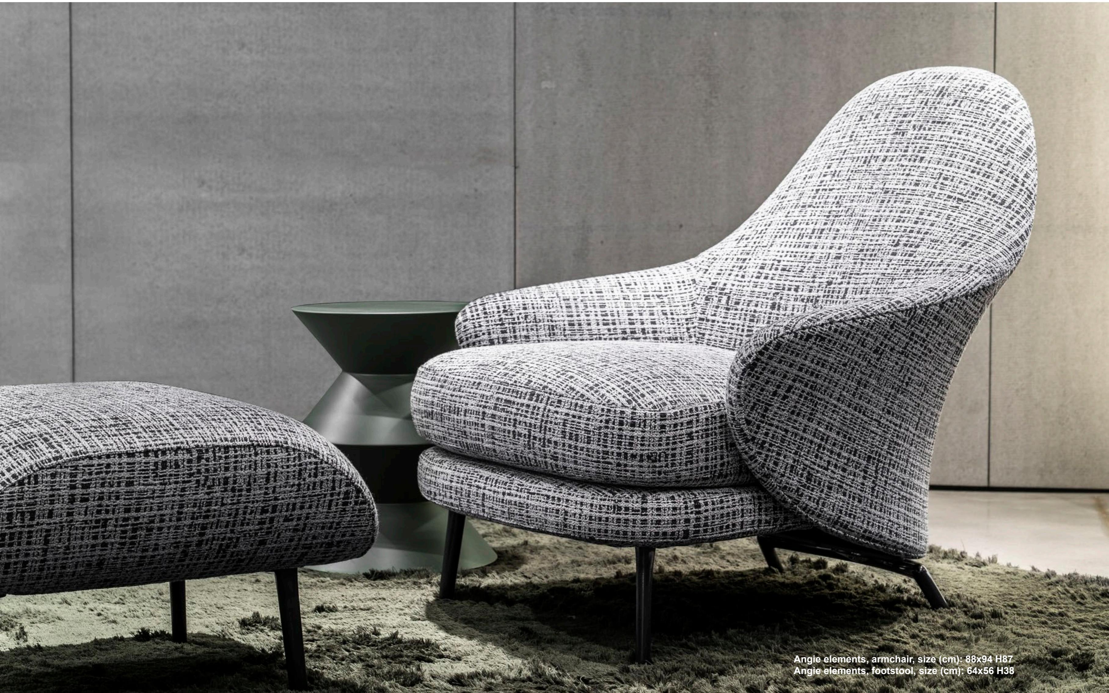
Angie elements, armchair, size (cm): 88x94 H87 Angie elements, footstool, size (cm): 64x56 H38