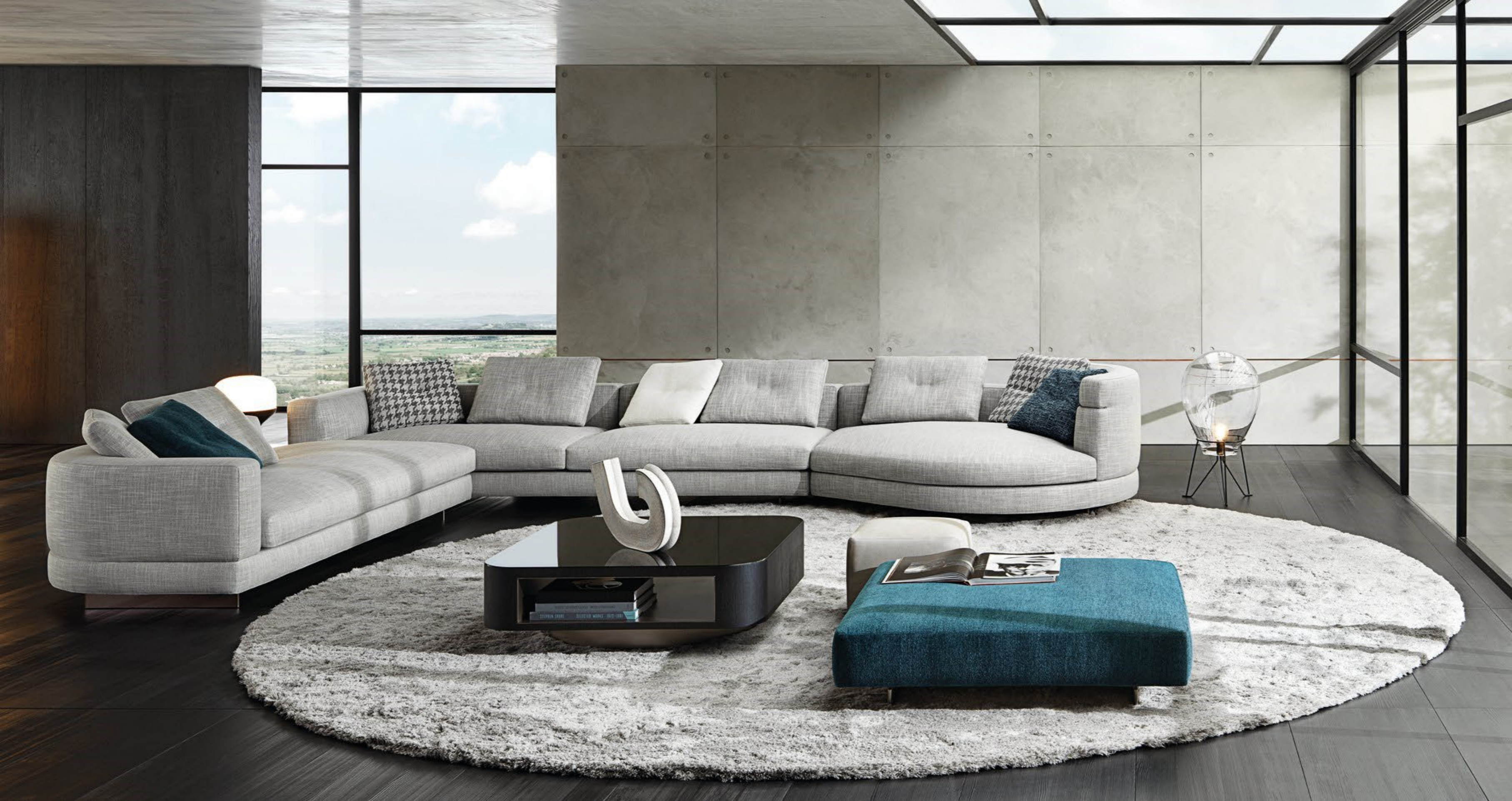
Alexander elements, with an armrest, low back, large open style. Size (cm): 252x105 H83 Alexander elements, with an armrest, low back. Size (cm): 297x105 H83 Alexander elements, with an armrest, low back, curved elements. Size (cm): 167x144 H83