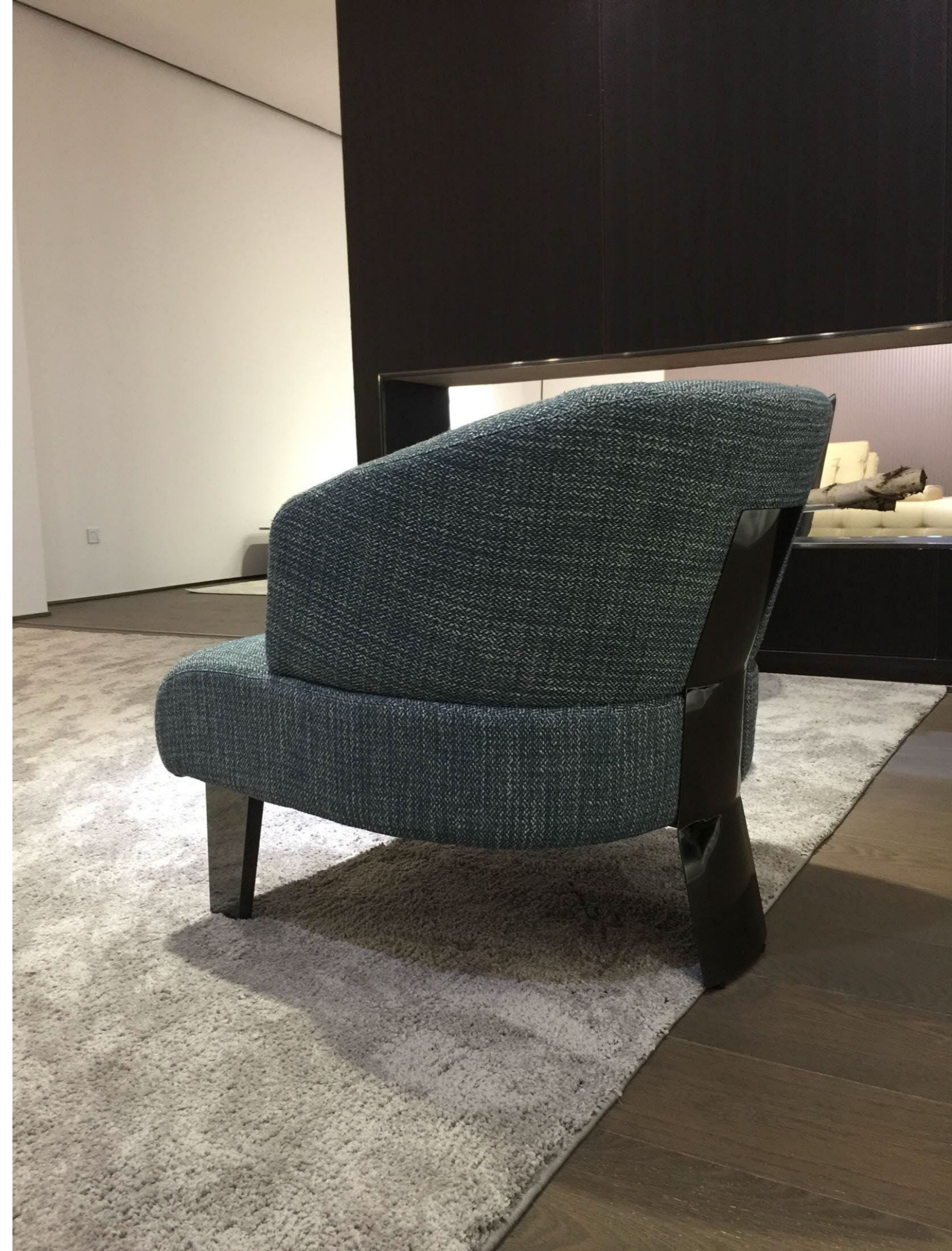
Reeves elements, real view of the exhibition hall