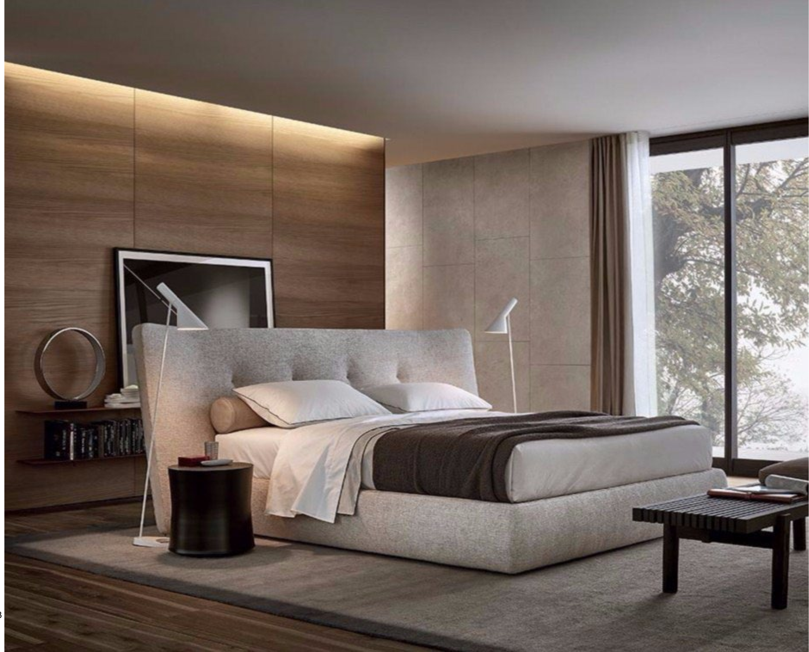
Rever element, mattress, size (cm): 180x200 H18 Rever element, bed frame, size (cm): 197.5x217.5 H33 Rever element, backrest, size (cm): 268.5x33 H112.5