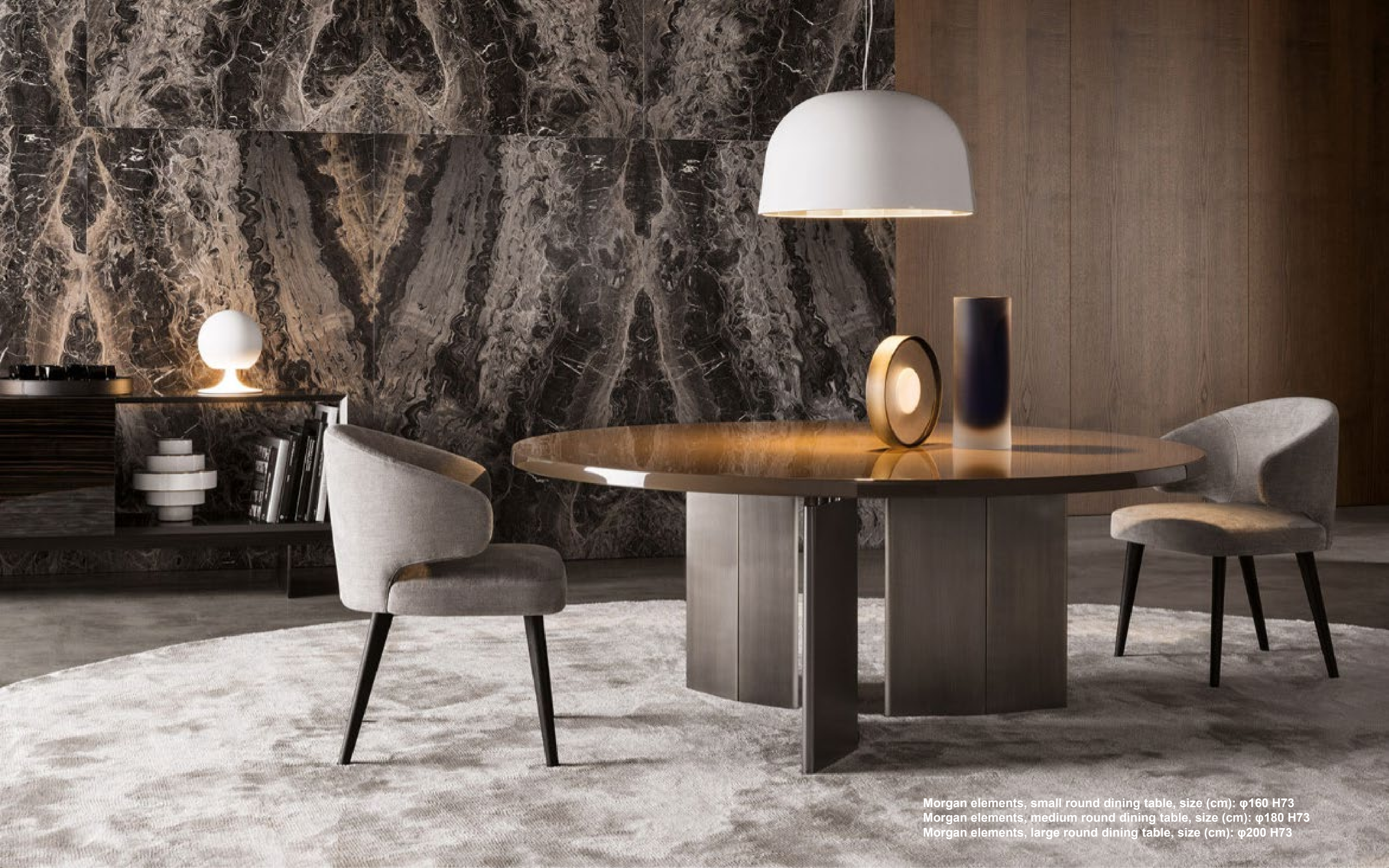
Morgan elements, small round dining table, size (cm): \phi 160 H73 Morgan elements, medium round dining table, size (cm): \phi 180 H73 Morgan elements, large round dining table, size (cm): \phi 200 H73