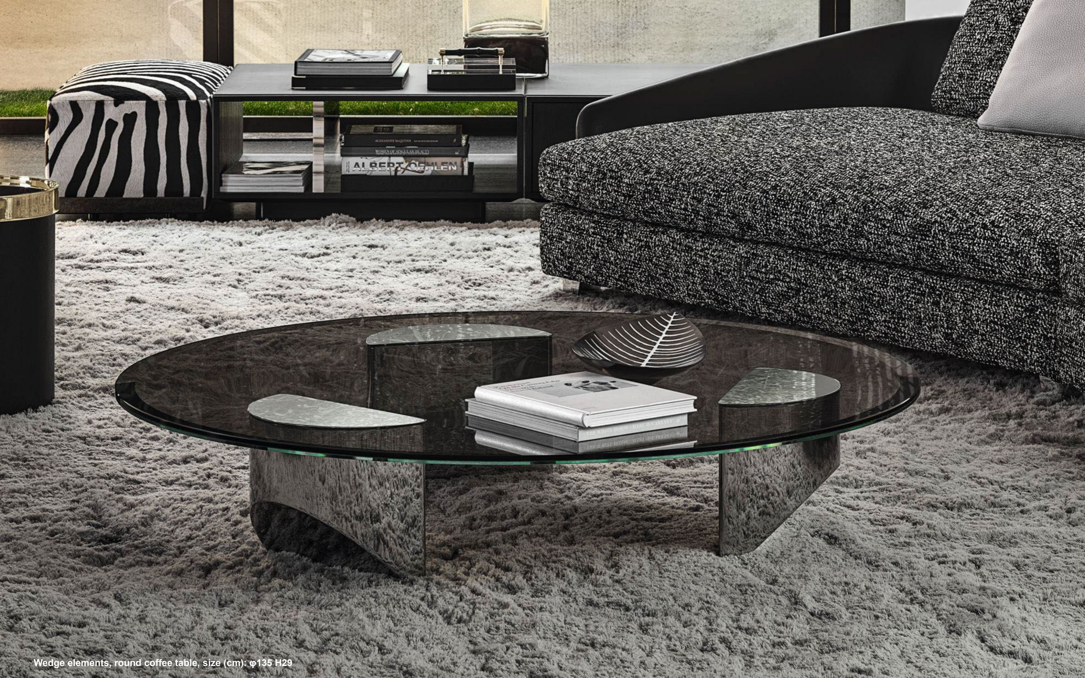
Wedge elements, round coffee table, size (cm): \phi 135 H29