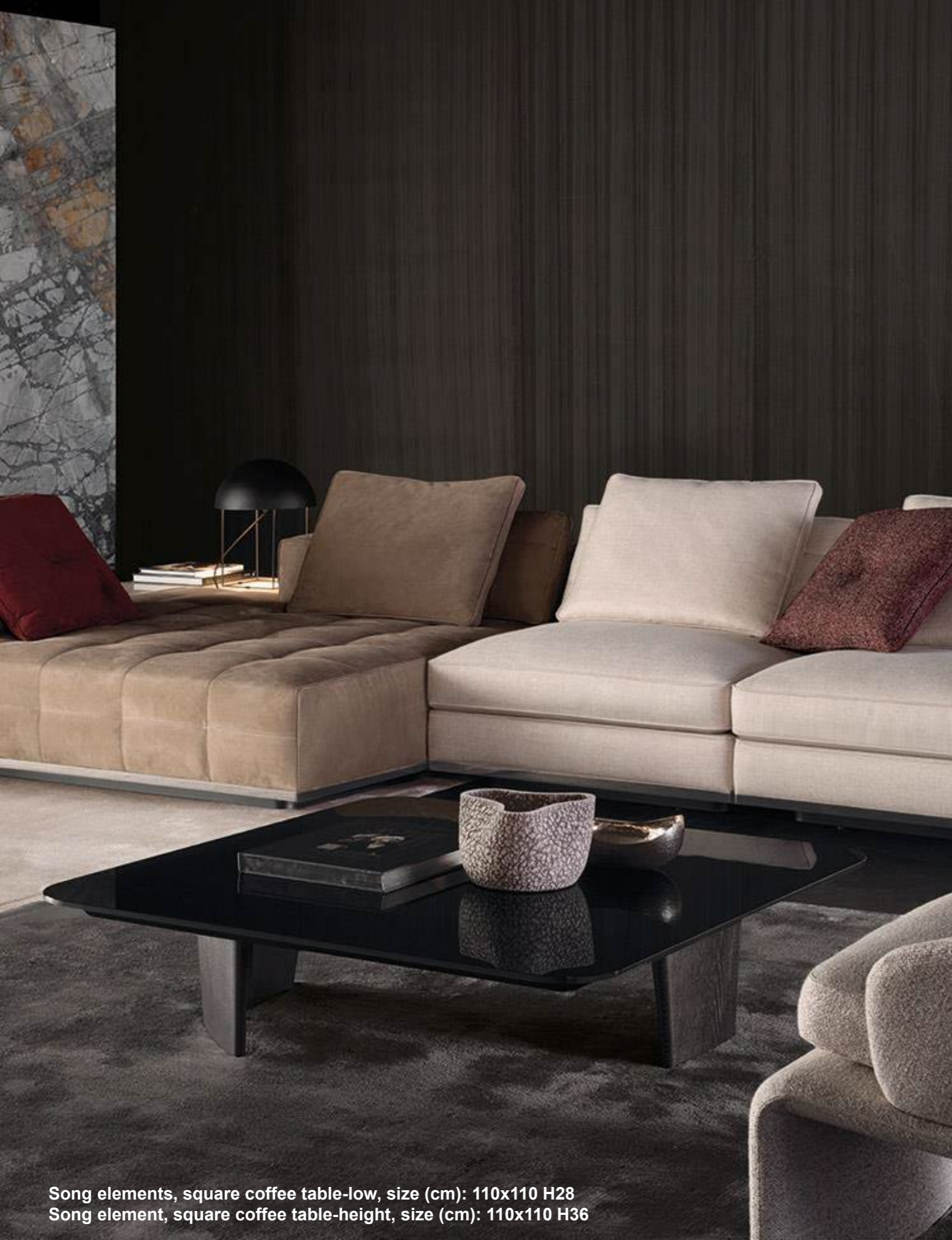
Song elements, square coffee table-low, size (cm): 110x110 H28 Song element, square coffee table-height, size (cm): 110x110 H36