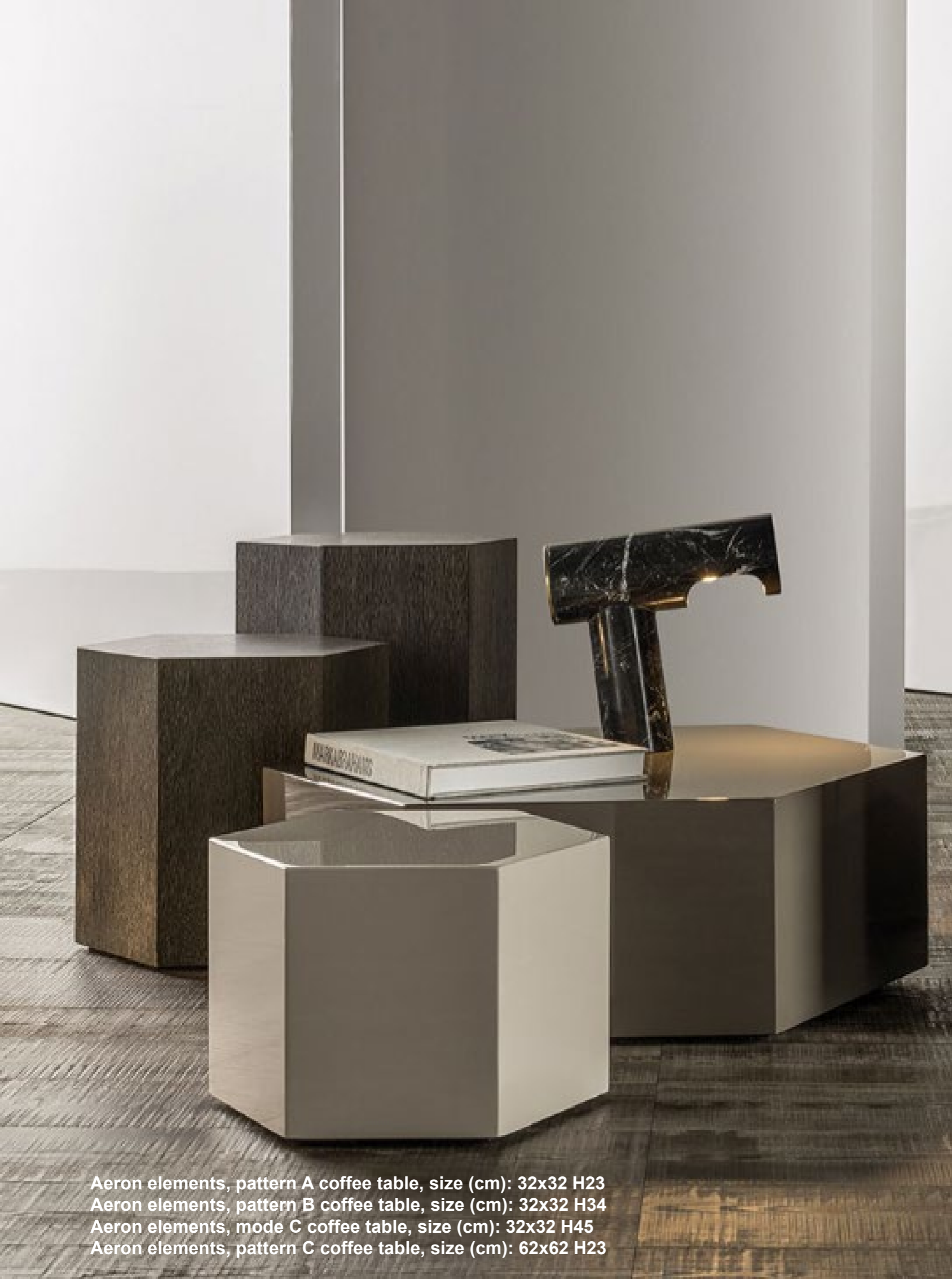
Aeron elements, pattern A coffee table, size (cm): 32x32 H23 Aeron elements, pattern B coffee table, size (cm): 32x32 H34 Aeron elements, mode C coffee table, size (cm): 32x32 H45 Aeron elements, pattern C coffee table, size (cm): 62x62 H23