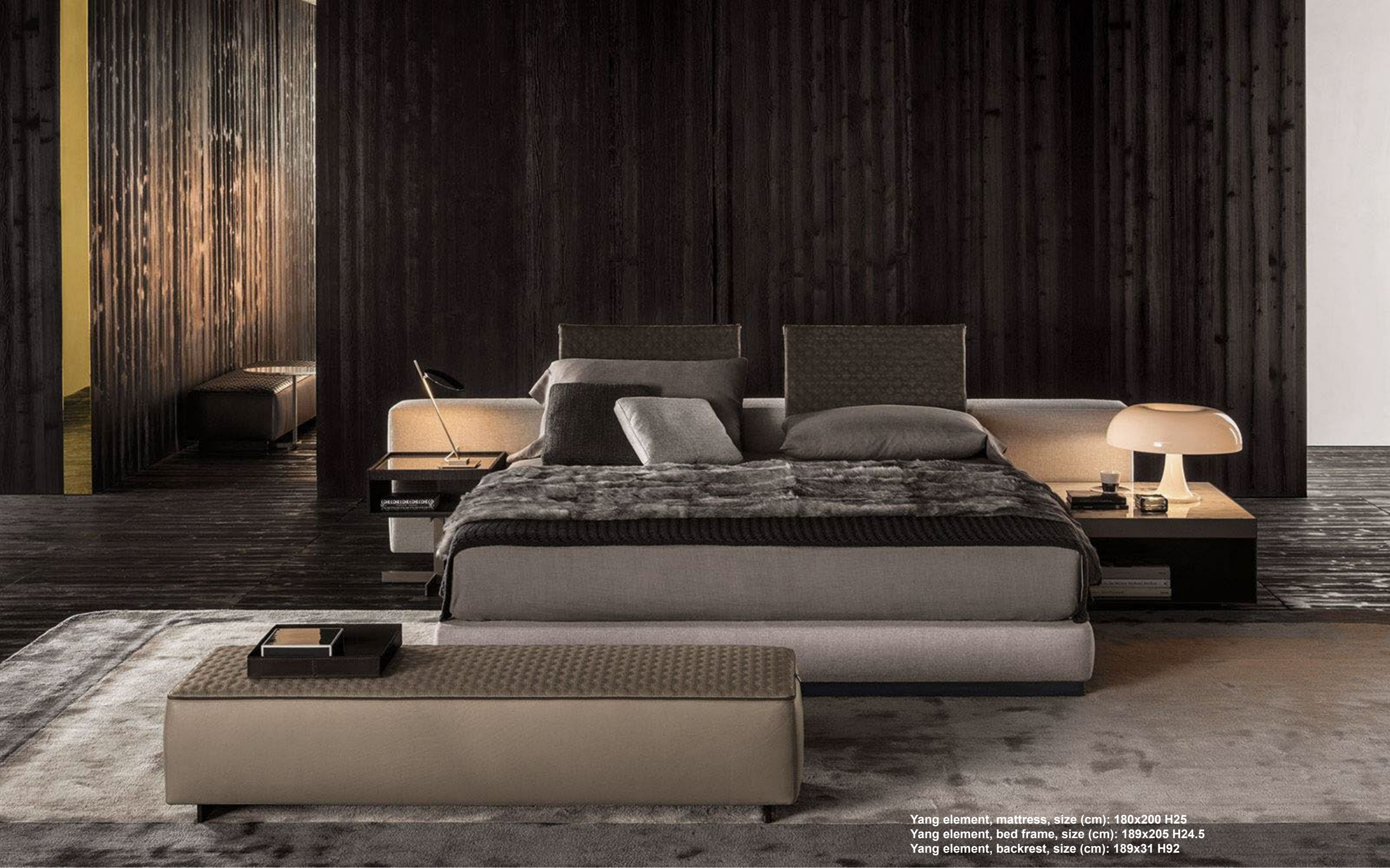
Yang element, mattress, size (cm): 180x200 H25 Yang element, bed frame, size (cm): 189x205 H24.5 Yang element, backrest, size (cm): 189x31 H92