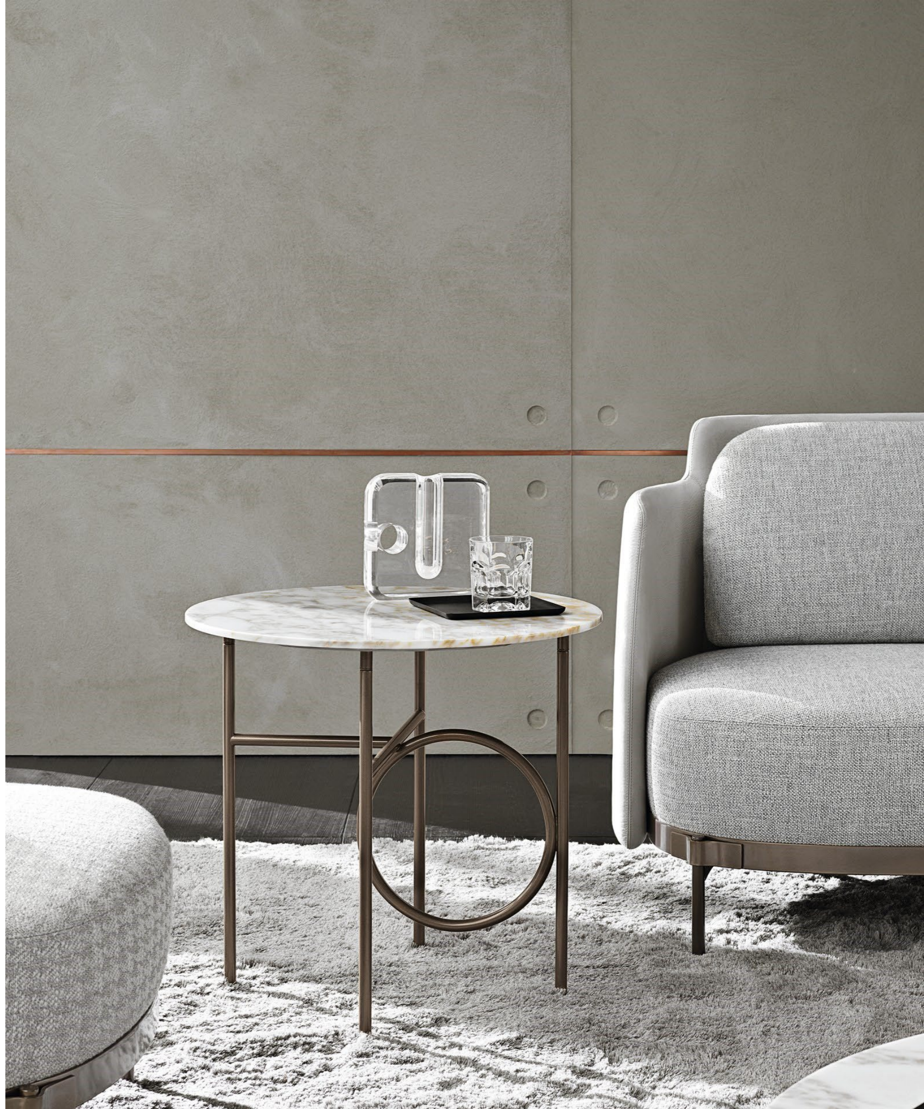
Ring elements, large side table, size (cm) : \phi 55 H53