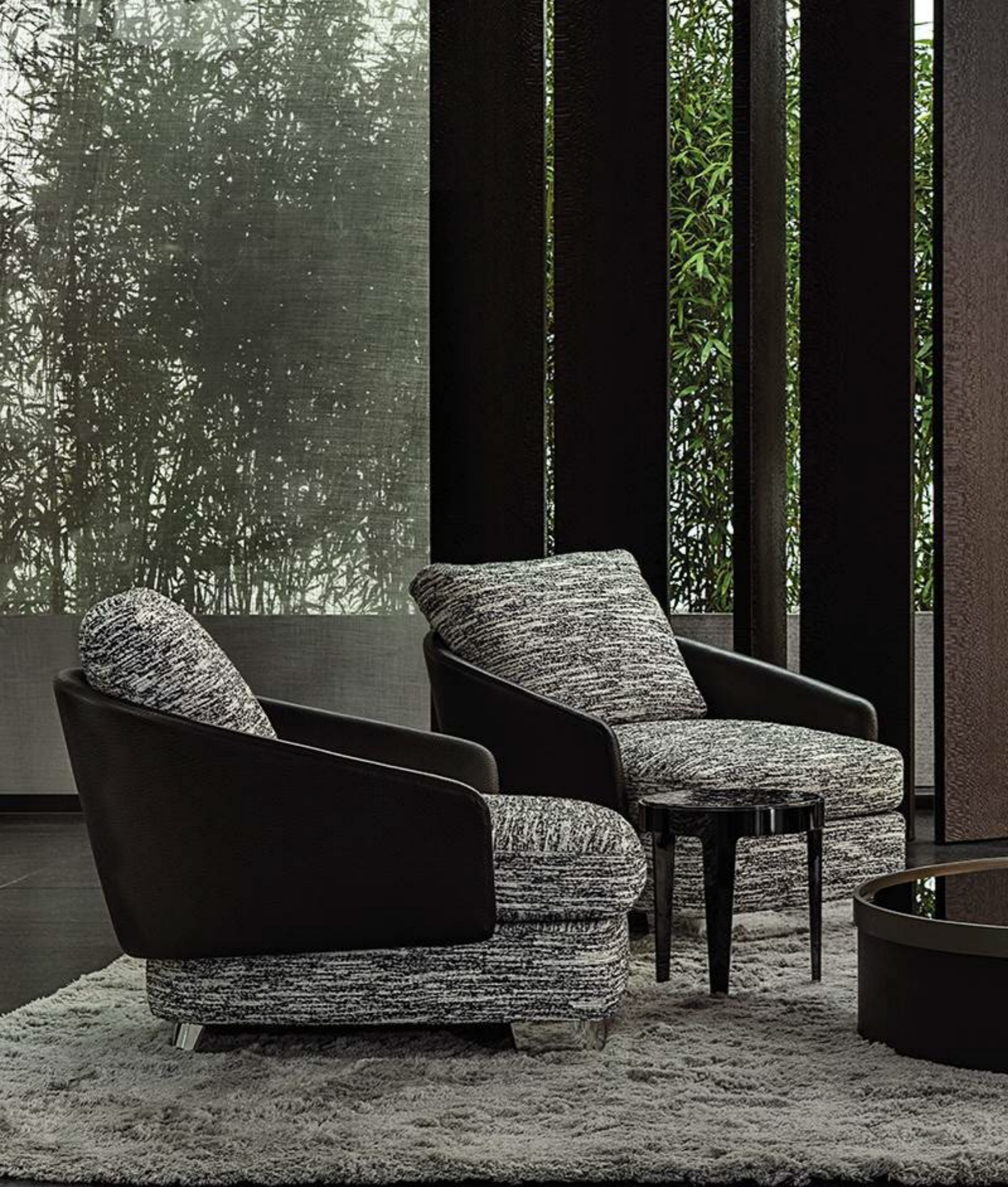
Lawson elements, medium armchair, size (cm): 77x90 H80 Lawson elements, large armchair, size (cm): 84x98 H80