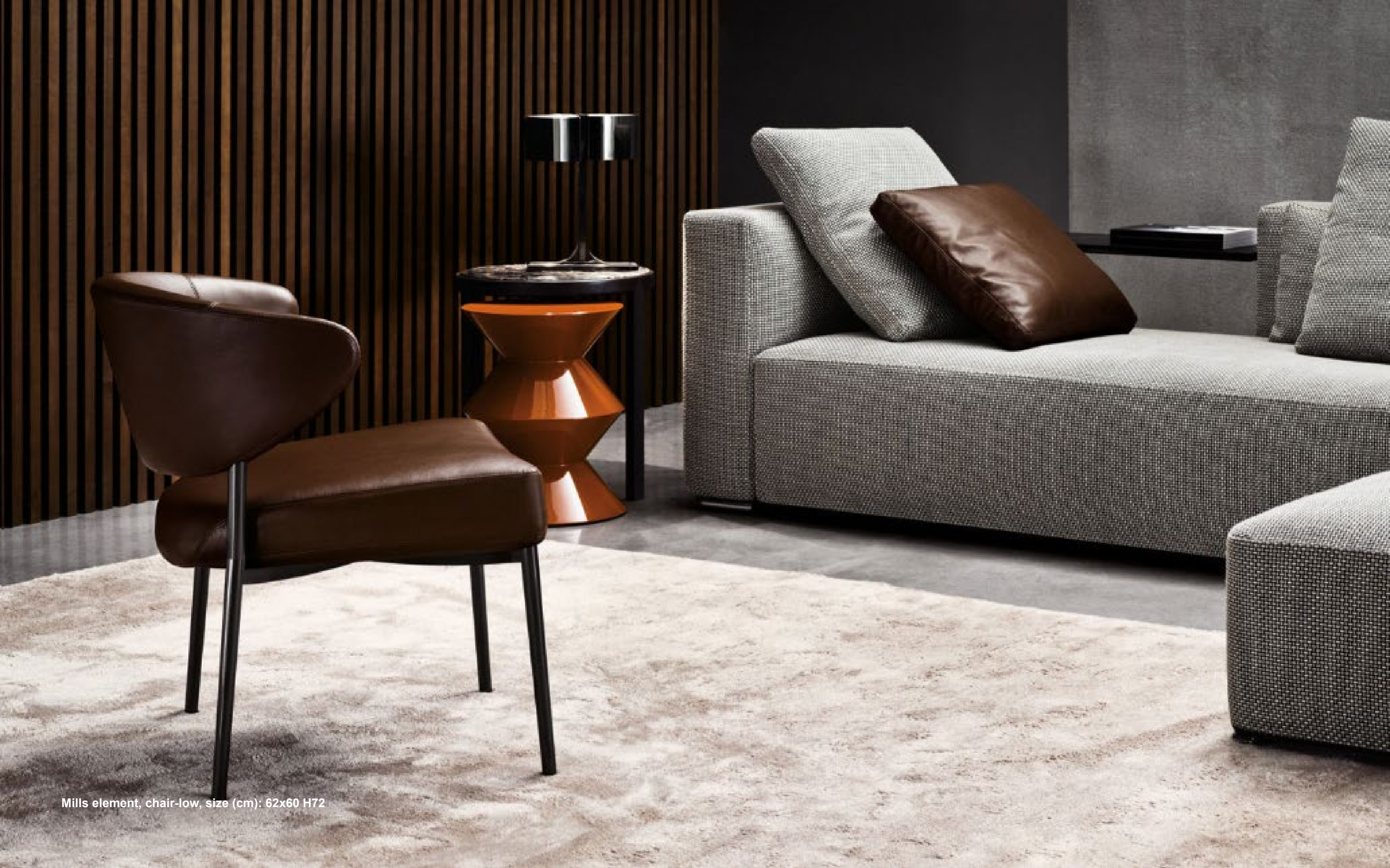
Mills element, chair-low, size (cm): 62x60 H72