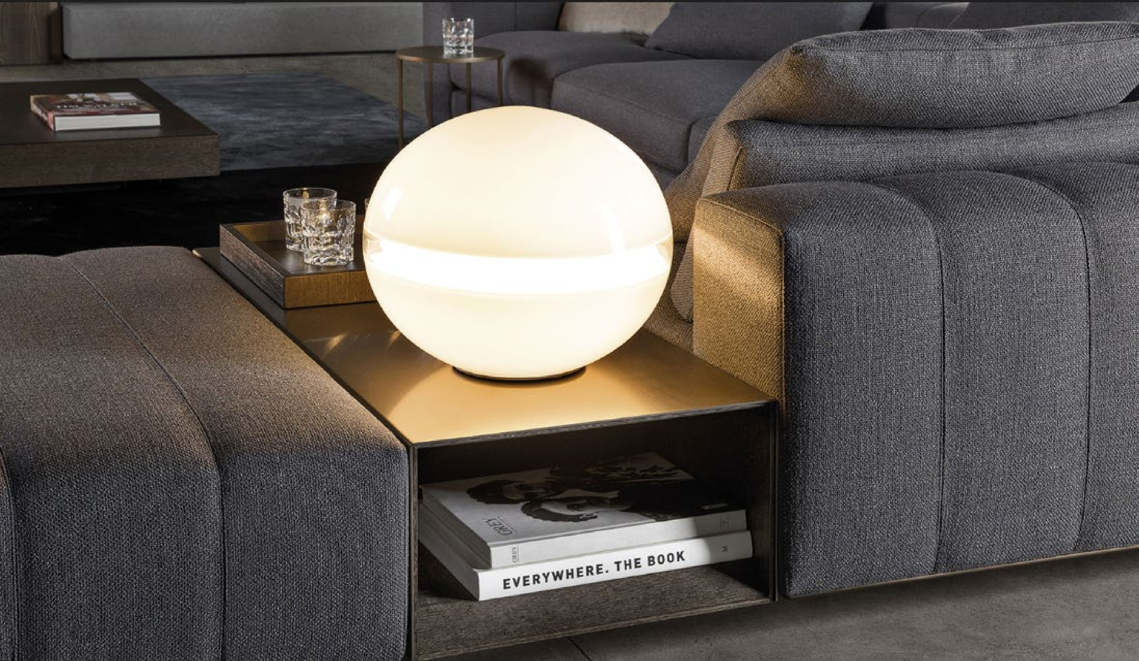
Gray elements, small rectangular coffee table, size (cm): 80x47 H34 Gray elements, medium rectangular coffee table, size (cm): 100x47 H34 Gray elements, large rectangular coffee table, size (cm): 110x47 H34