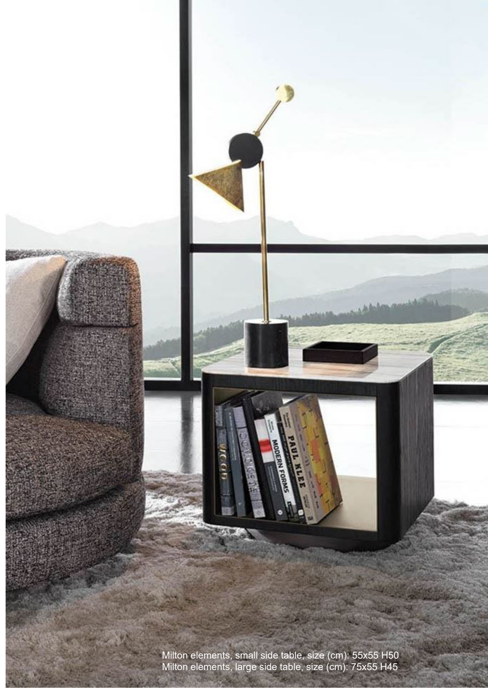
Milton elements, small side table, size (cm): 55x55 H50 Milton elements, large side table, size (cm): 75x55 H45