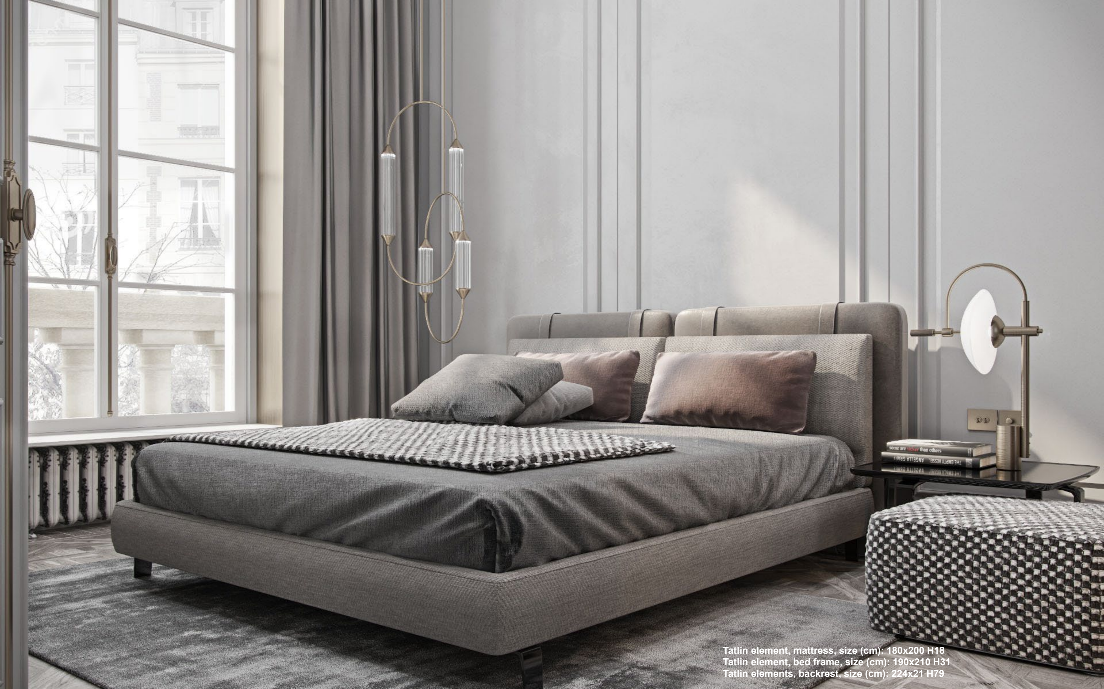
Tatlin element, mattress, size (cm): 180x200 H18 Tatlin element, bed frame, size (cm): 190x210 H31 Tatlin elements, backrest, size (cm): 224x21 H79