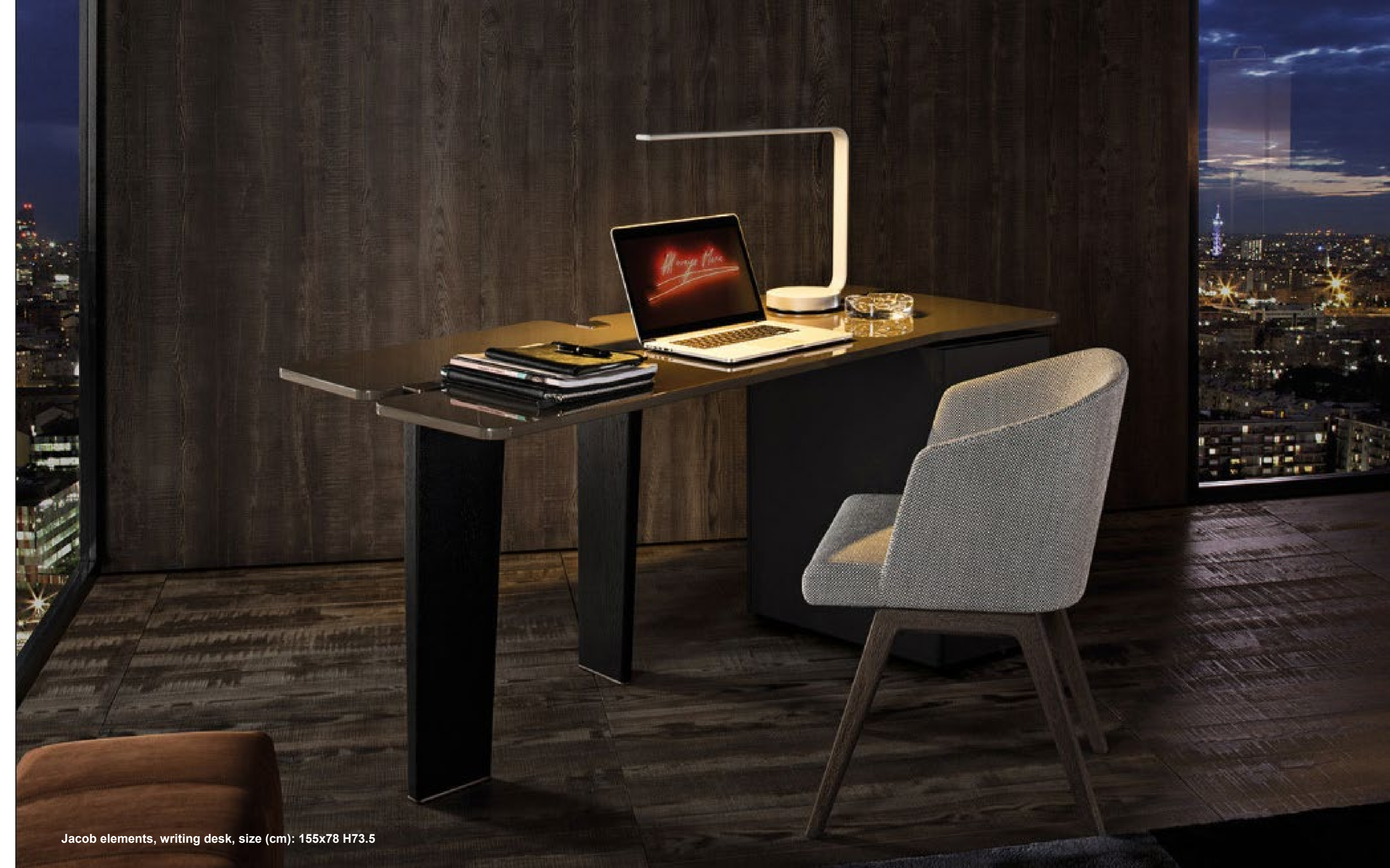
Jacob elements, writing desk, size (cm): 155x78 H73.5