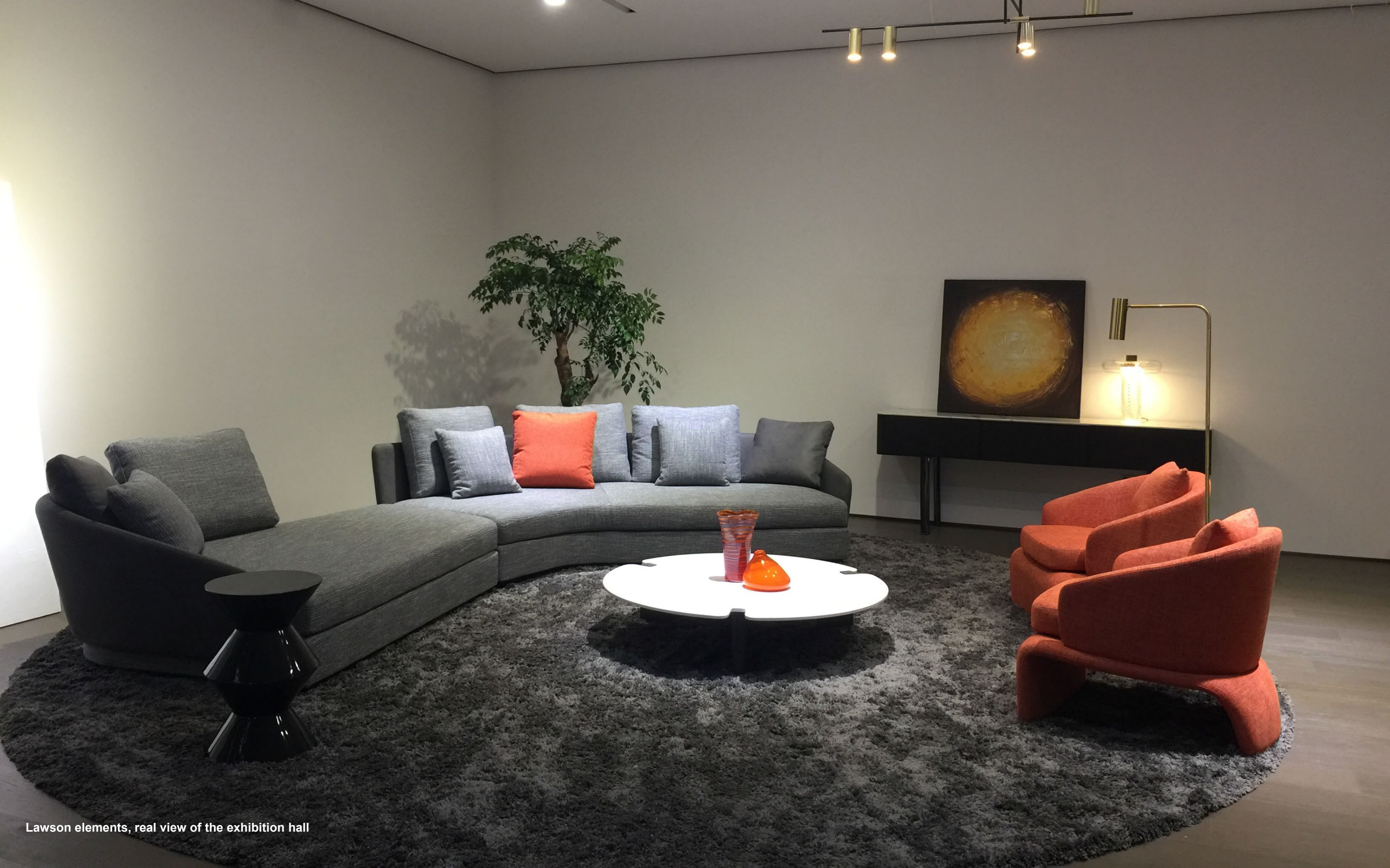
Lawson elements, real view of the exhibition hall