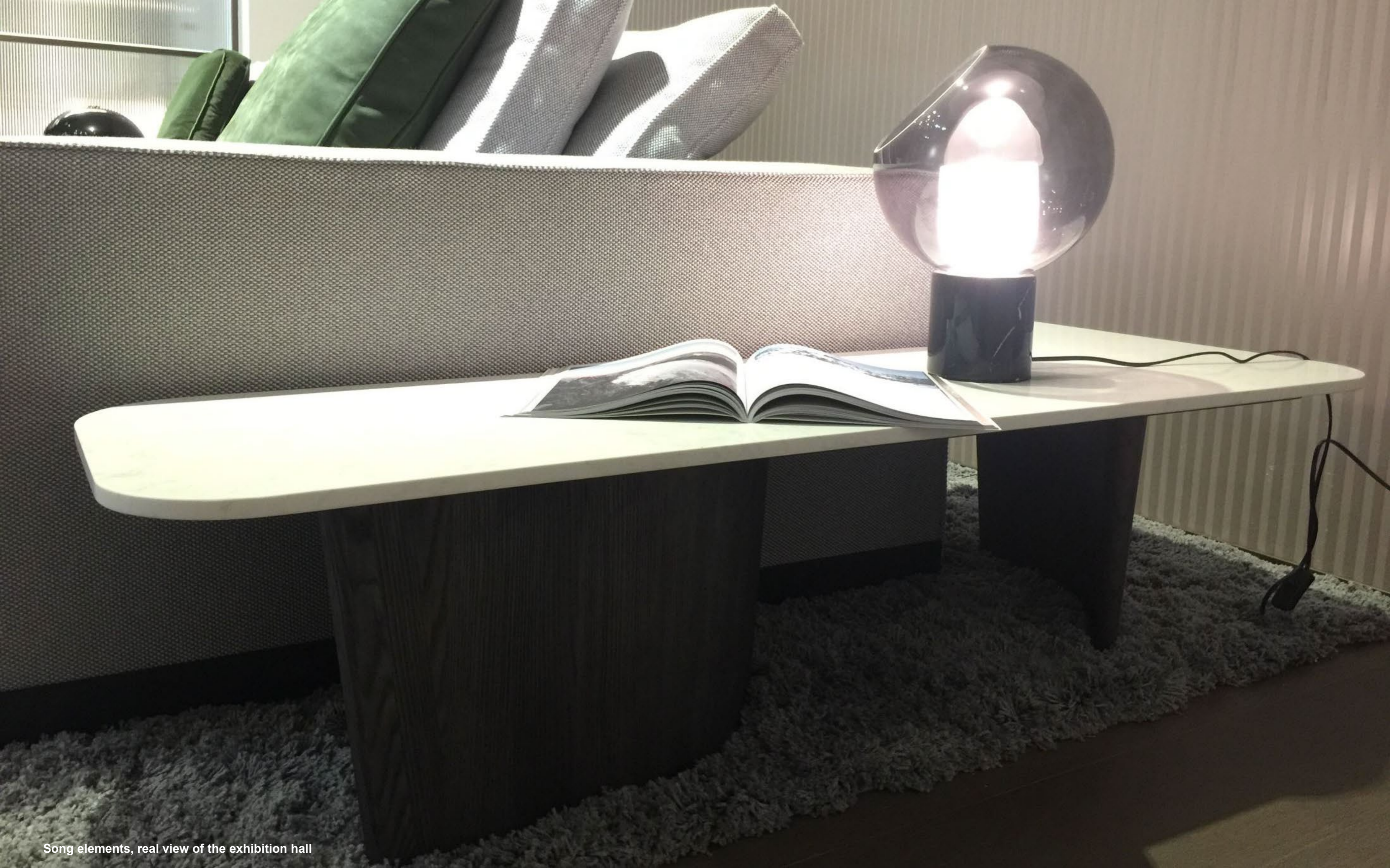
Song elements, real view of the exhibition hall