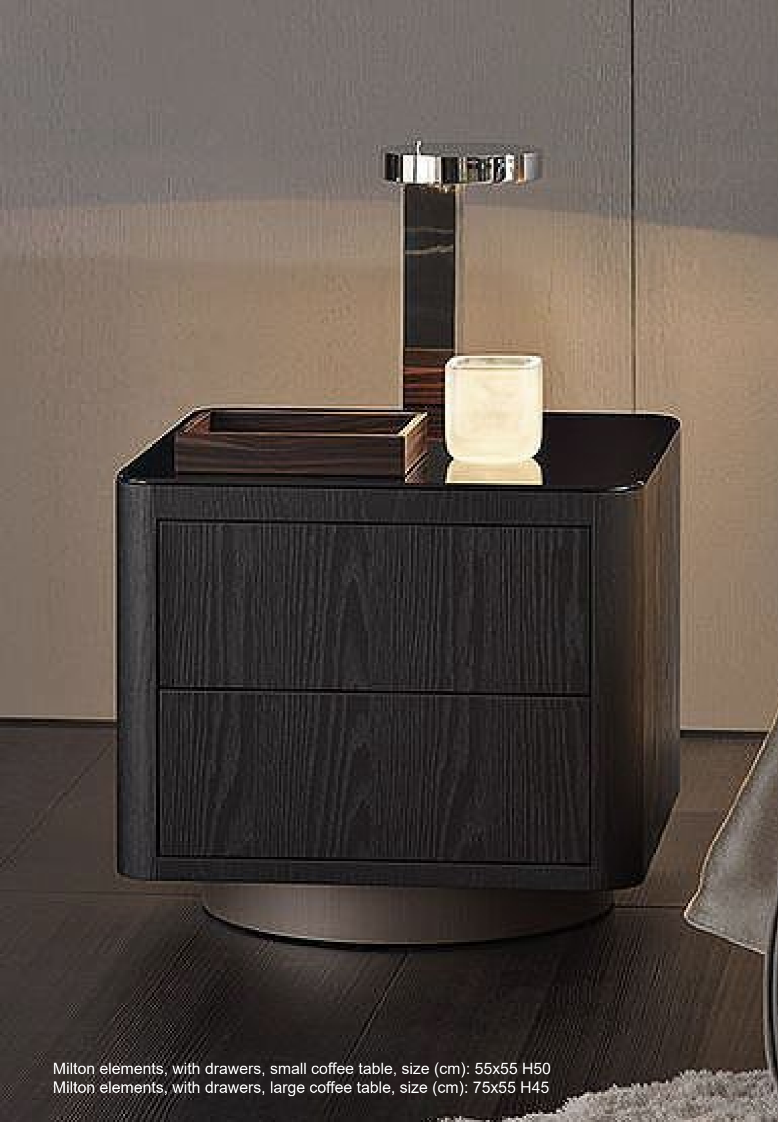
Milton elements, with drawers, small coffee table, size (cm): 55x55 H50 Milton elements, with drawers, large coffee table, size (cm): 75x55 H45