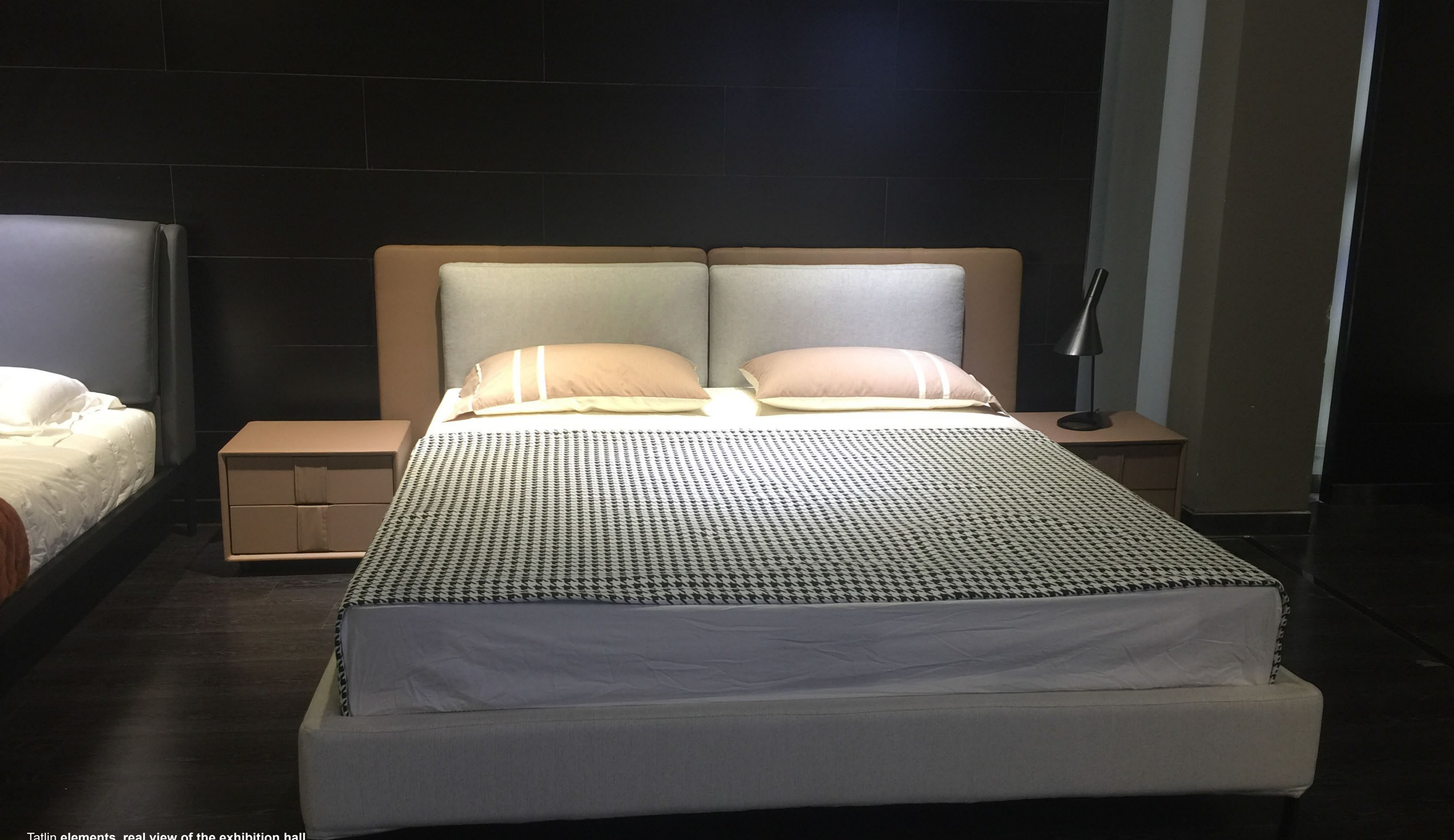
Tatlin elements, real view of the exhibition hall