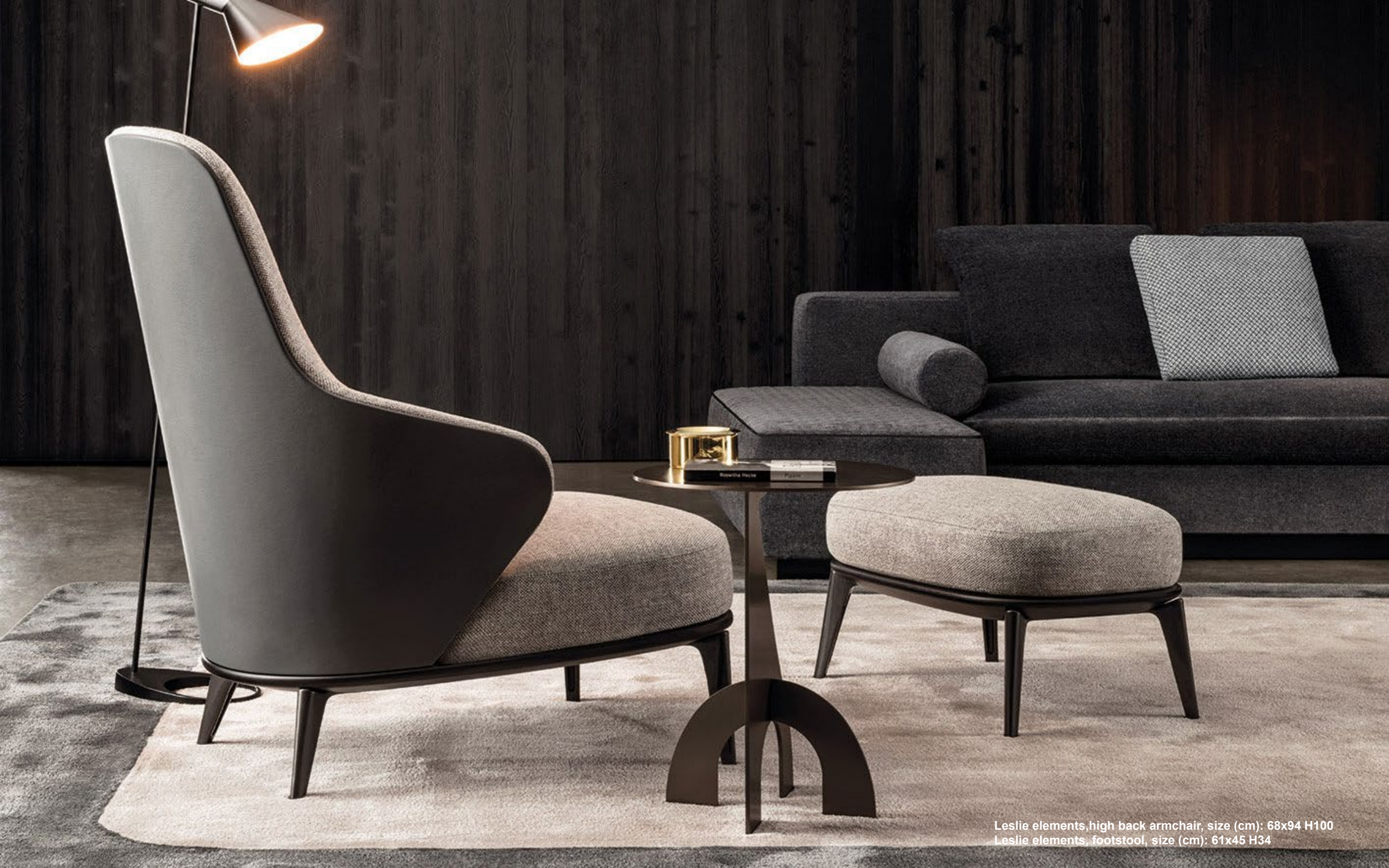
Leslie elements, high back armchair, size (cm): 68x94 H100 Leslie elements, footstool, size (cm): 61x45 H34