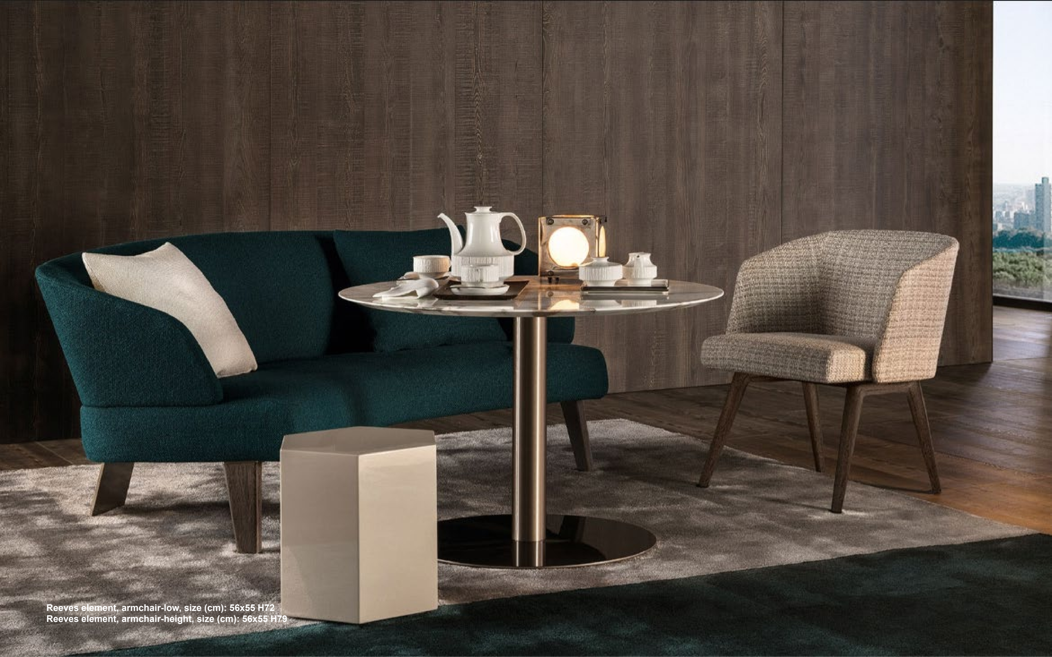
Reeves element, armchair-low, size (cm): 56x55 H72 Reeves element, armchair-height, size (cm): 56x55 H79