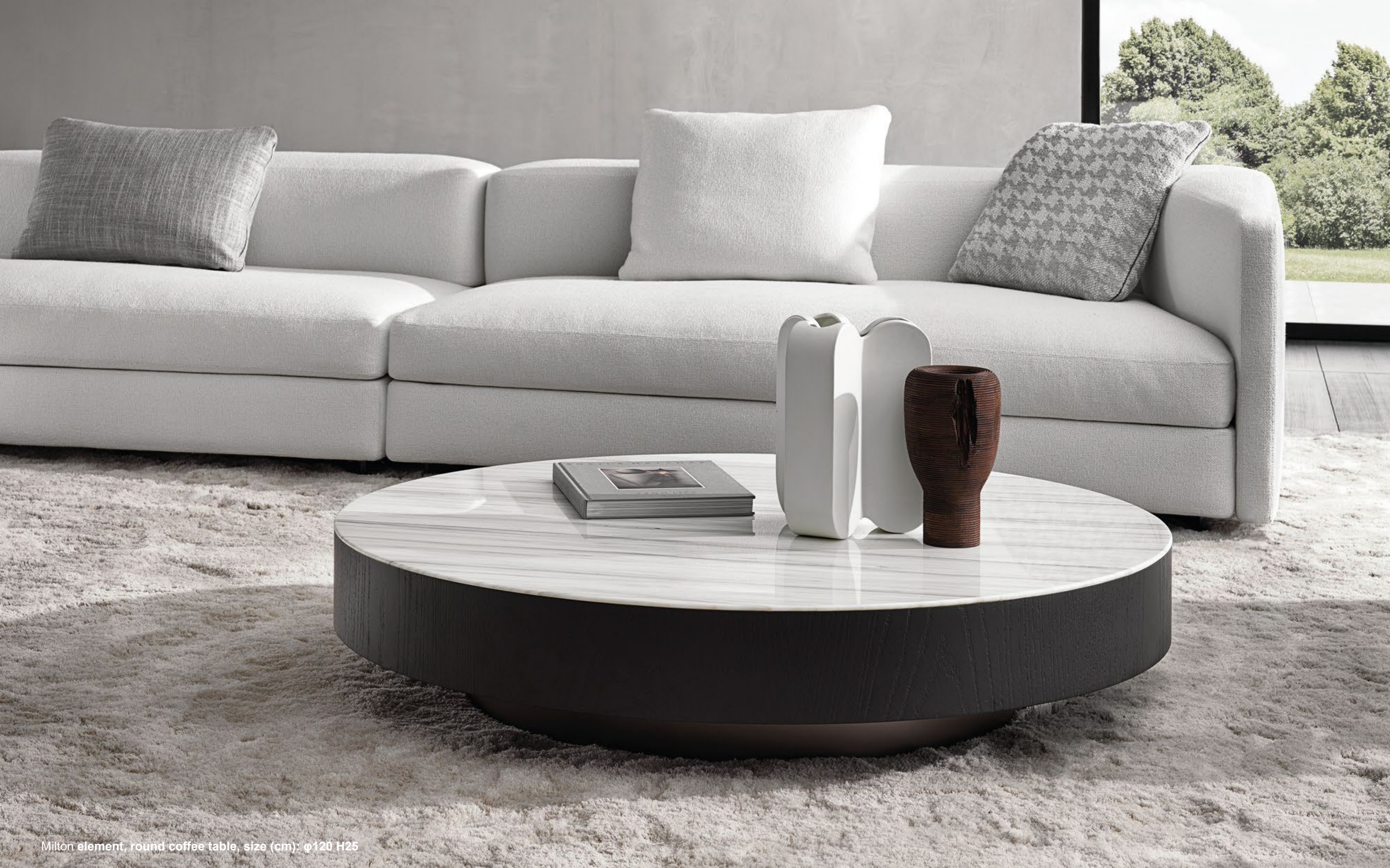
Milton element, round coffee table, size (cm): \phi 120 H25