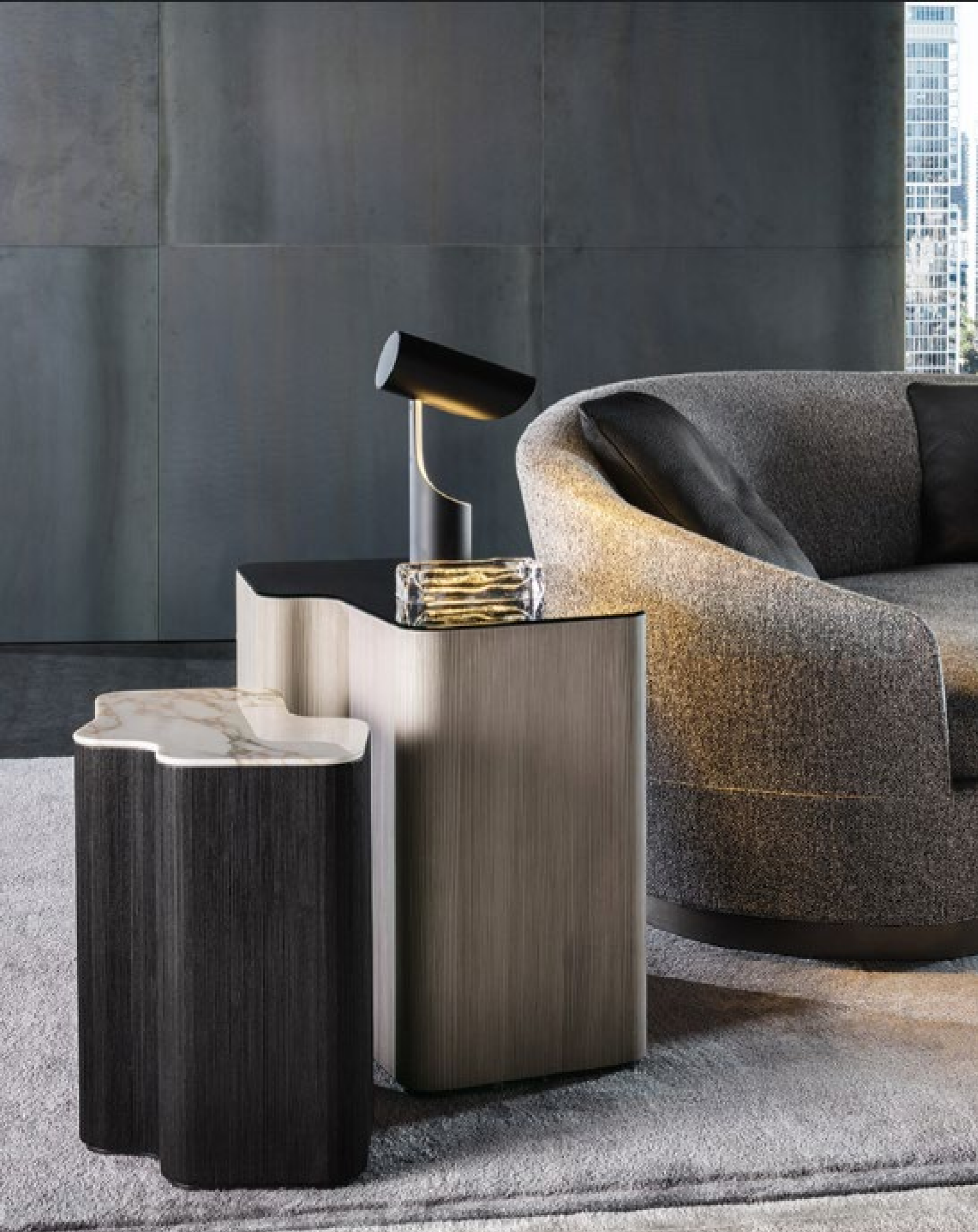
Lou element, small side table-low, size (cm): 41x33 H45 Lou element, large side table-height, size (cm): 61x45 H53