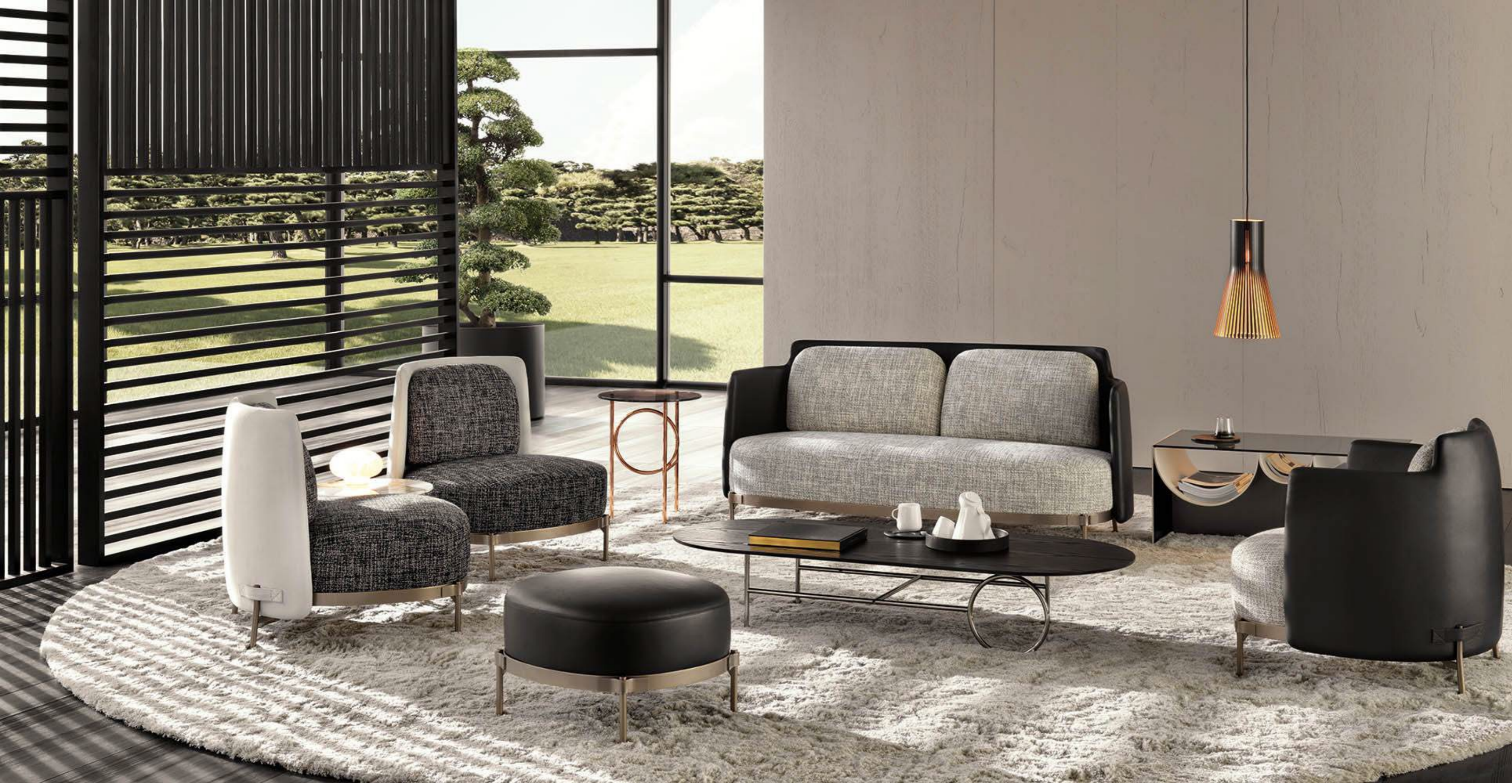
Ring elements, olive type coffee table, size (cm) : 150x65 H28.5