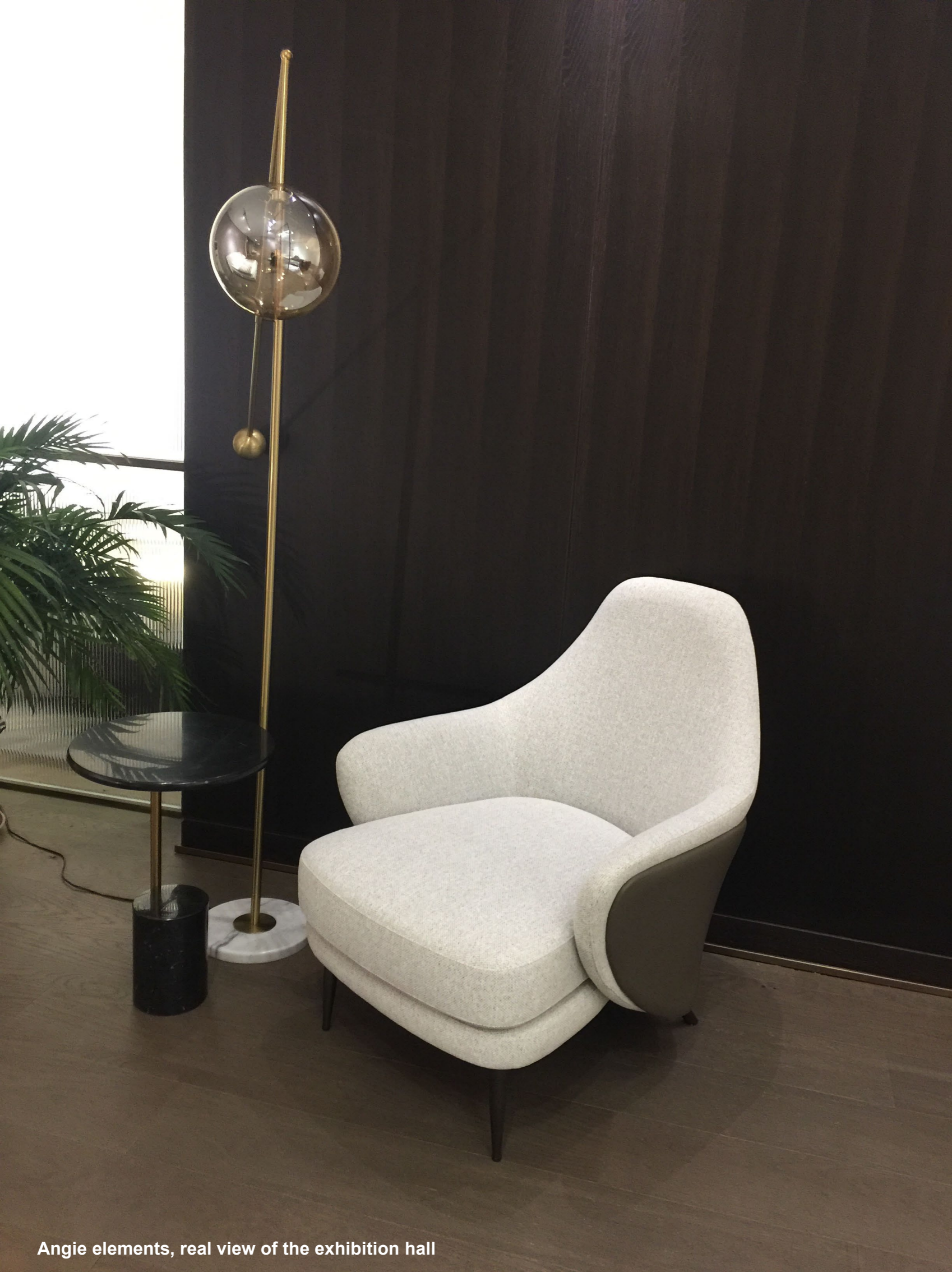
Angie elements, real view of the exhibition hall