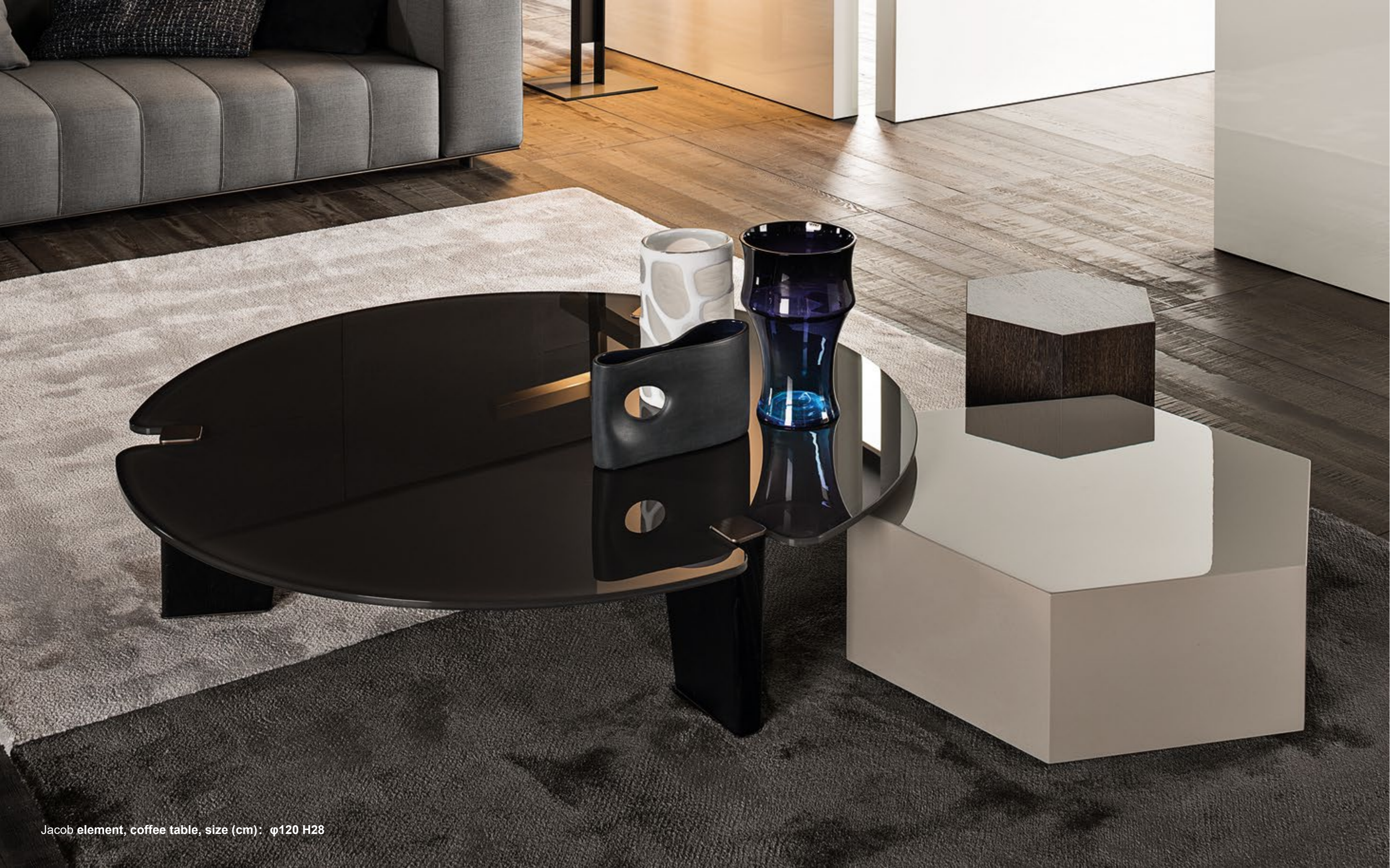
Jacob element, coffee table, size (cm): \phi 120 H28