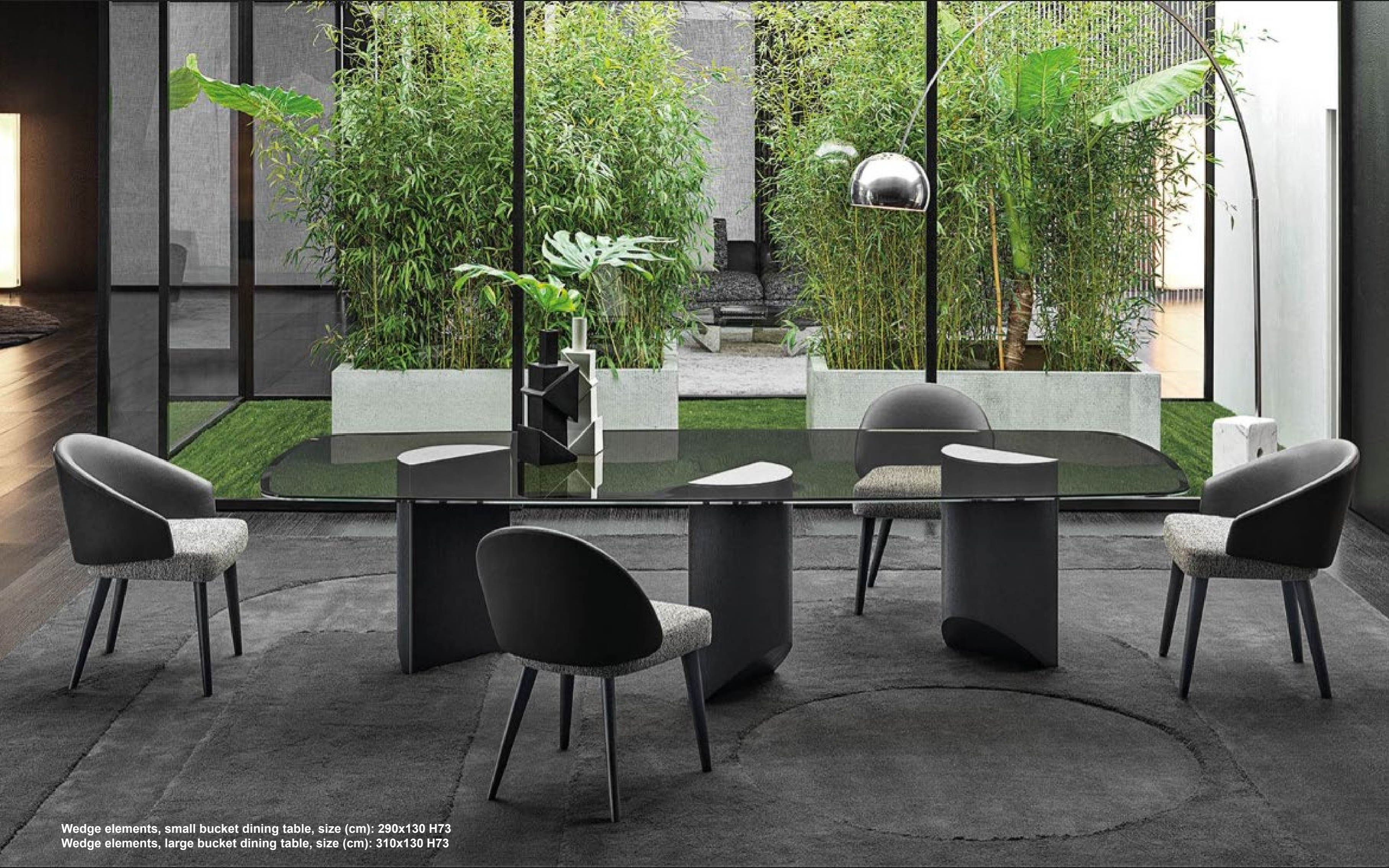
Wedge elements, small bucket dining table, size (cm): 290x130 H73 Wedge elements, large bucket dining table, size (cm): 310x130 H73