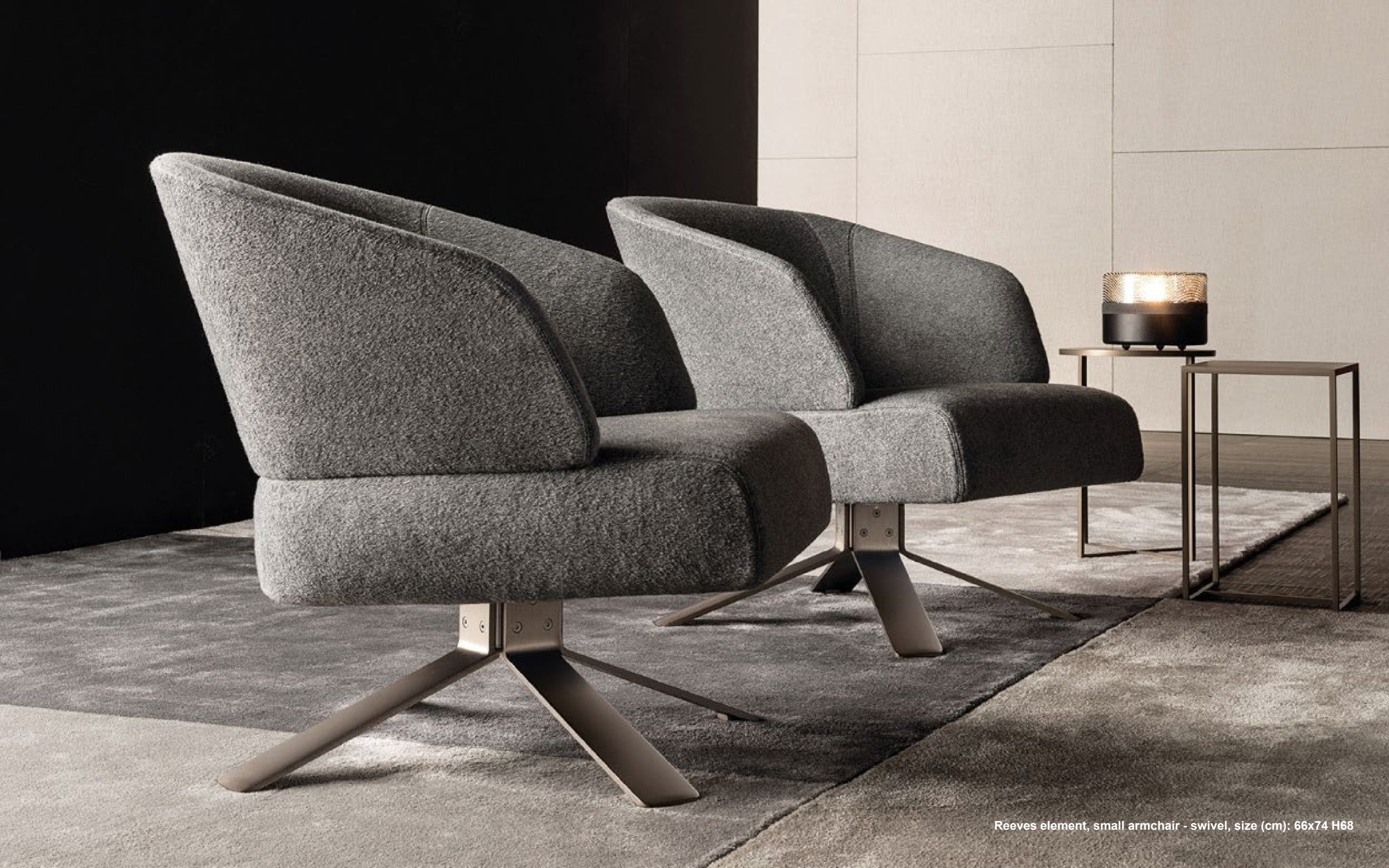
Reeves element, small armchair - swivel, size (cm): 66x74 H68