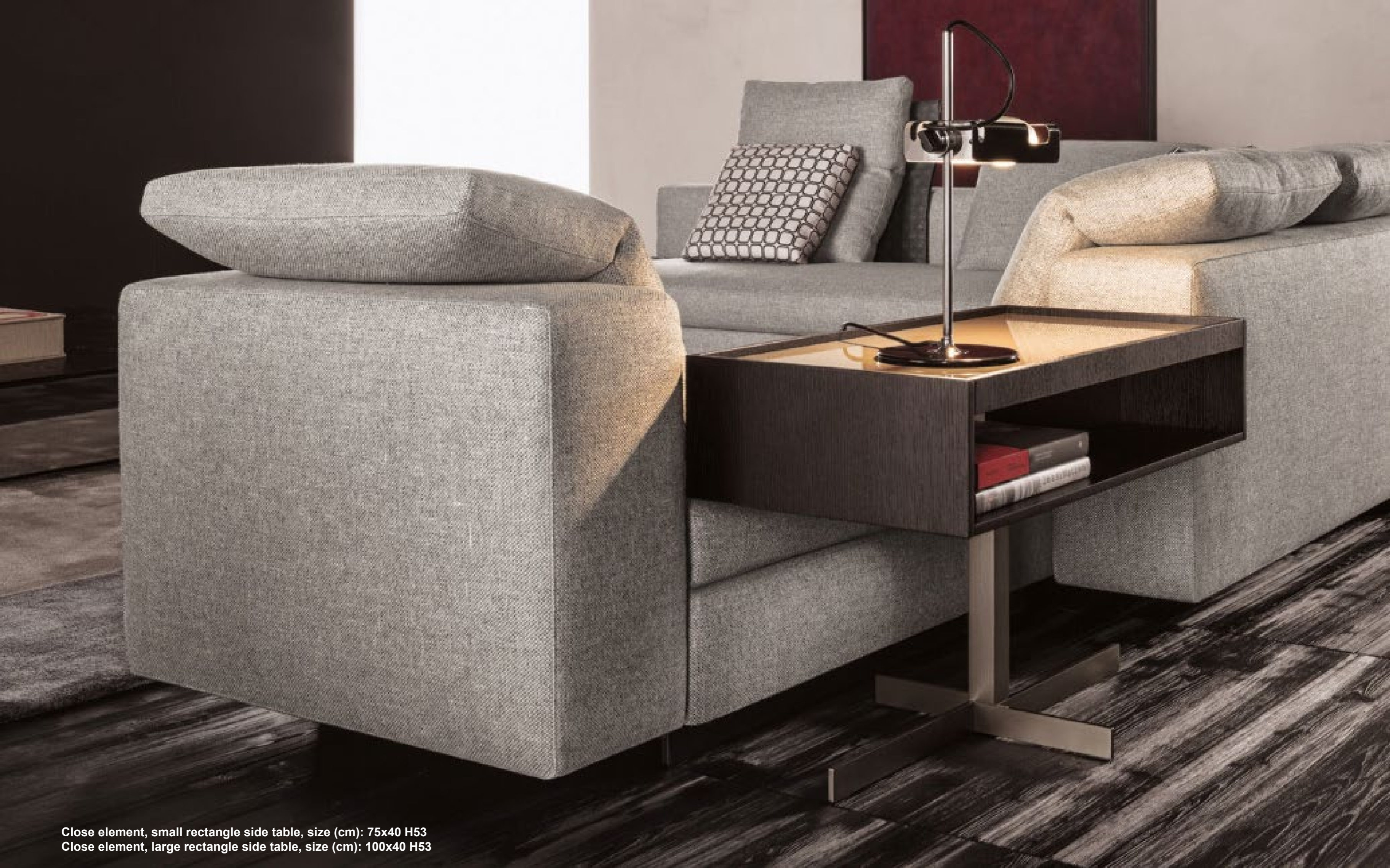
Close element, small rectangle side table, size (cm): 75x40 H53 Close element, large rectangle side table, size (cm): 100x40 H53