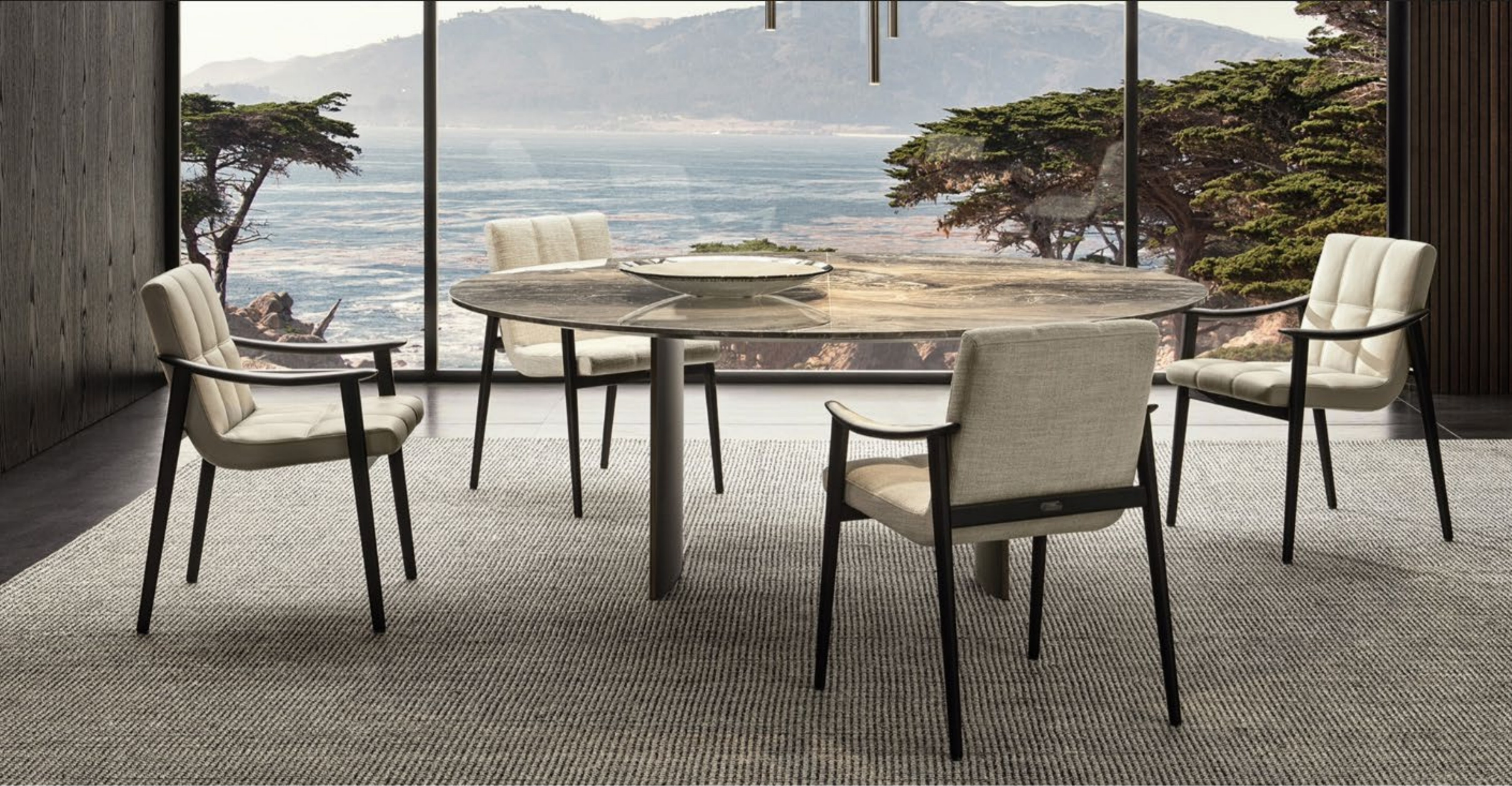
Fynn elements, armchair, size (cm): 61x63 H82