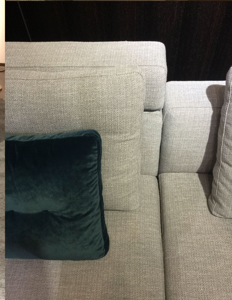
Alexander elements, real view of the exhibition hall