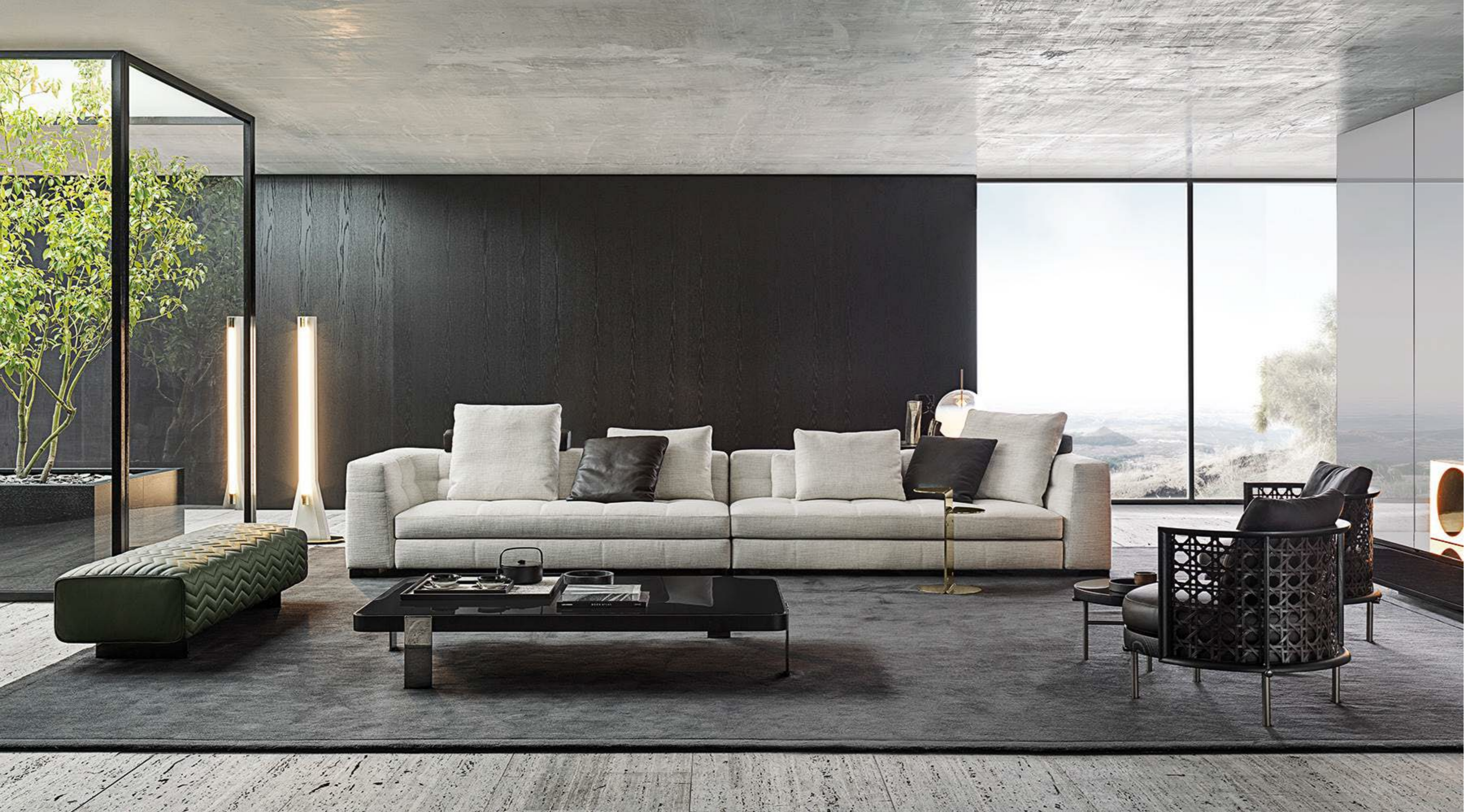
Blazer elements, with an armrest. Size (cm): 213x143 H86 Blazer elements, with an armrest. Size (cm): 213x143 H86