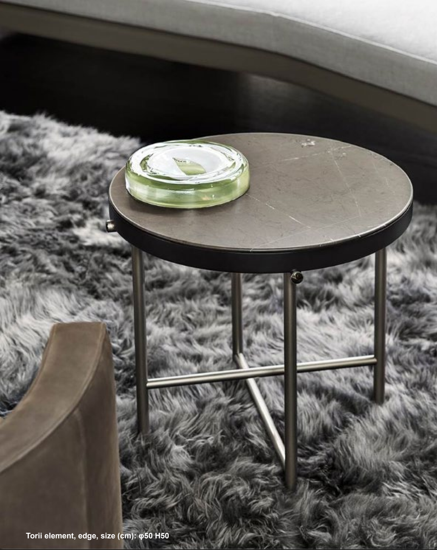
Torii element, edge, size (cm): \phi 50 H50