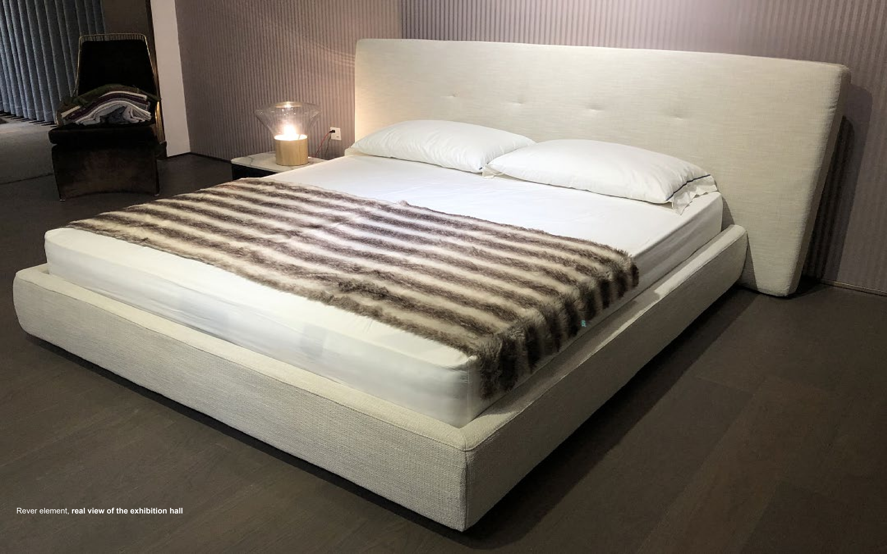
Rever element, real view of the exhibition hall