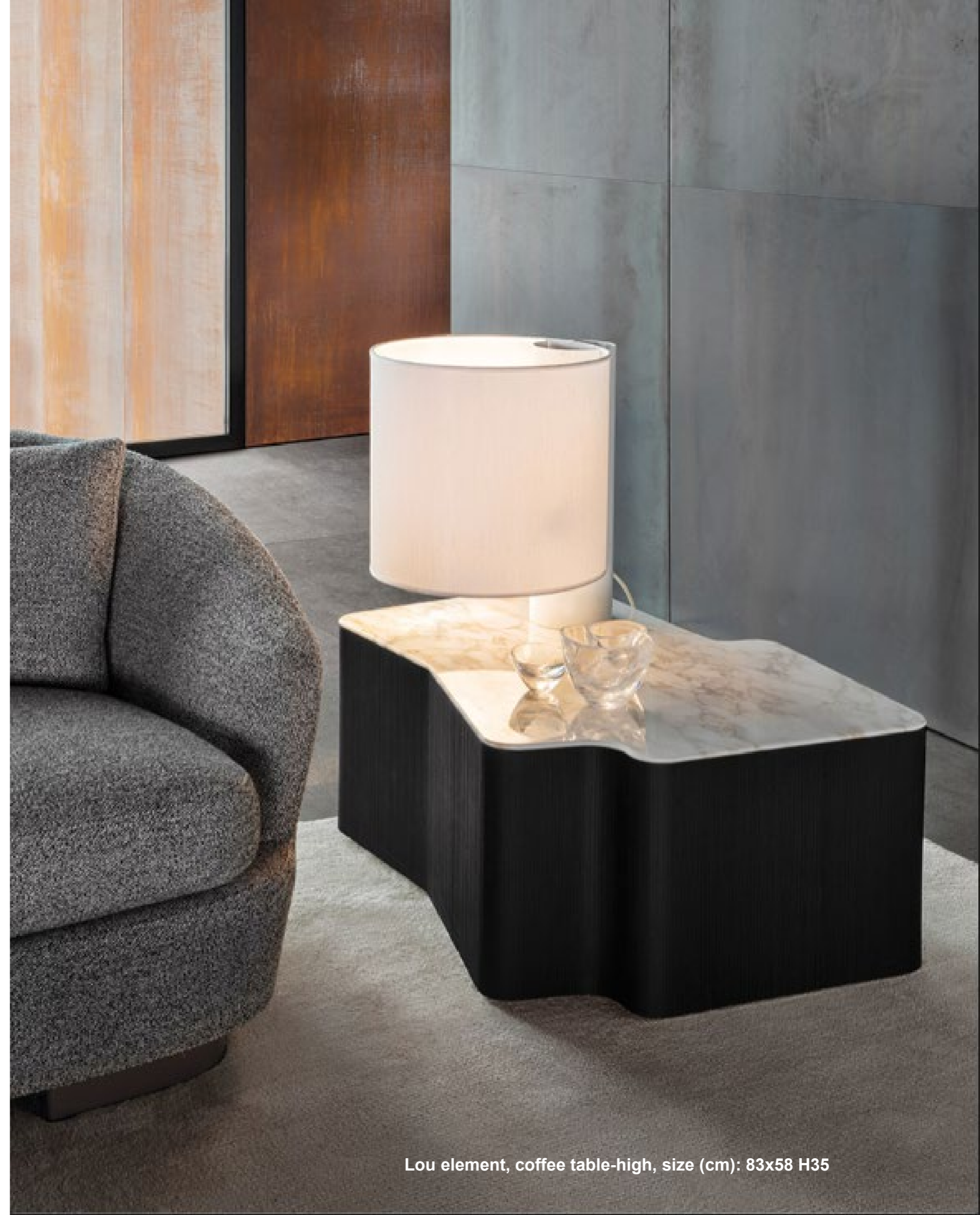
Lou element, coffee table-high, size (cm): 83x58 H35