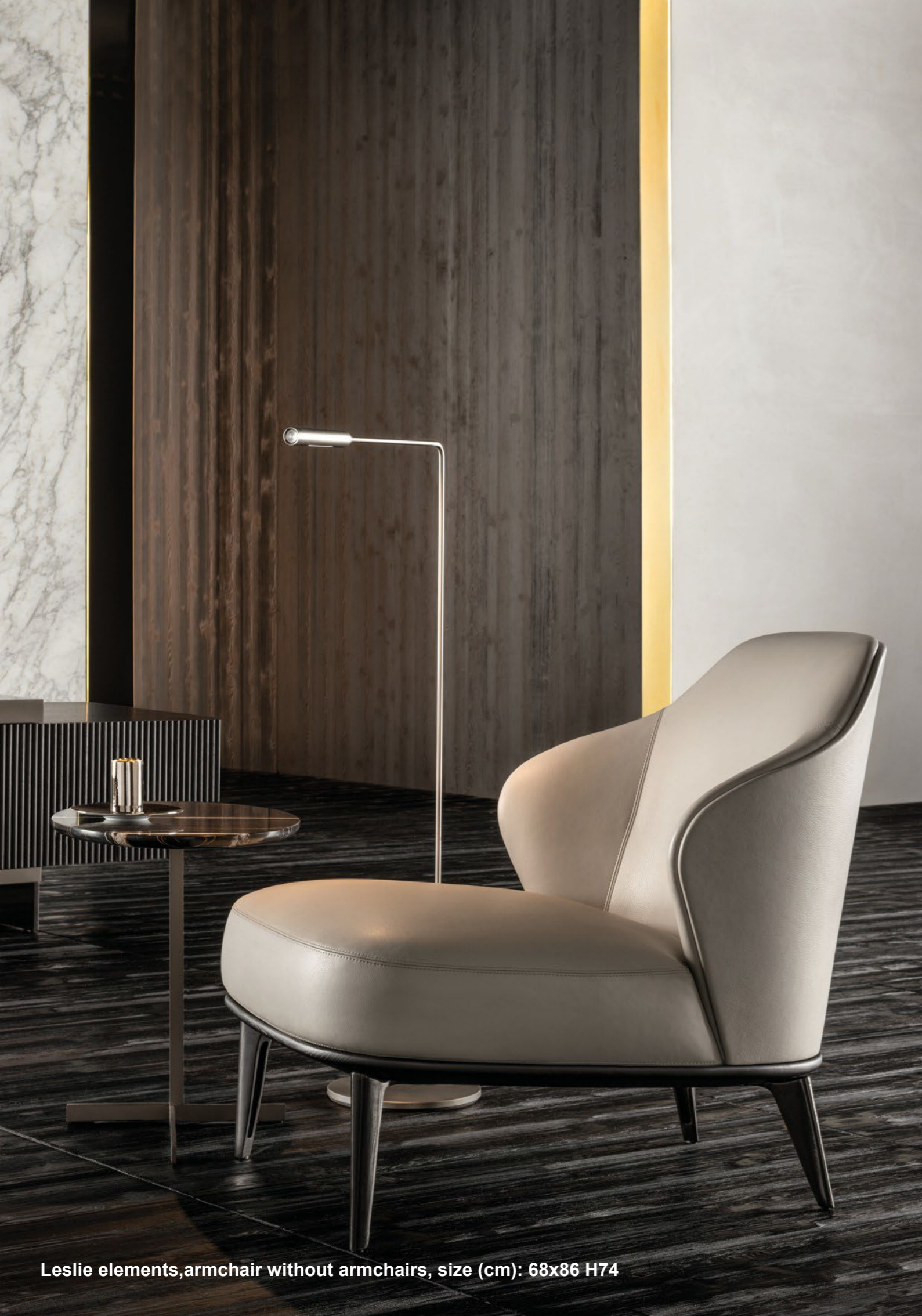
Leslie elements, armchair without armchairs, size (cm): 68x86 H74