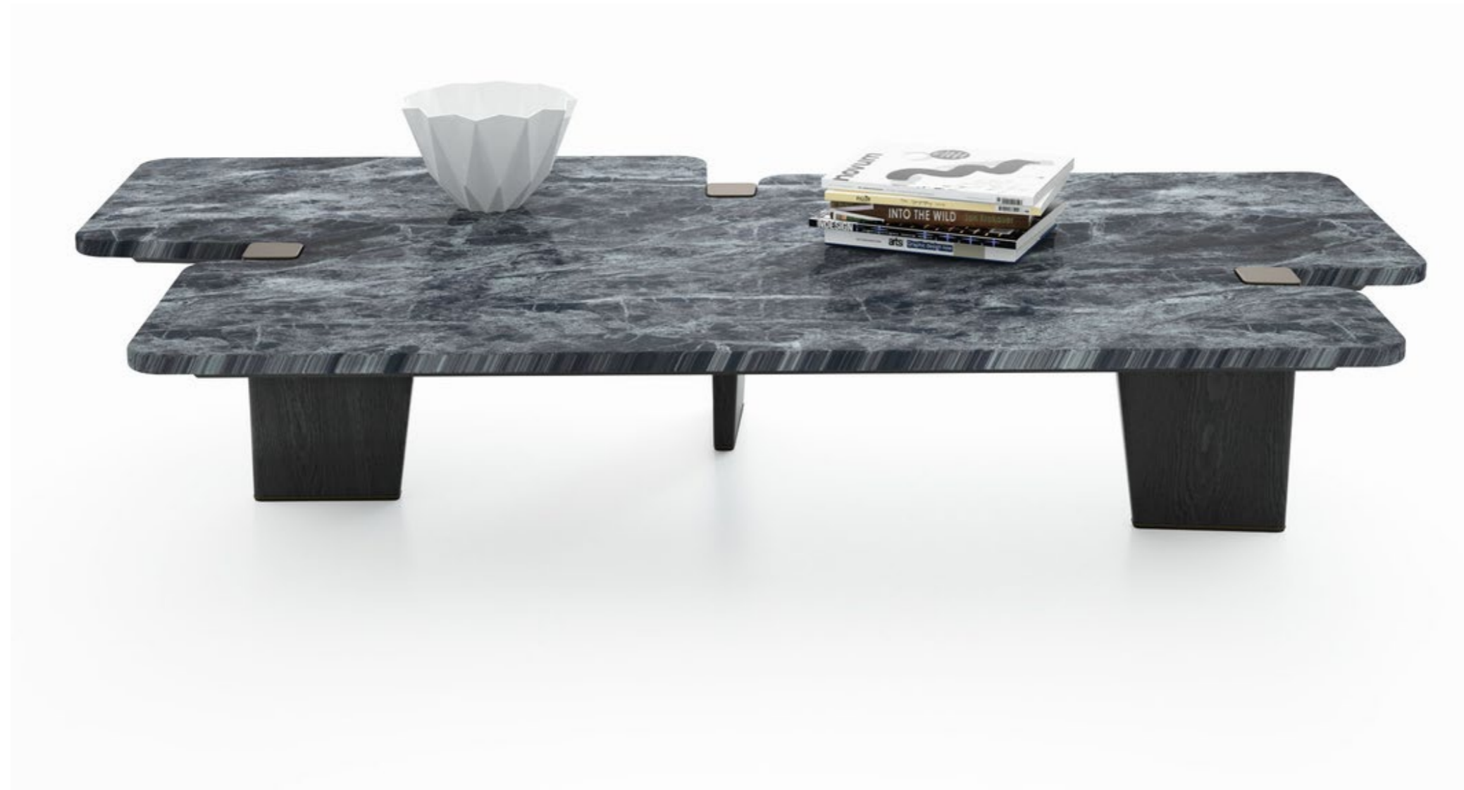
Jacob element, Medium-sized geometric coffee table - low, size (cm): 148x8 H22 Jacob element, Medium-sized geometric coffee table - high, size (cm): 148x8 H28