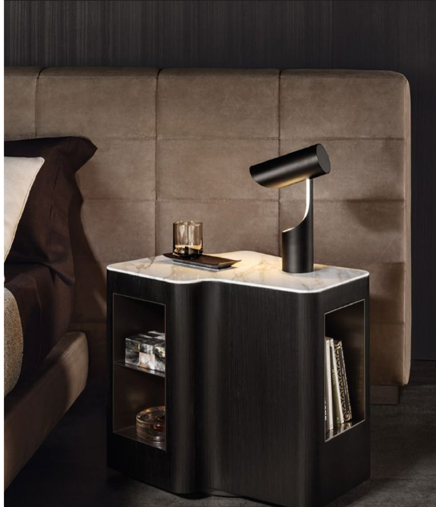
Lou element, rotating side, size (cm): 61x45 H54