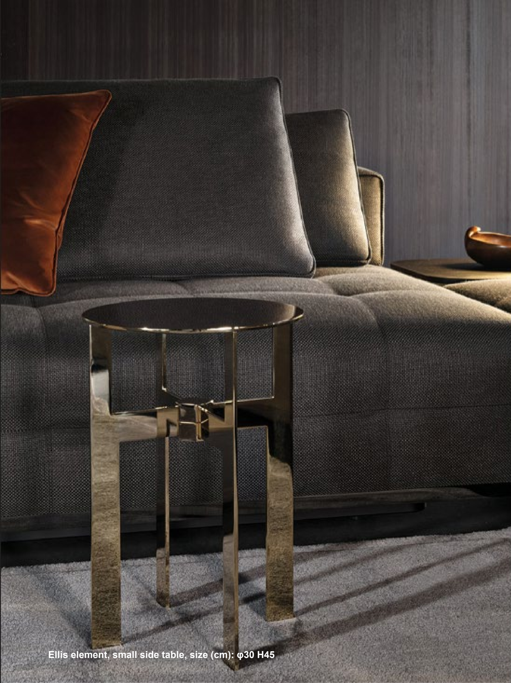
Ellis element, small side table, size (cm): \varnothing 30 H45