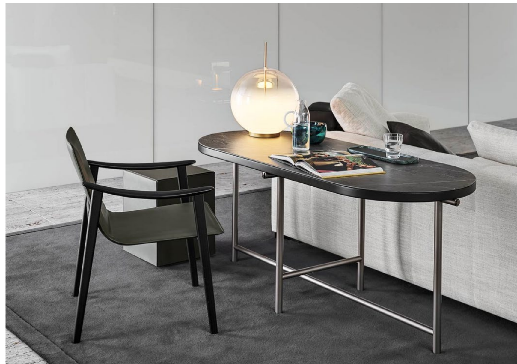
Torii element, edge, size (cm): 150X65 H30