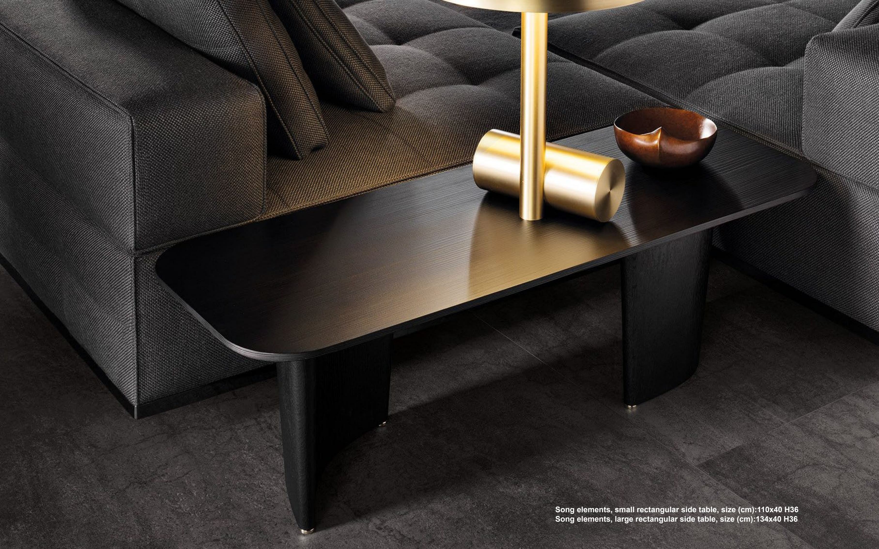
Song elements, small rectangular side table, size (cm):110x40 H36 Song elements, large rectangular side table, size (cm):134x40 H36