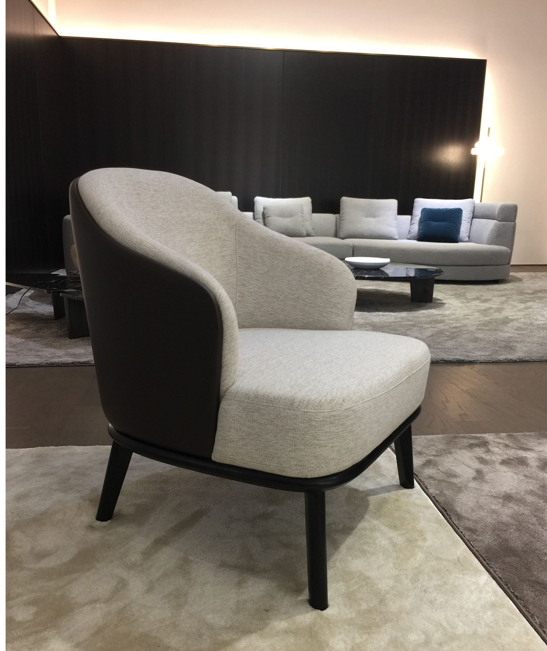
Leslie elements, real view of the exhibition hall