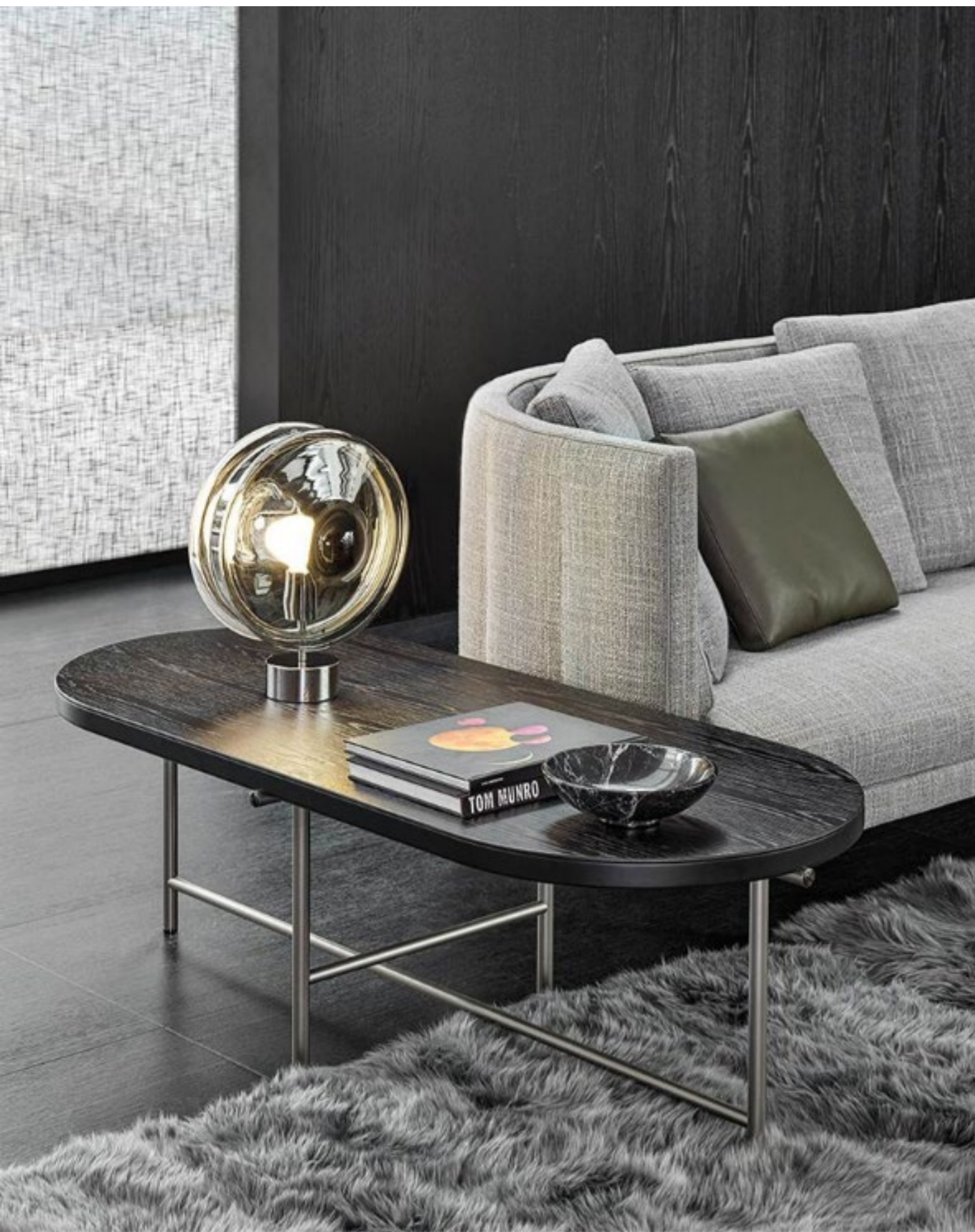
Torii element, coffee table, size (cm): 150X65 H30