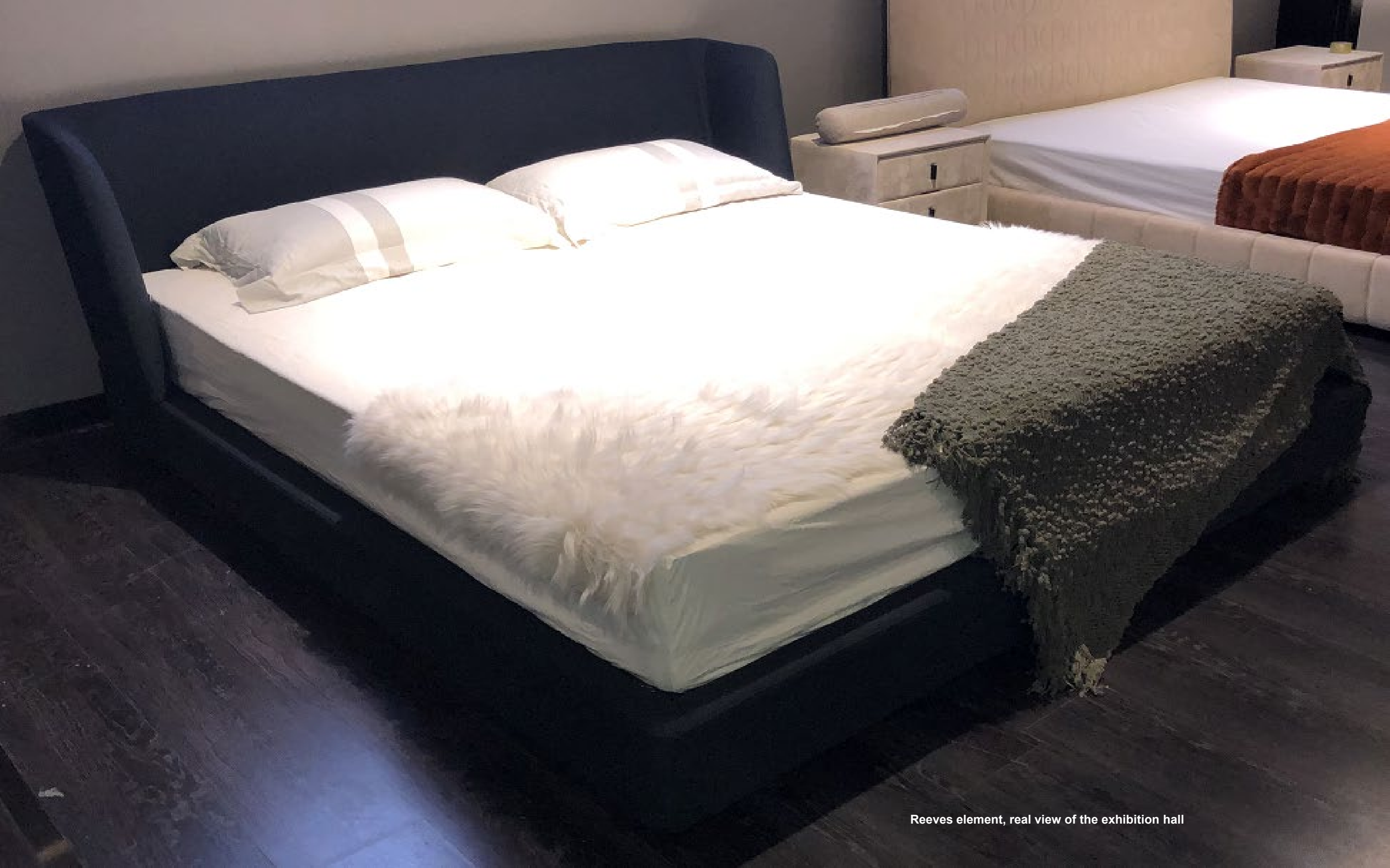
Reeves element, real view of the exhibition hall