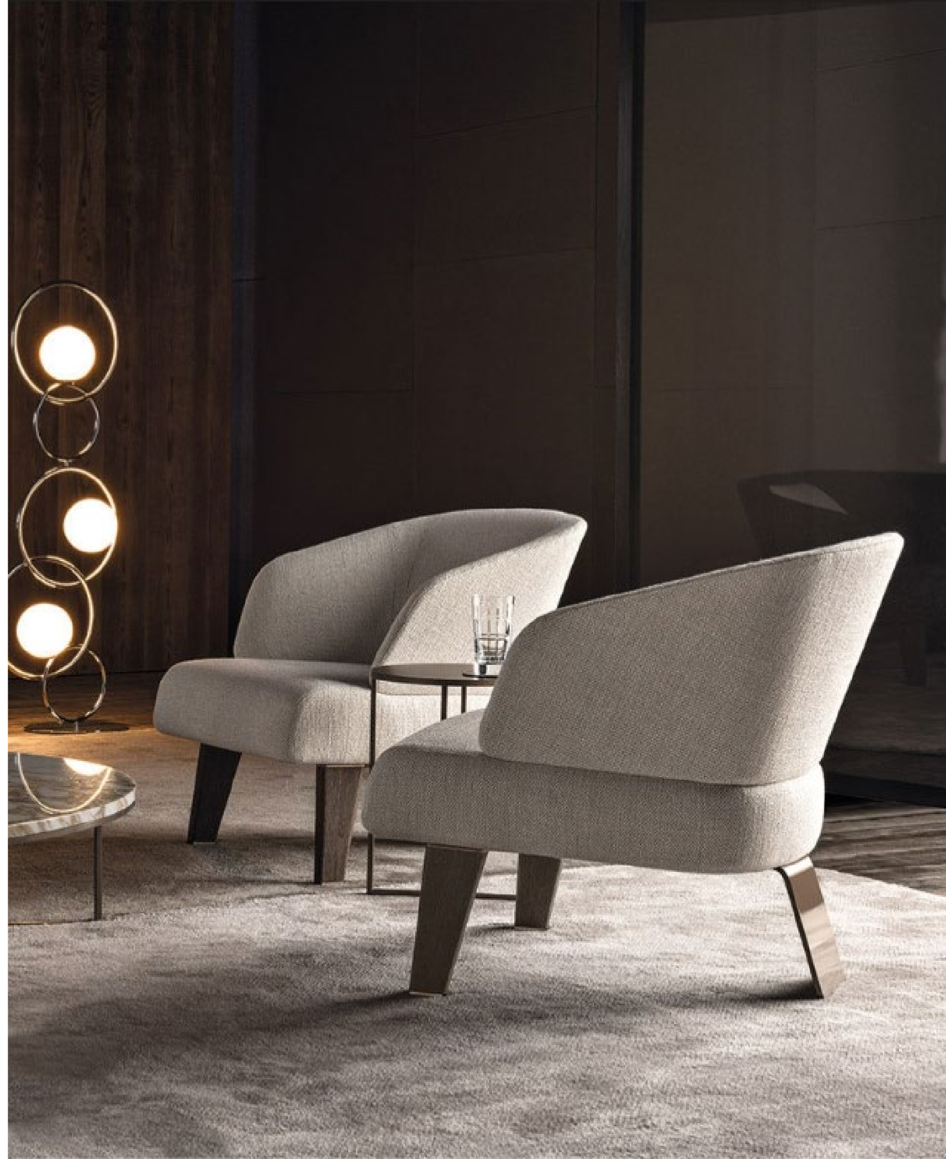
Lawson element, small armchair - fixed, size (cm): 79x89 H80