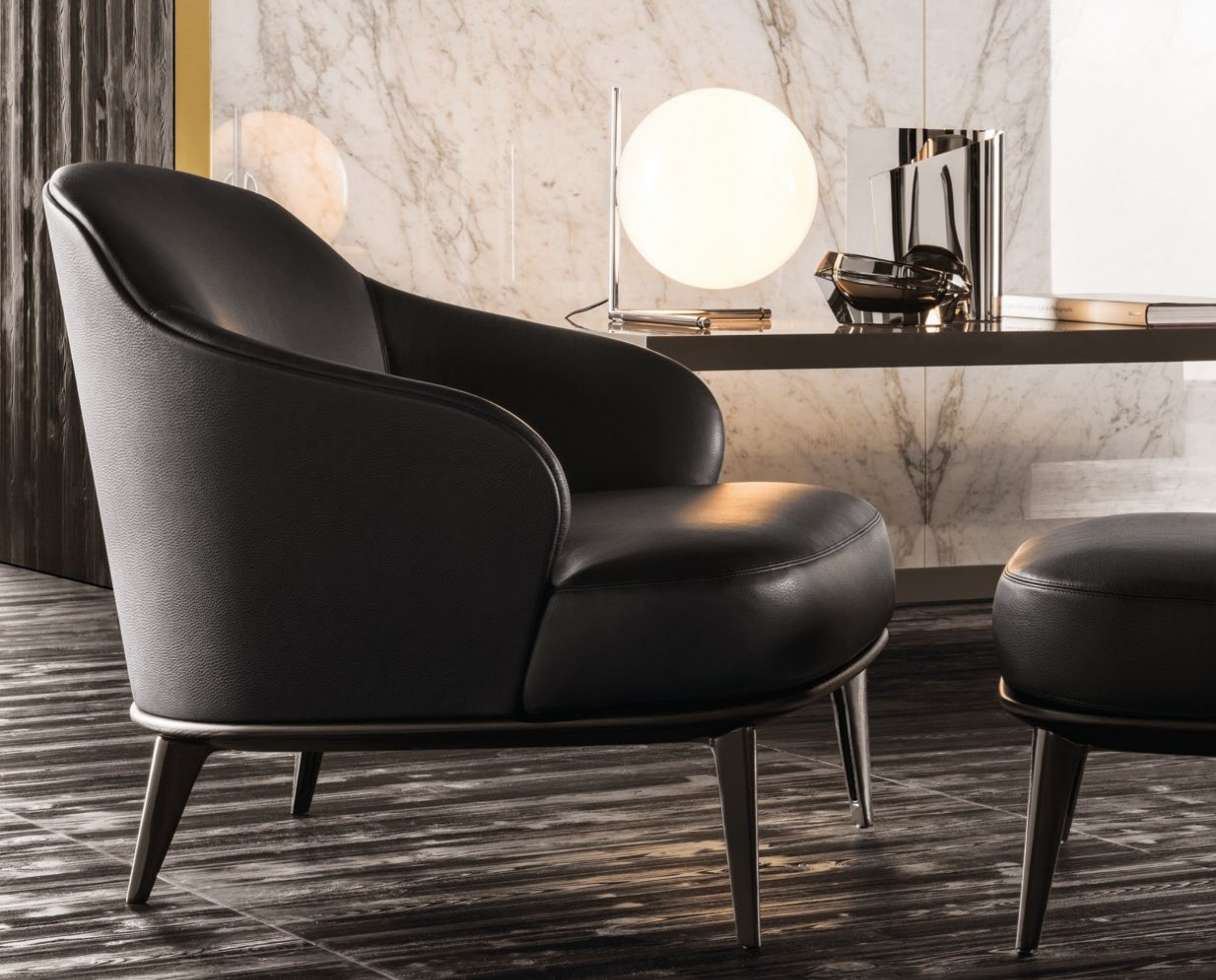
Leslie element, armchair, size (cm): 78x87 H75