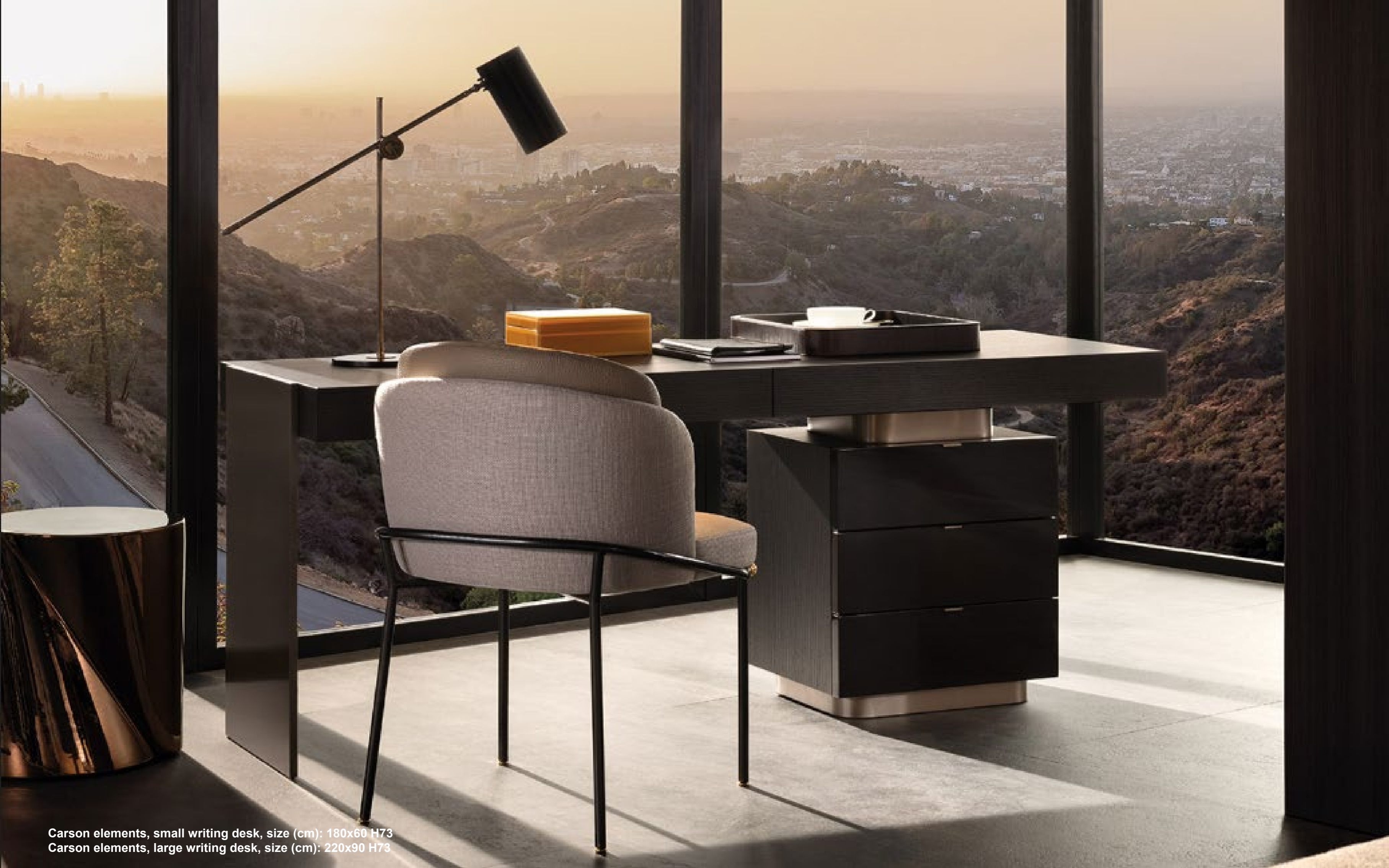
Carson elements, small writing desk, size (cm): 180x60 H73 Carson elements, large writing desk, size (cm): 220x90 H73