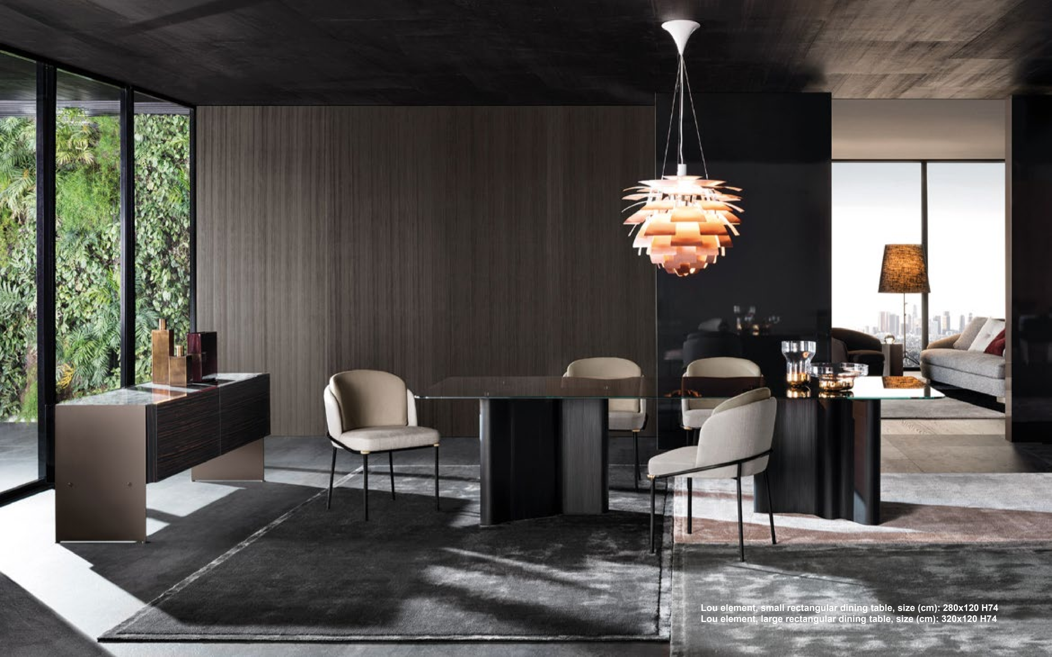
Lou element, small rectangular dining table, size (cm): 280x120 H74 Lou element, large rectangular dining table, size (cm): 320x120 H74