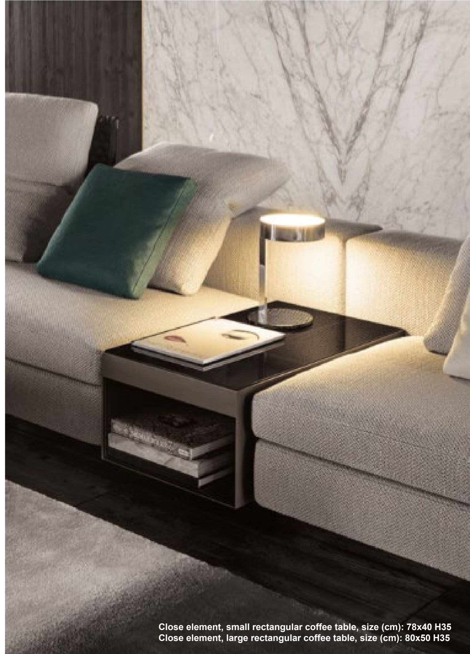
Close element, small rectangular coffee table, size (cm): 78x40 H35 Close element, large rectangular coffee table, size (cm): 80x50 H35