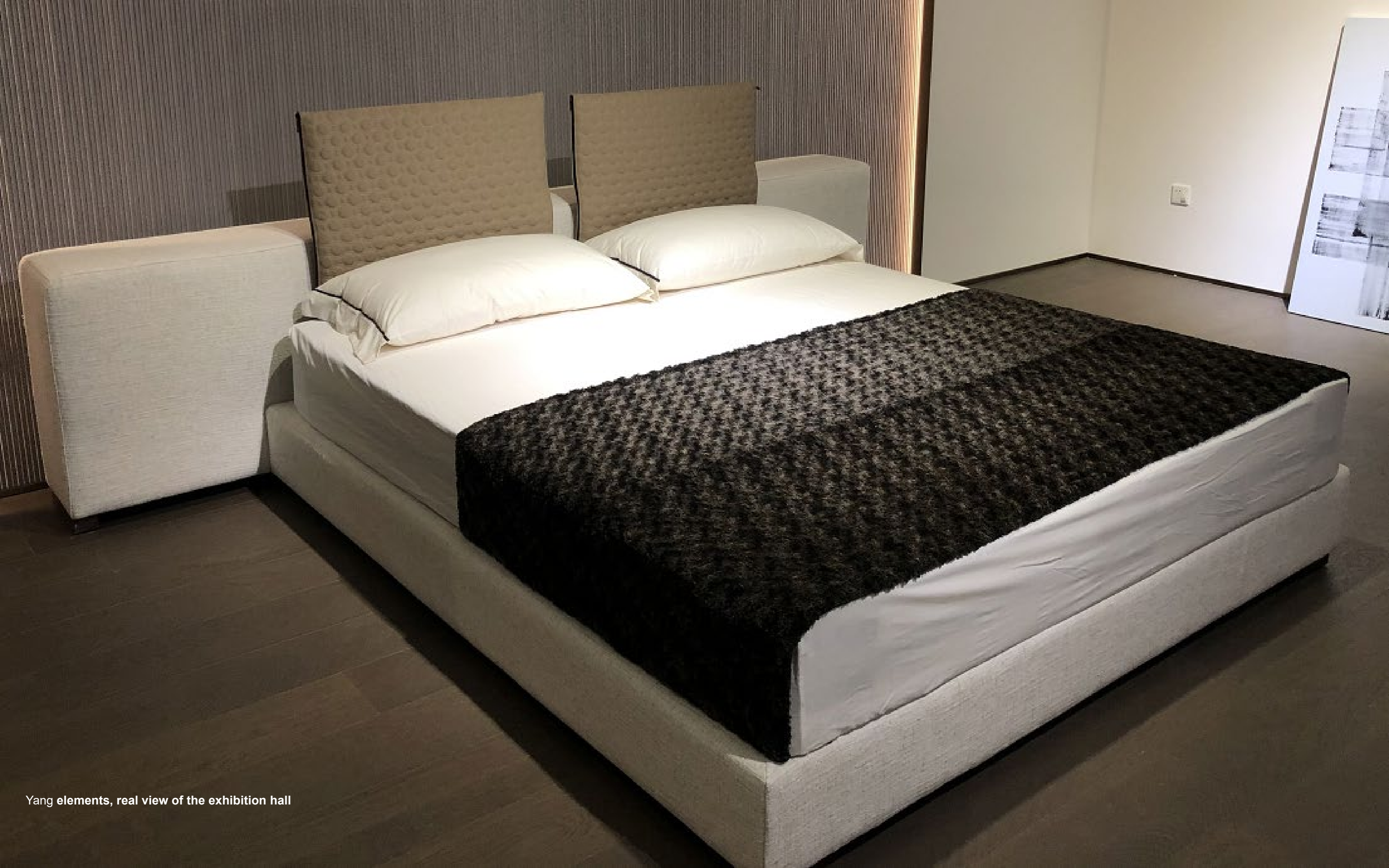
Yang elements, real view of the exhibition hall