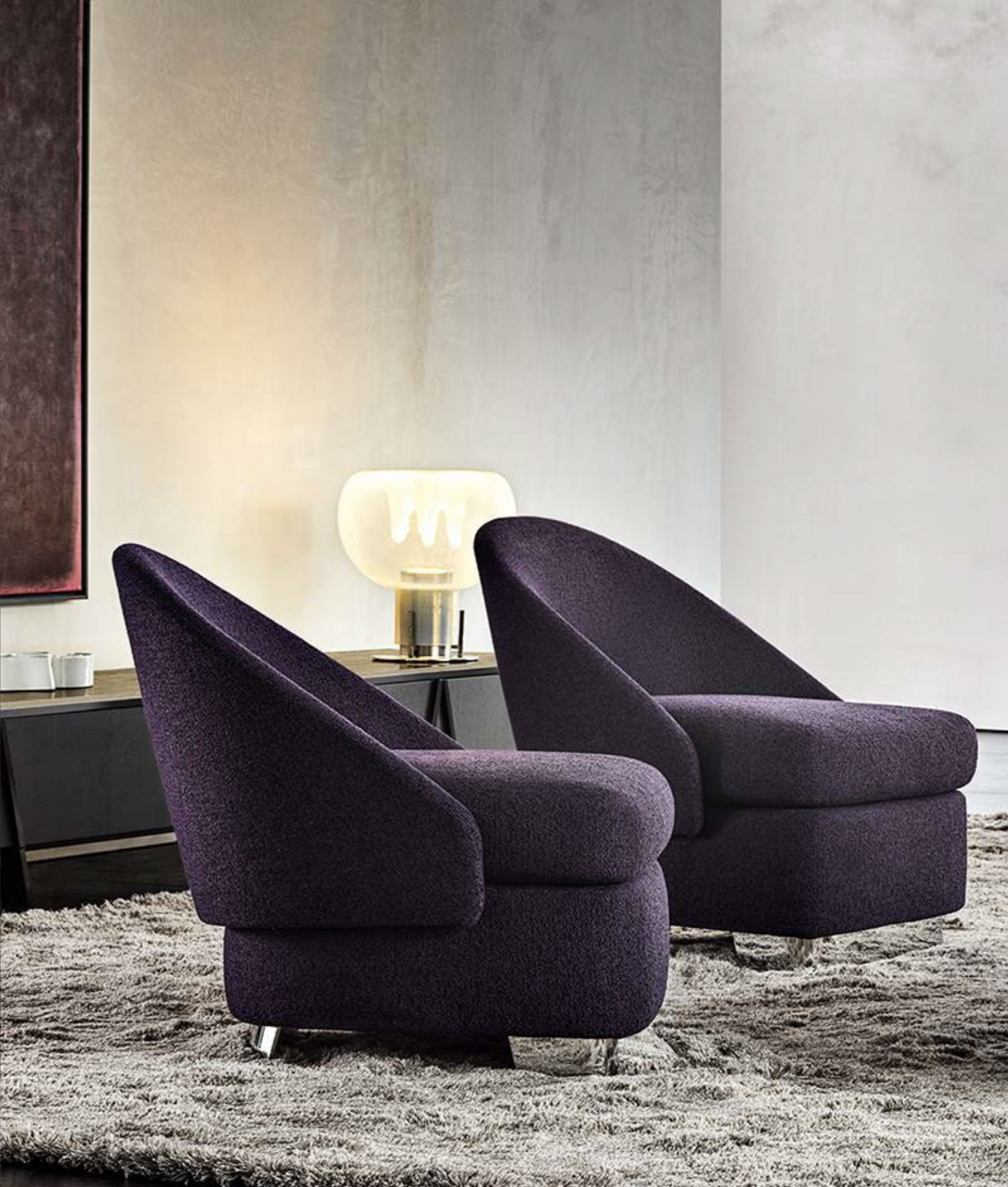
Lawson elements, lounge armchair, size (cm): 72x78 H74