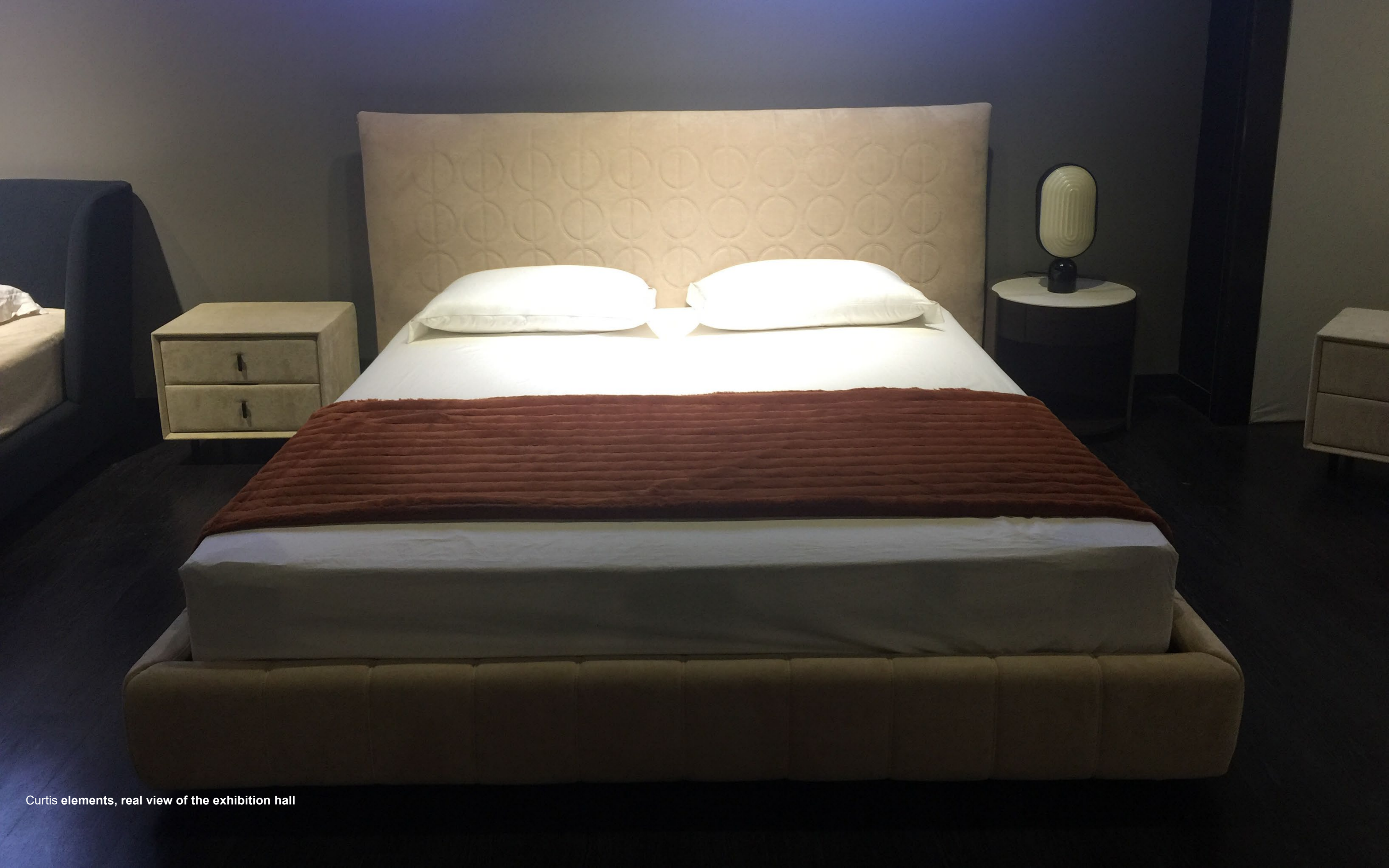
Curtis elements, real view of the exhibition hall