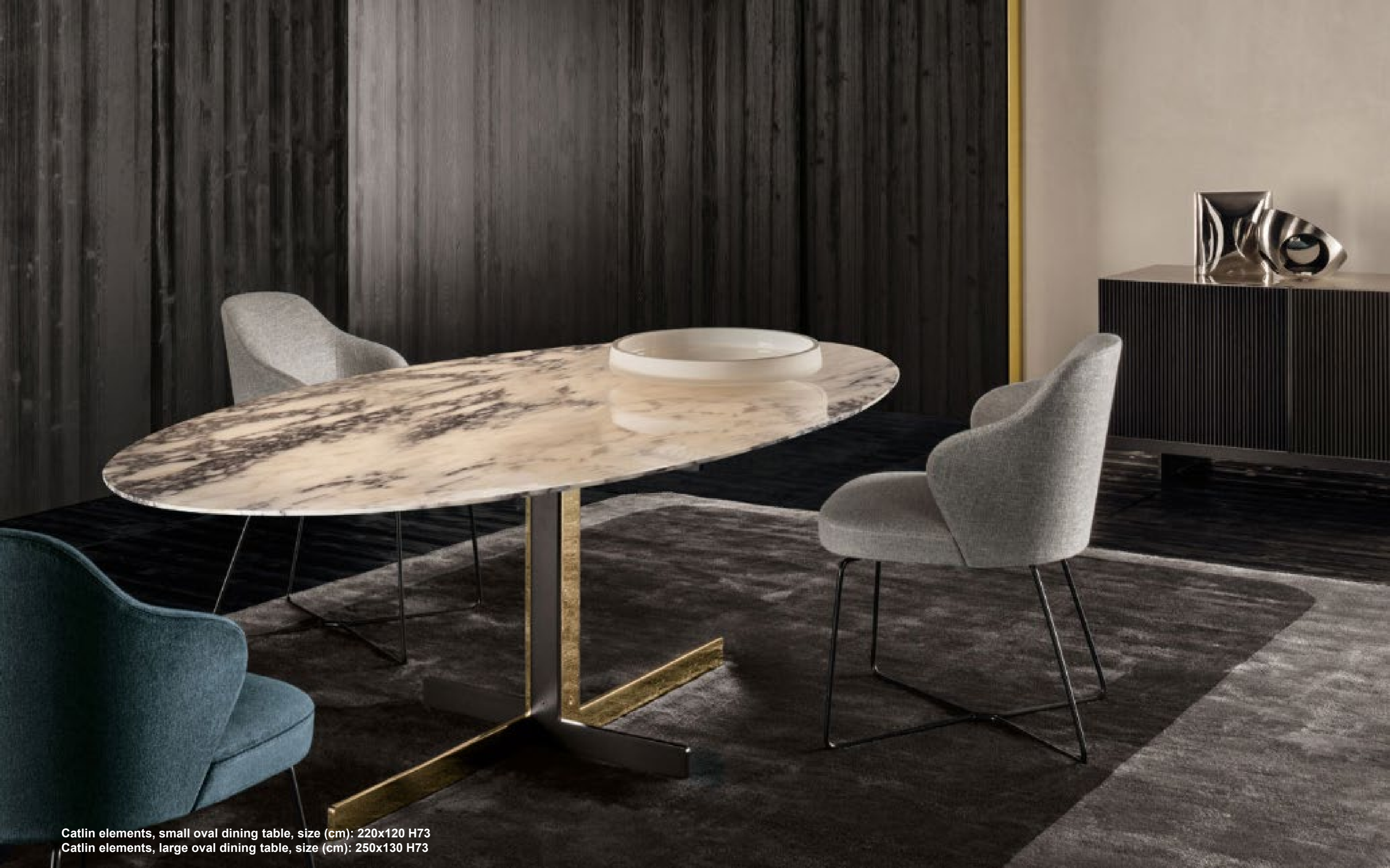
Catlin elements, small oval dining table, size (cm): 220x120 H73 Catlin elements, large oval dining table, size (cm): 250x130 H73