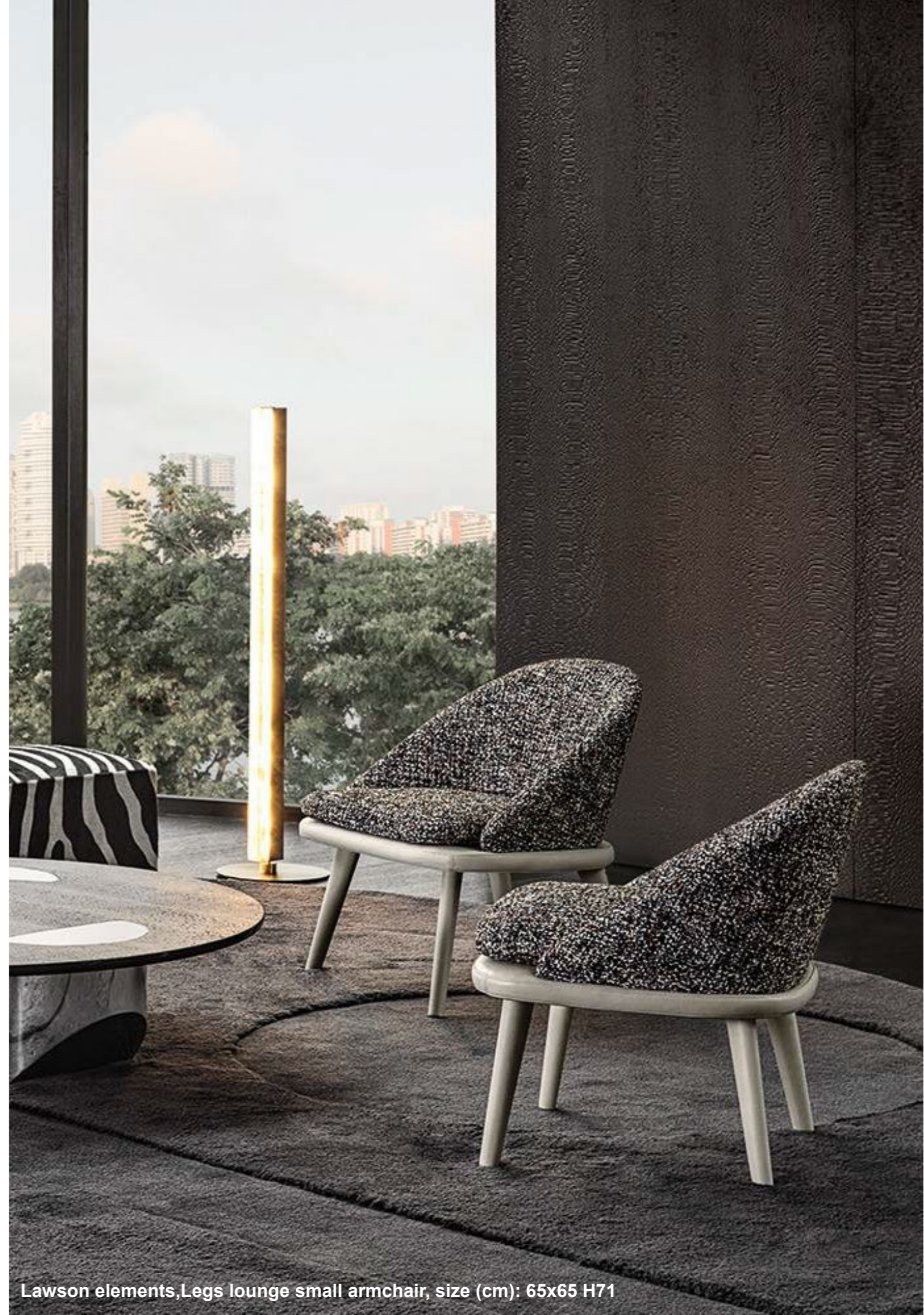
Lawson elements, Legs lounge small armchair, size (cm): 65x65 H71