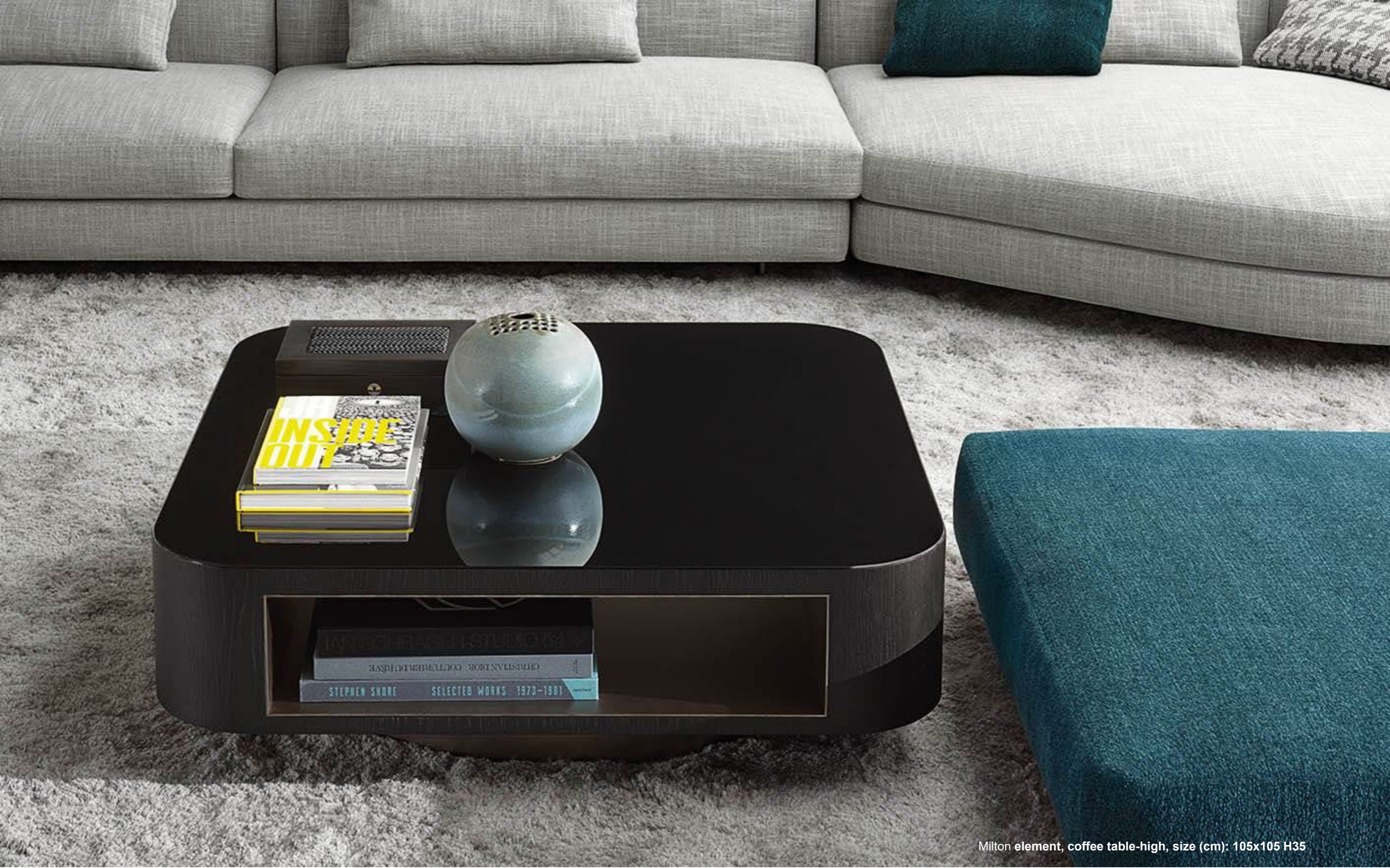
Milton element, coffee table-high, size (cm): 105x105 H35