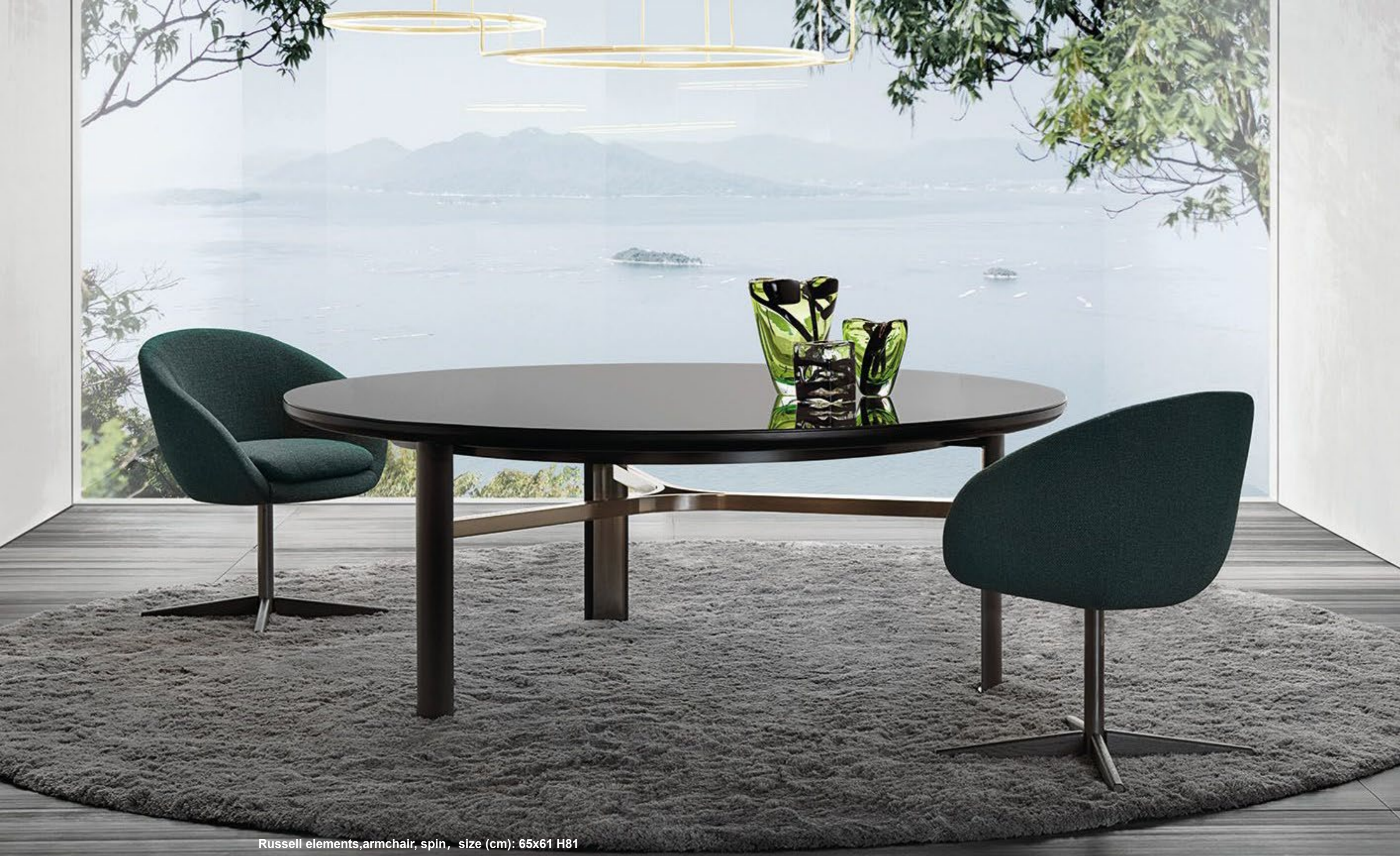
Russell elements, armchair, spin, size (cm): 65x61 H81