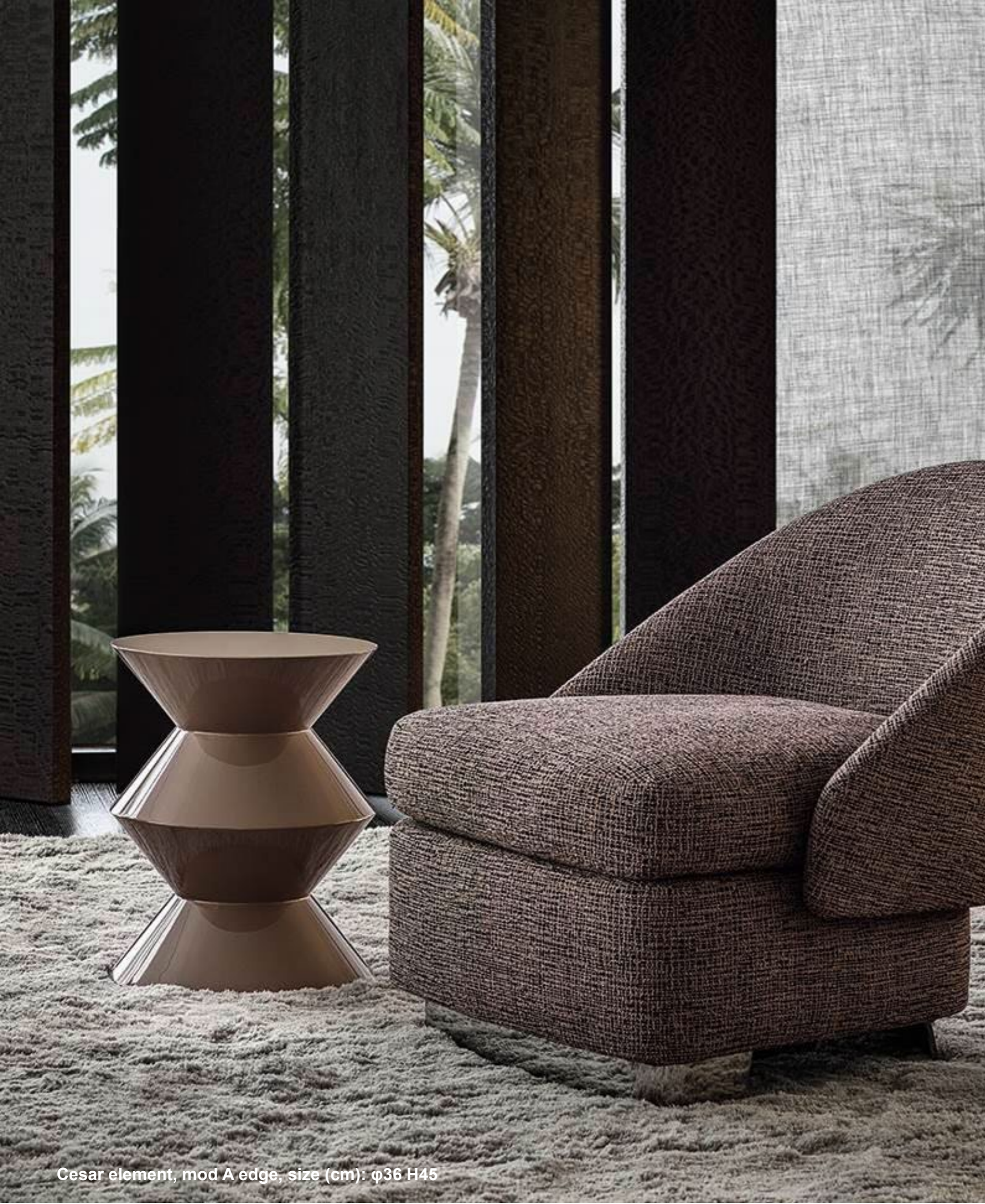
Cesar element, mod A edge, size (cm): \varnothing 36 H45