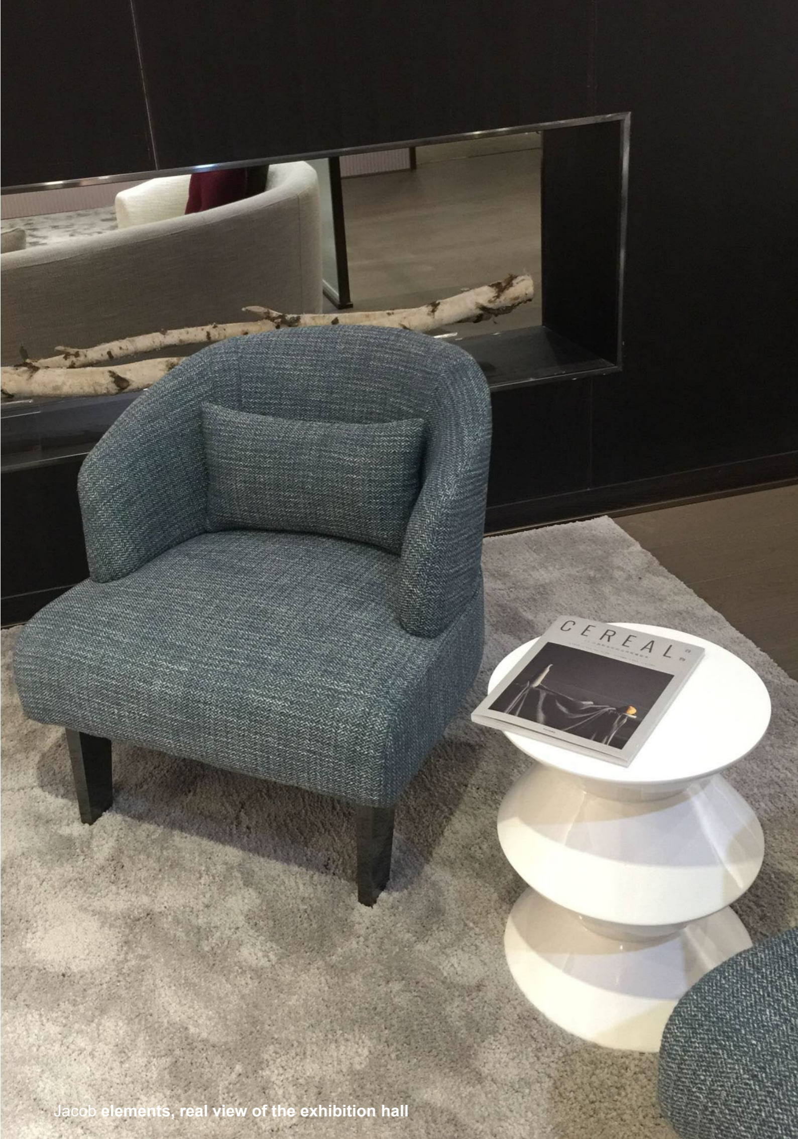
Jacob elements, real view of the exhibition hall