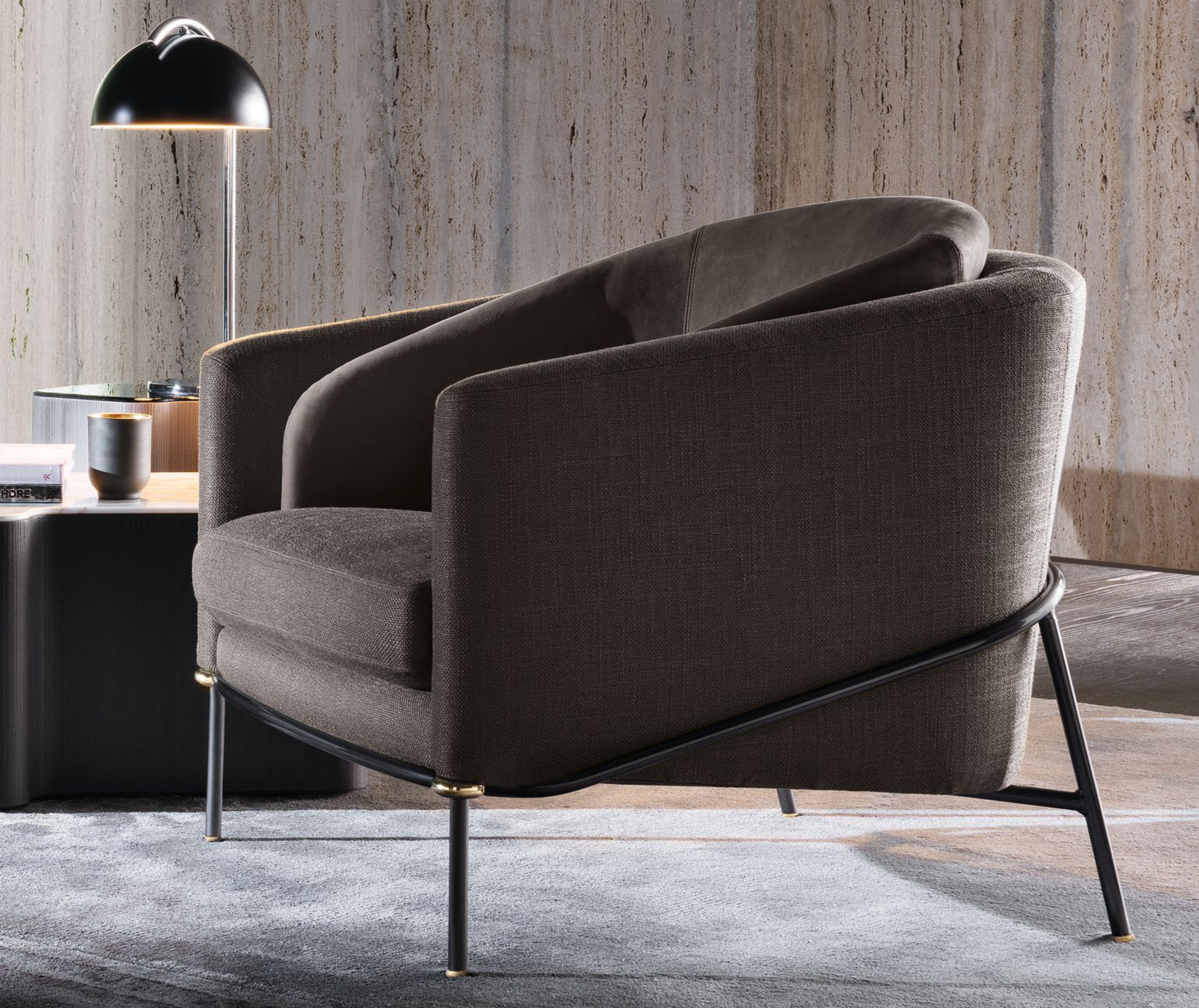
Fil Noir element, armchair, size (cm): 79x84 H75