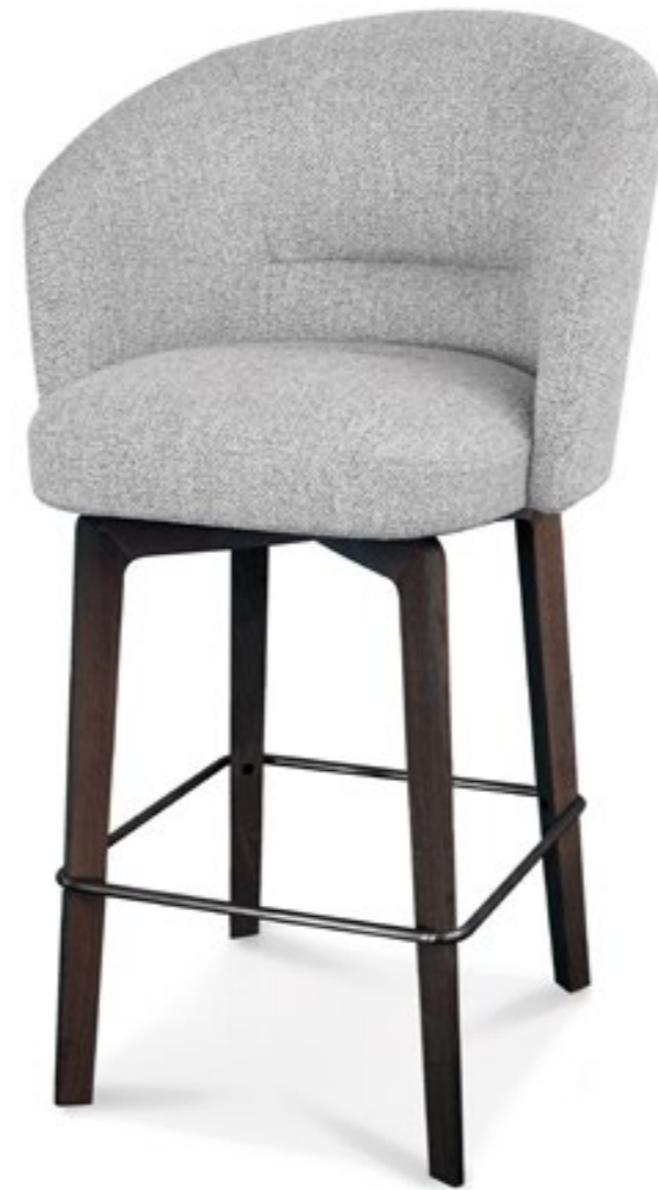
Amelie elements, bar chair-low, rotating, size (cm): 57x61 H96 Amelie elements, bar chair-high, rotating, size (cm): 57x61 H109