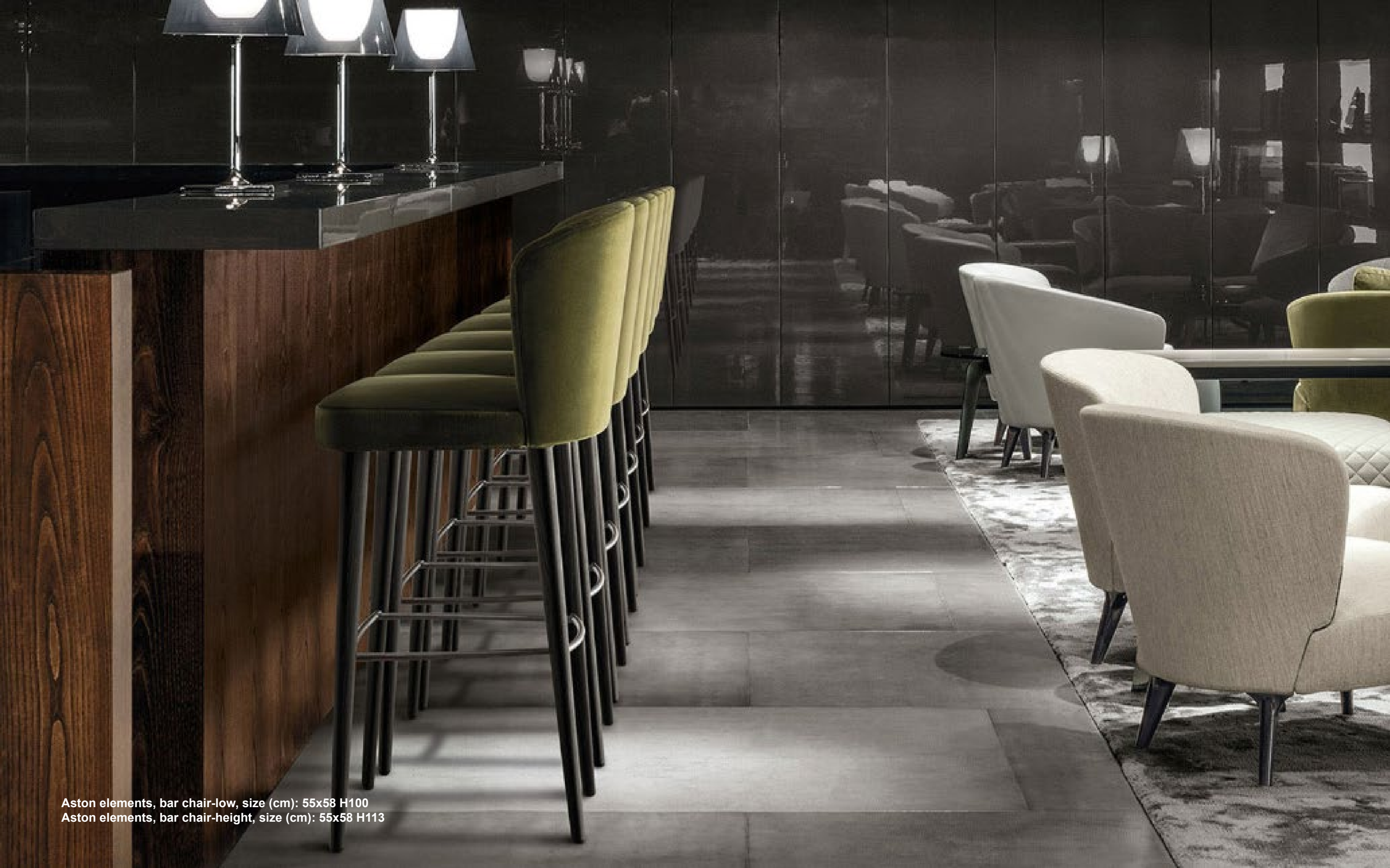
Aston elements, bar chair-low, size (cm): 55x58 H100 Aston elements, bar chair-height, size (cm): 55x58 H113