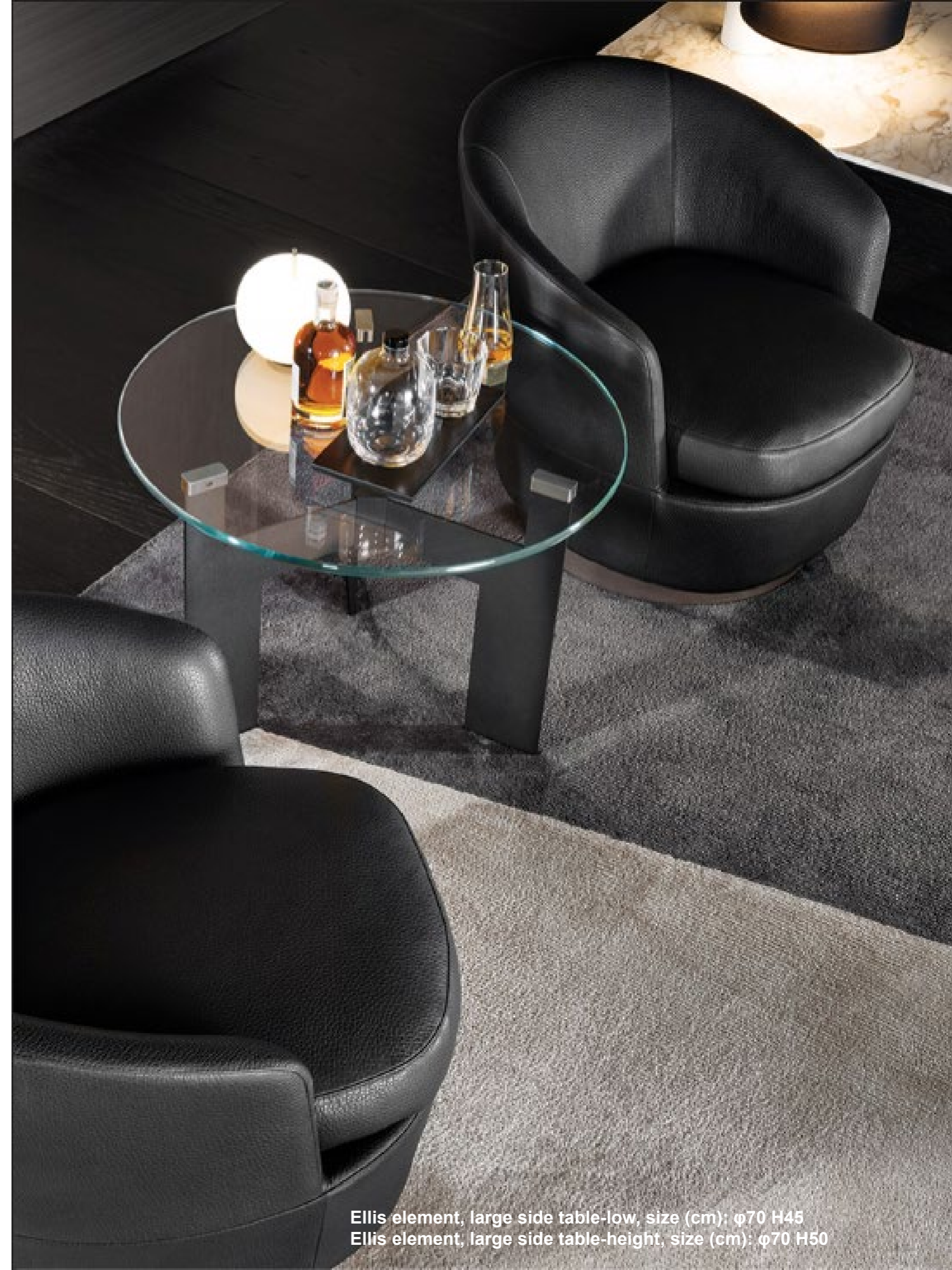
Ellis element, large side table-low, size (cm): \varnothing 70 H45 Ellis element, large side table-height, size (cm): \varnothing 70 H50