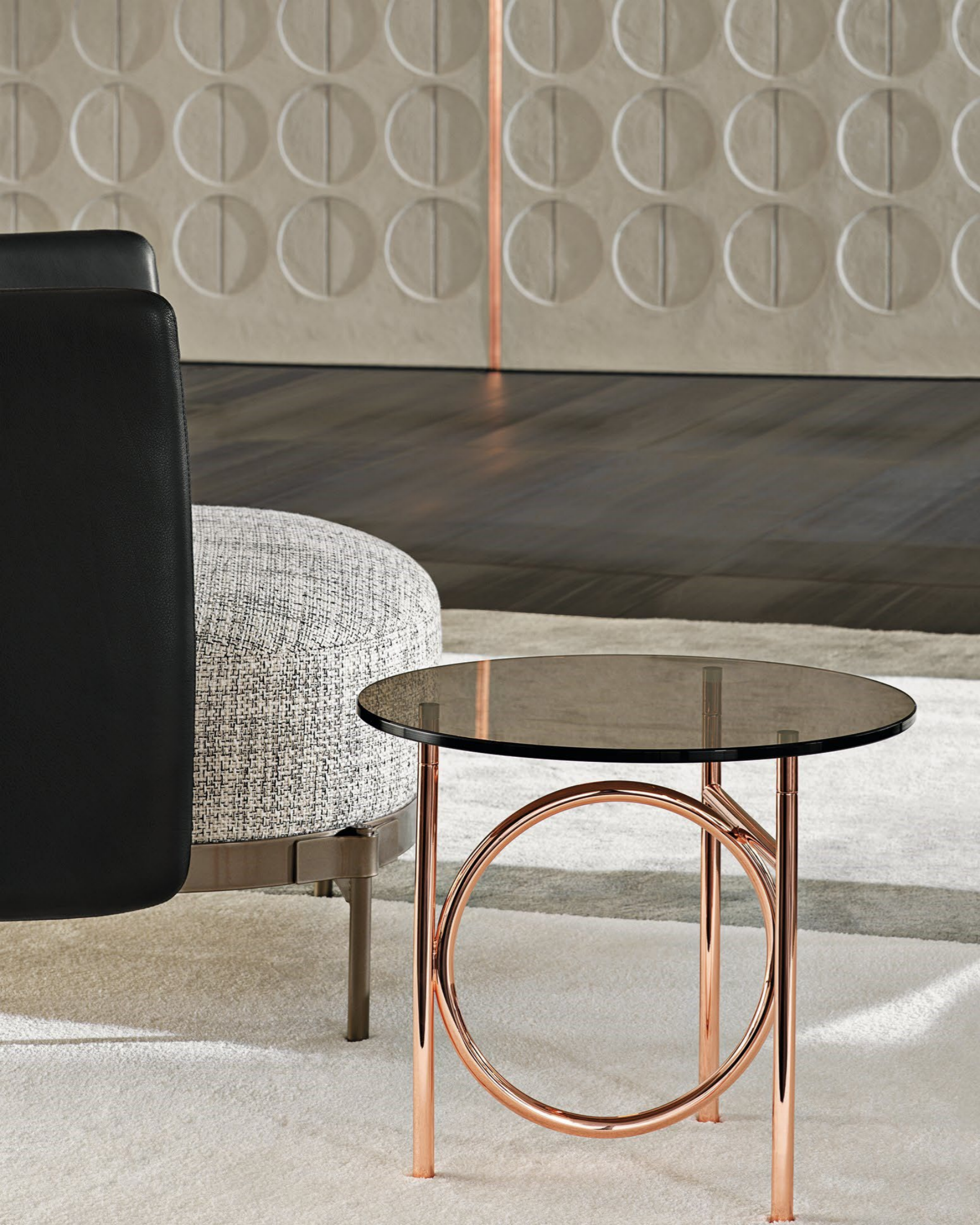
Ring elements, medium side table, size (cm): \phi 39 H49