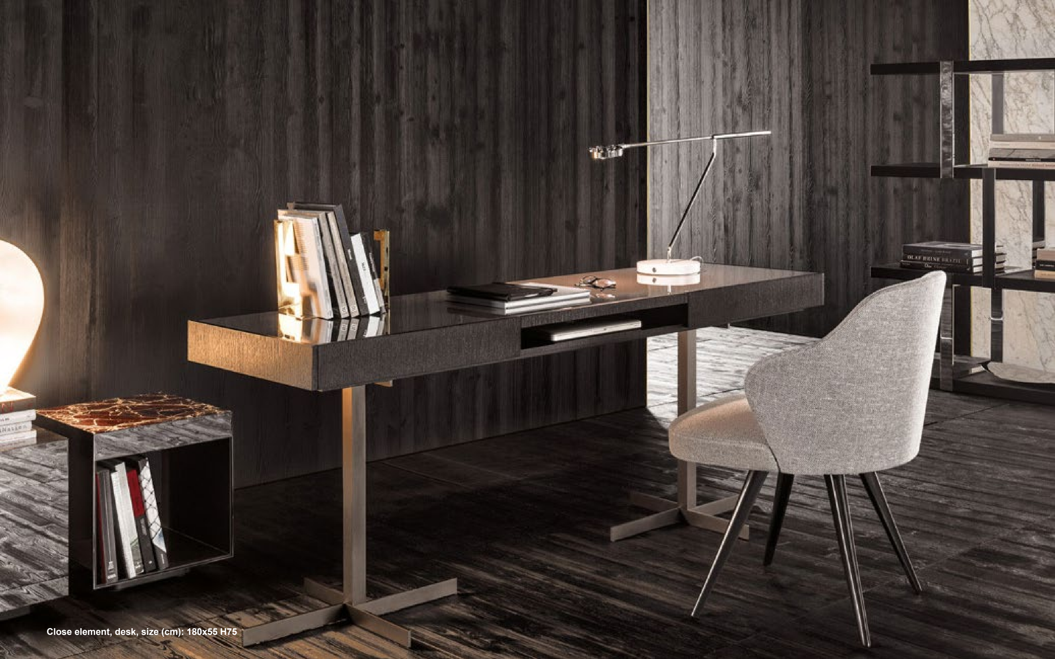
Close element, desk, size (cm): 180x55 H75