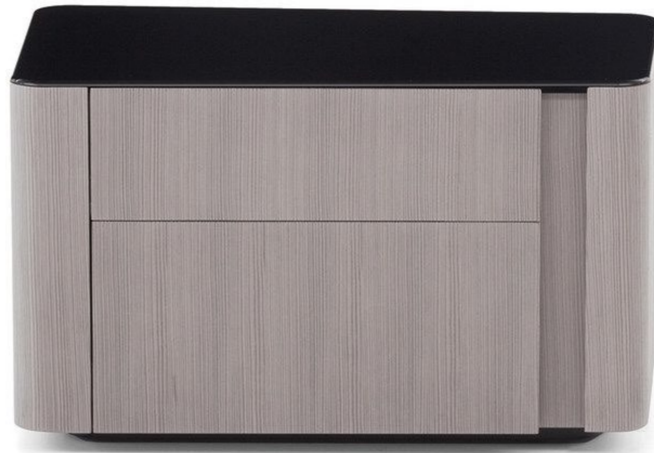
Lou element, with drawers, trapezoidal side table, size (cm): 75x50 H42.5