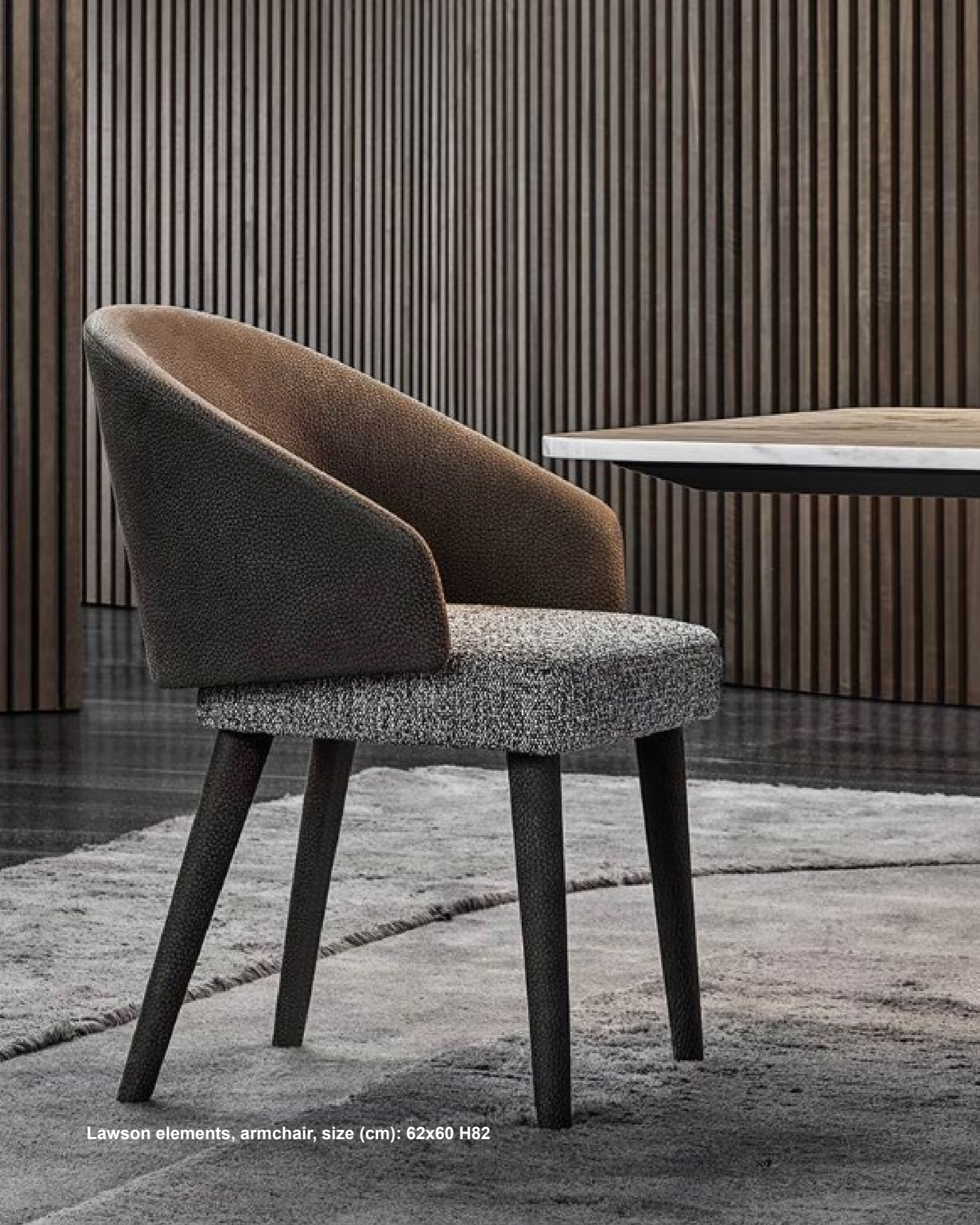
Lawson elements, armchair, size (cm): 62x60 H82