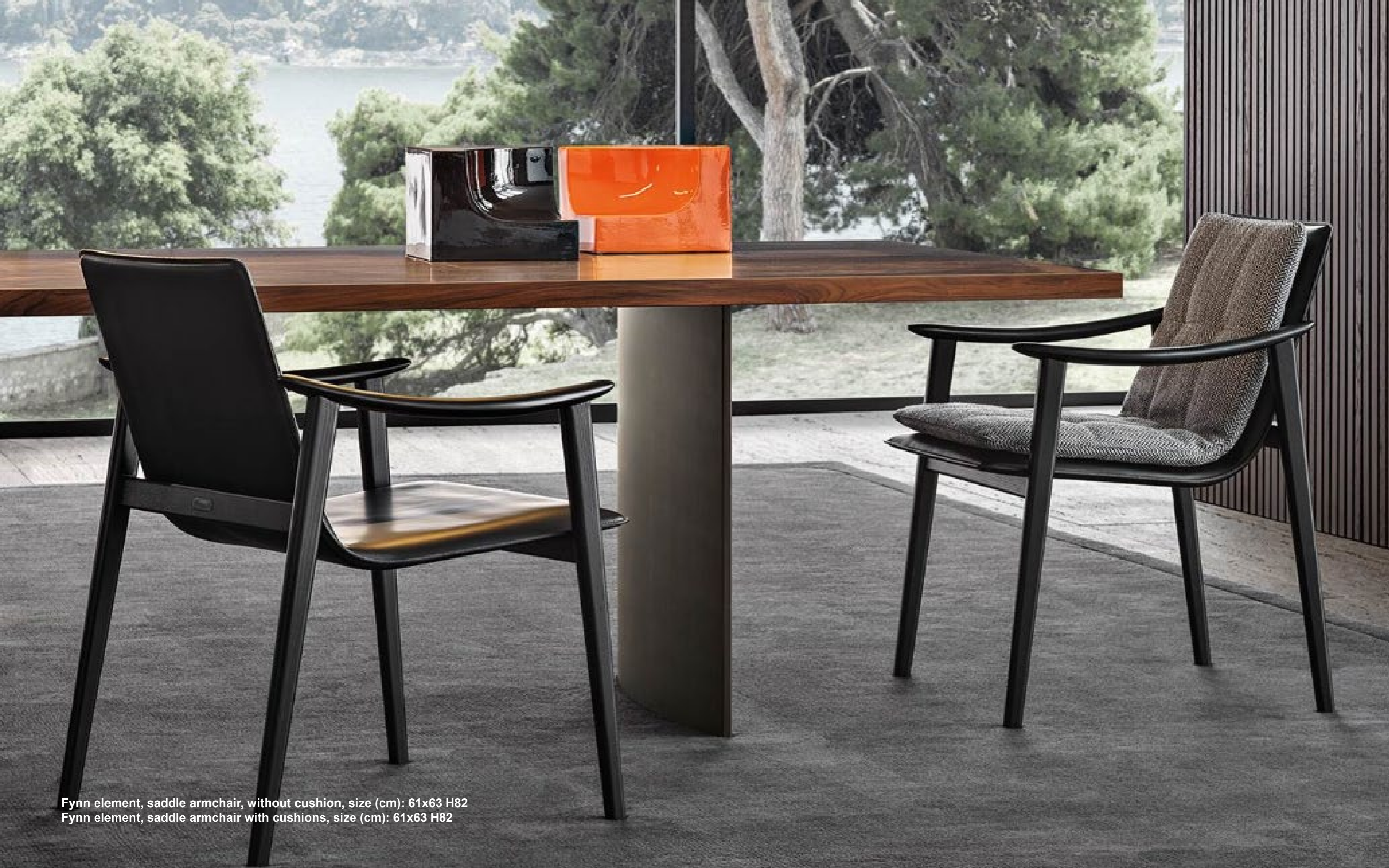
Fynn element, saddle armchair, without cushion, size (cm): 61x63 H82 Fynn element, saddle armchair with cushions, size (cm): 61x63 H82