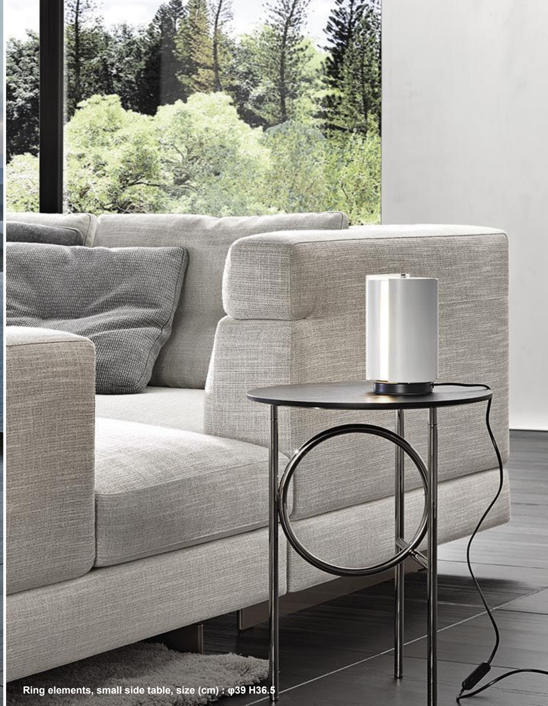
Ring elements, small side table, size (cm) : \phi 39 H36.5