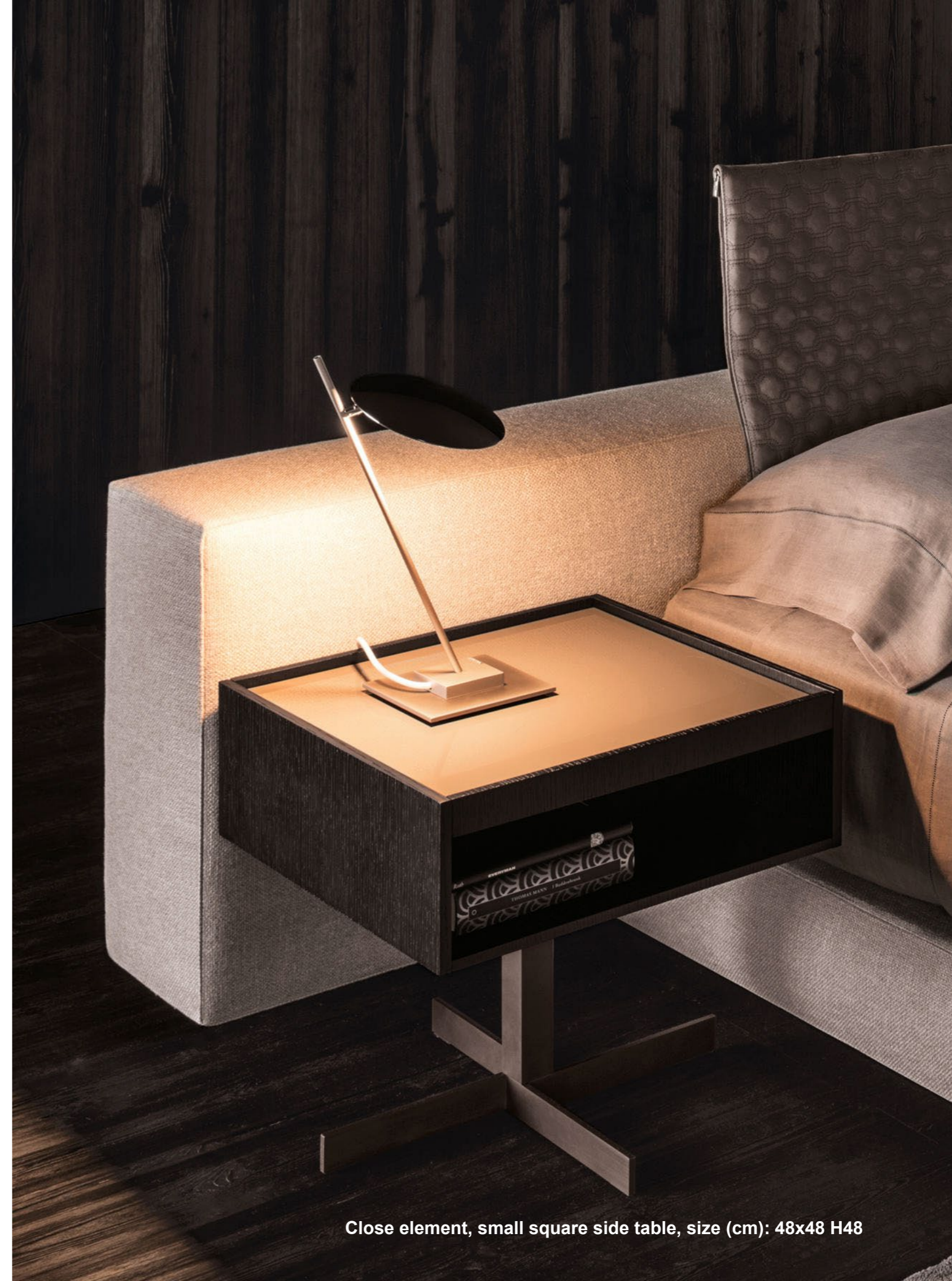
Close element, small square side table, size (cm): 48x48 H48