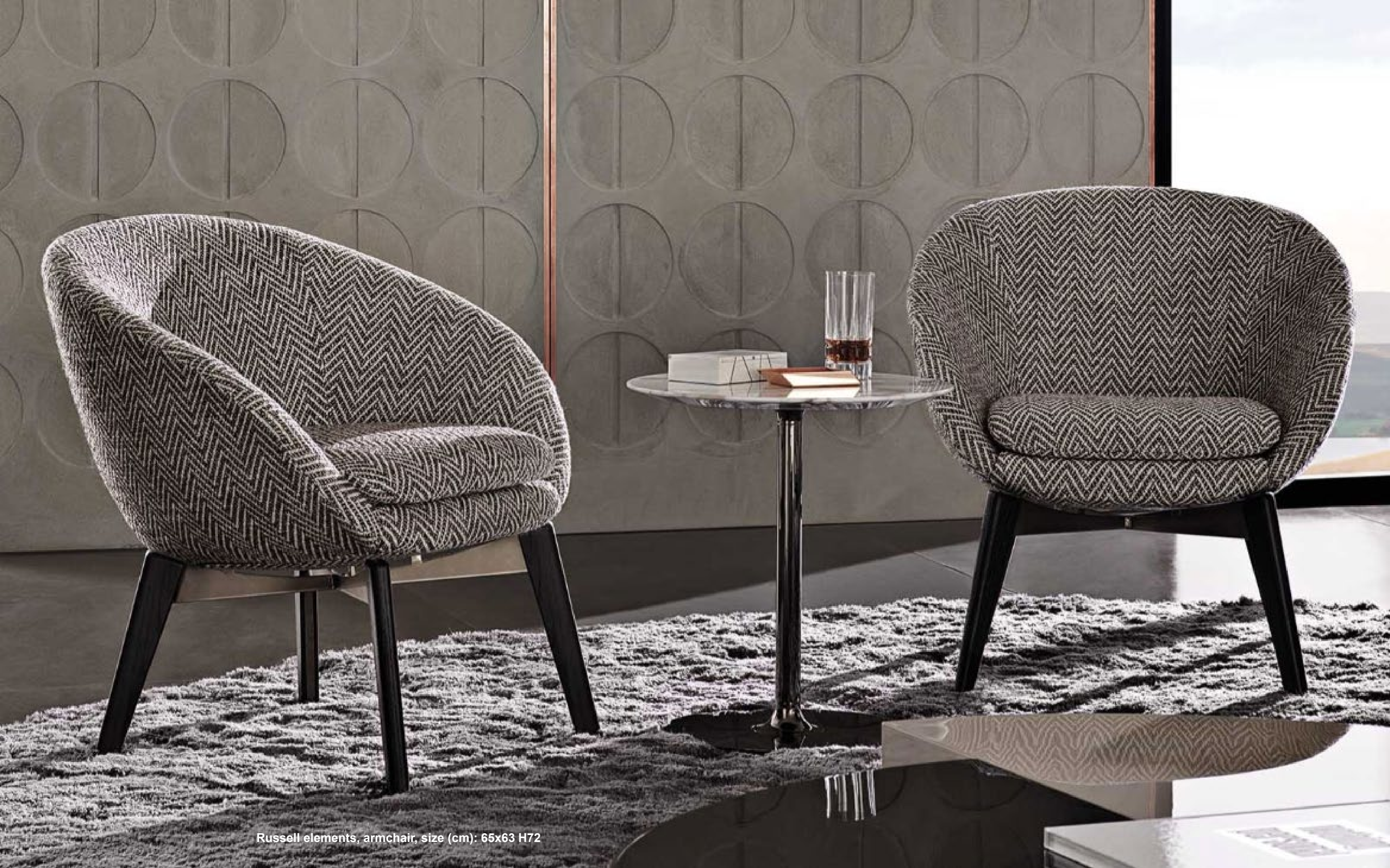
Russell elements, armchair, size (cm): 65x63 H72