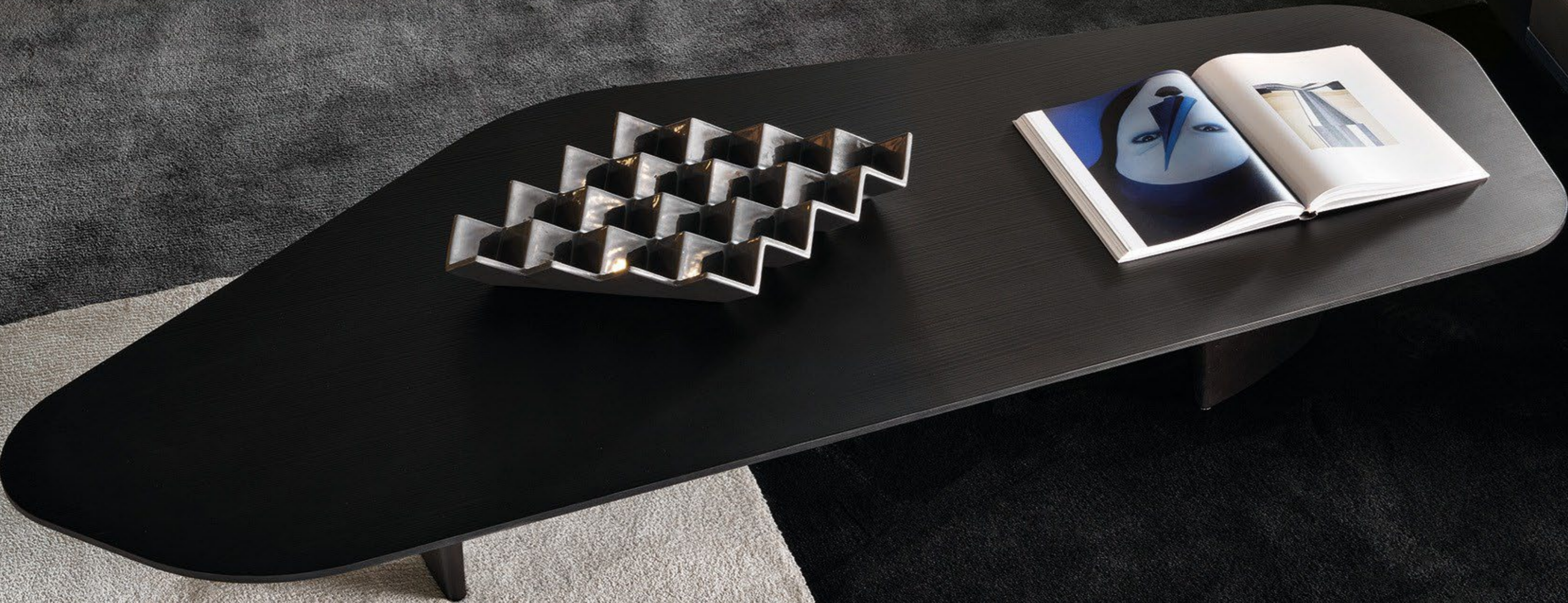
Song elements, small shaped coffee table-low, size (cm): 175x85 H28 Song elements, small shaped coffee table-height, size (cm): 175x85 H36 Song elements, large shaped coffee table-low, size (cm): 200x100 H28 Song elements, large shaped coffee table-height, size (cm): 200x100 H36