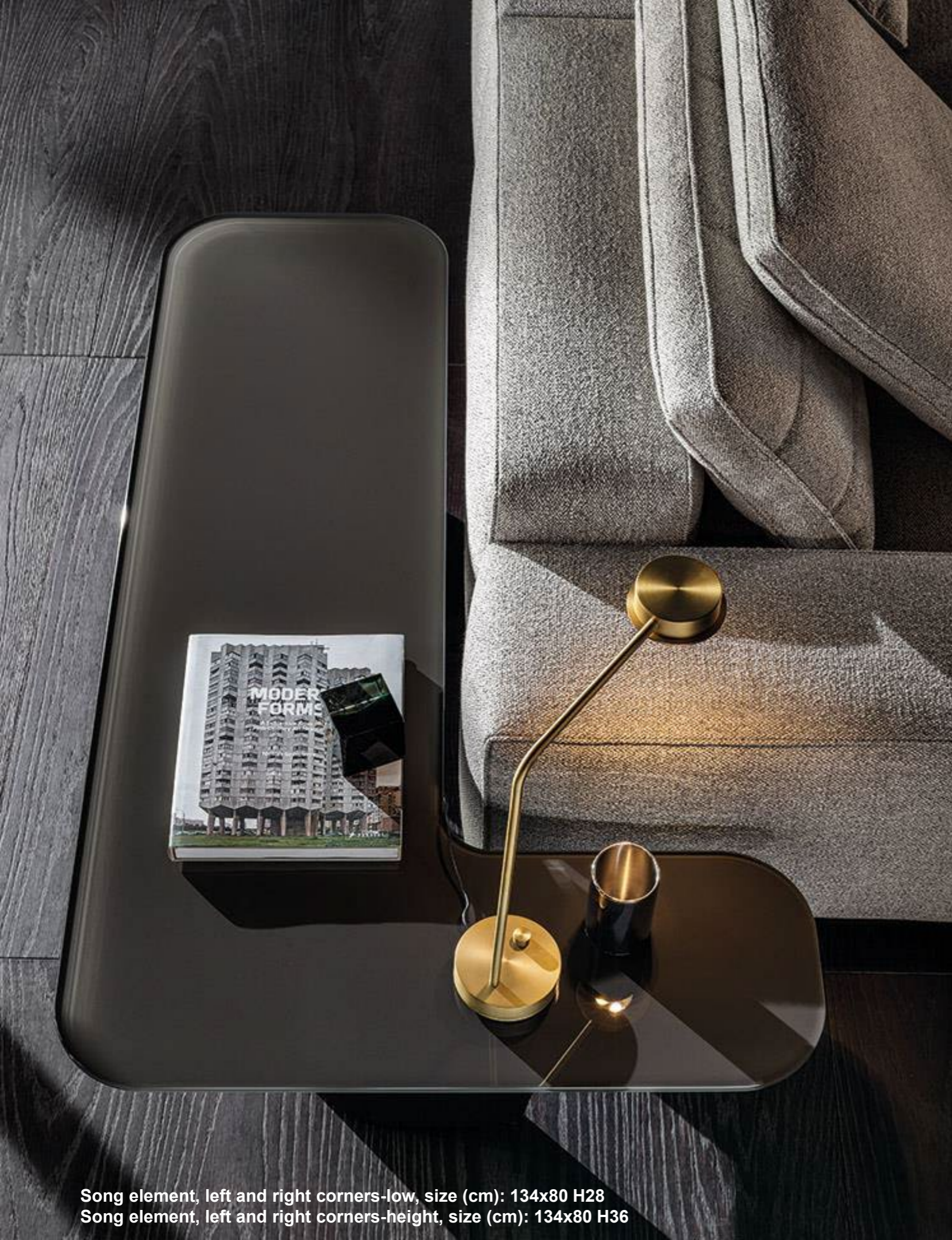
Song element, left and right corners-low, size (cm): 134x80 H28 Song element, left and right corners-height, size (cm): 134x80 H36