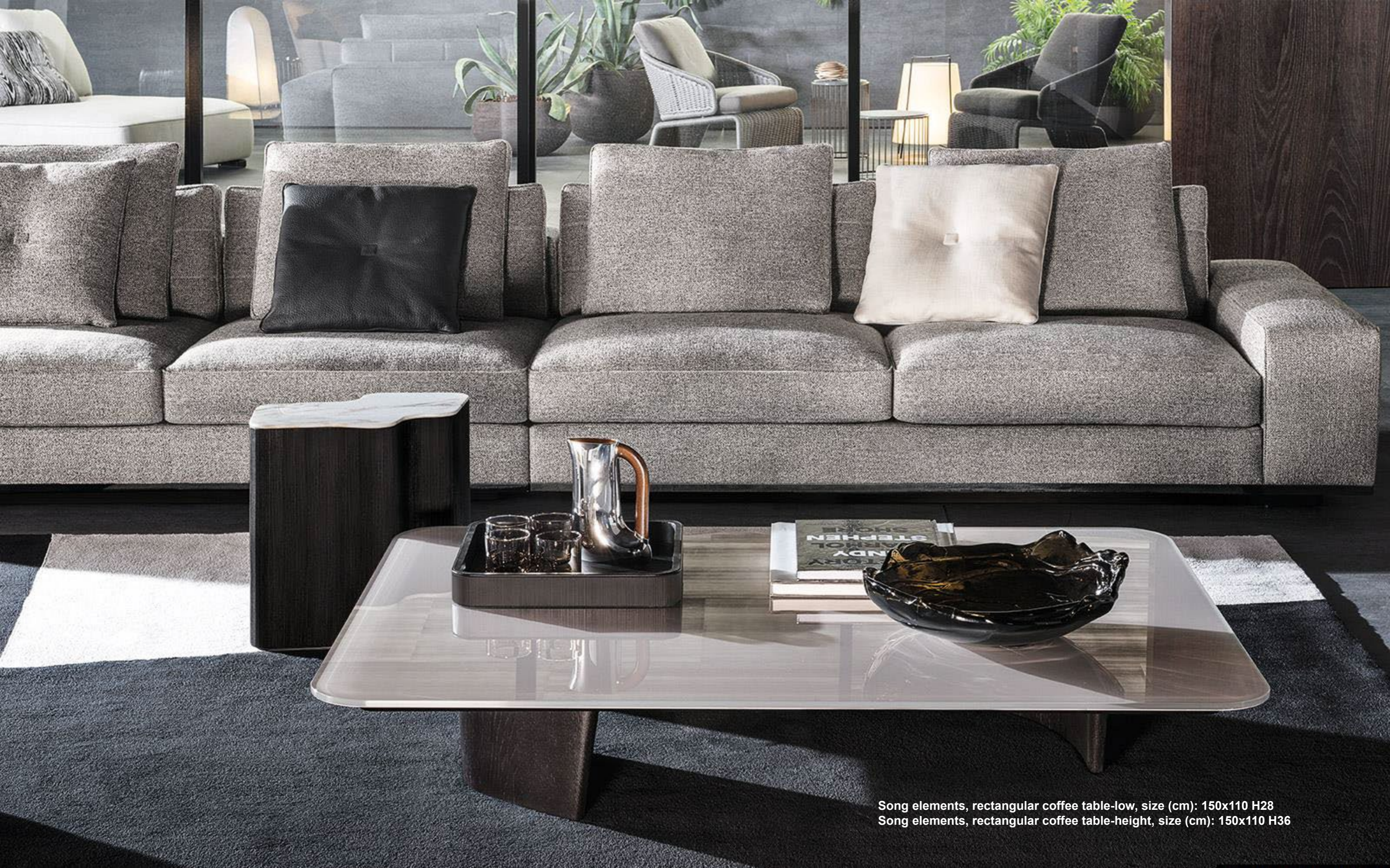
Song elements, rectangular coffee table-low, size (cm): 150x110 H28 Song elements, rectangular coffee table-height, size (cm): 150x110 H36