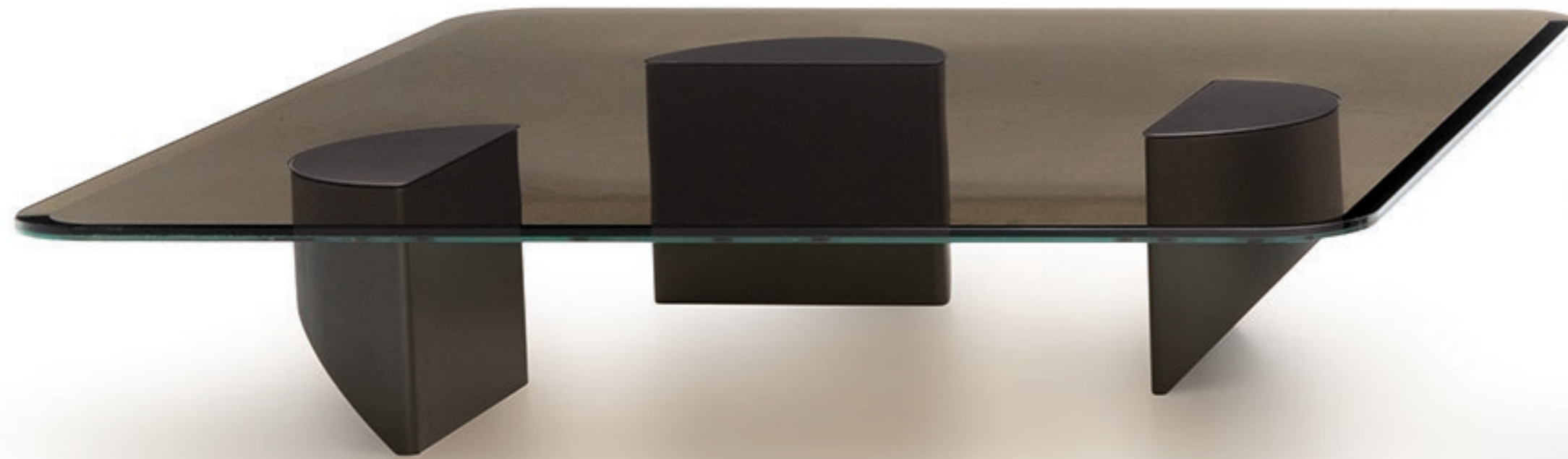
Wedge elements, square coffee table, size (cm) : 135x135 H29