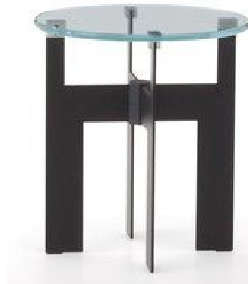
Ellis elements, medium round coffee table, size (cm): \varnothing 45 H50