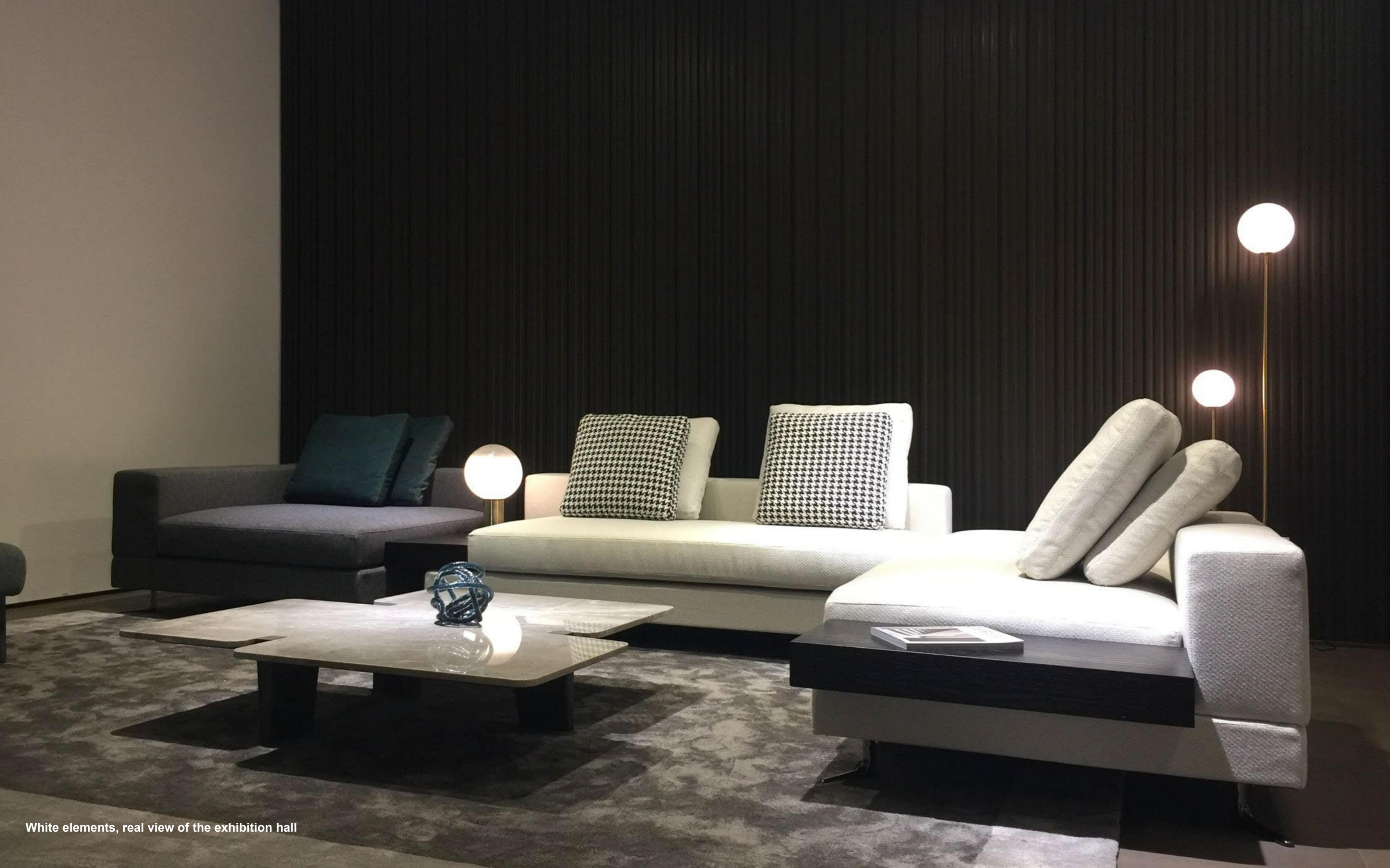
White elements, real view of the exhibition hall