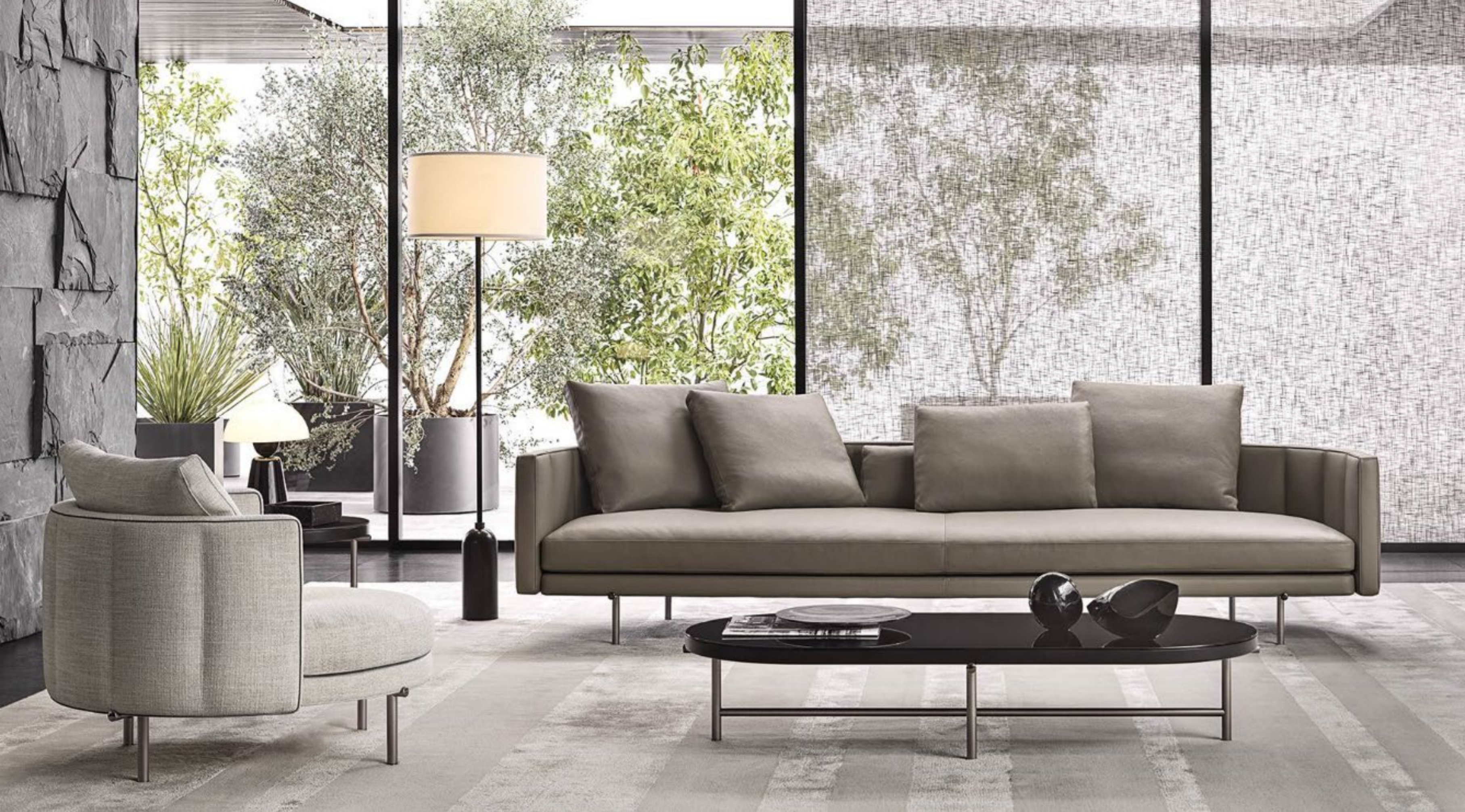
Torii elements, with two armrests, low back. Size (cm): 198x92 H87