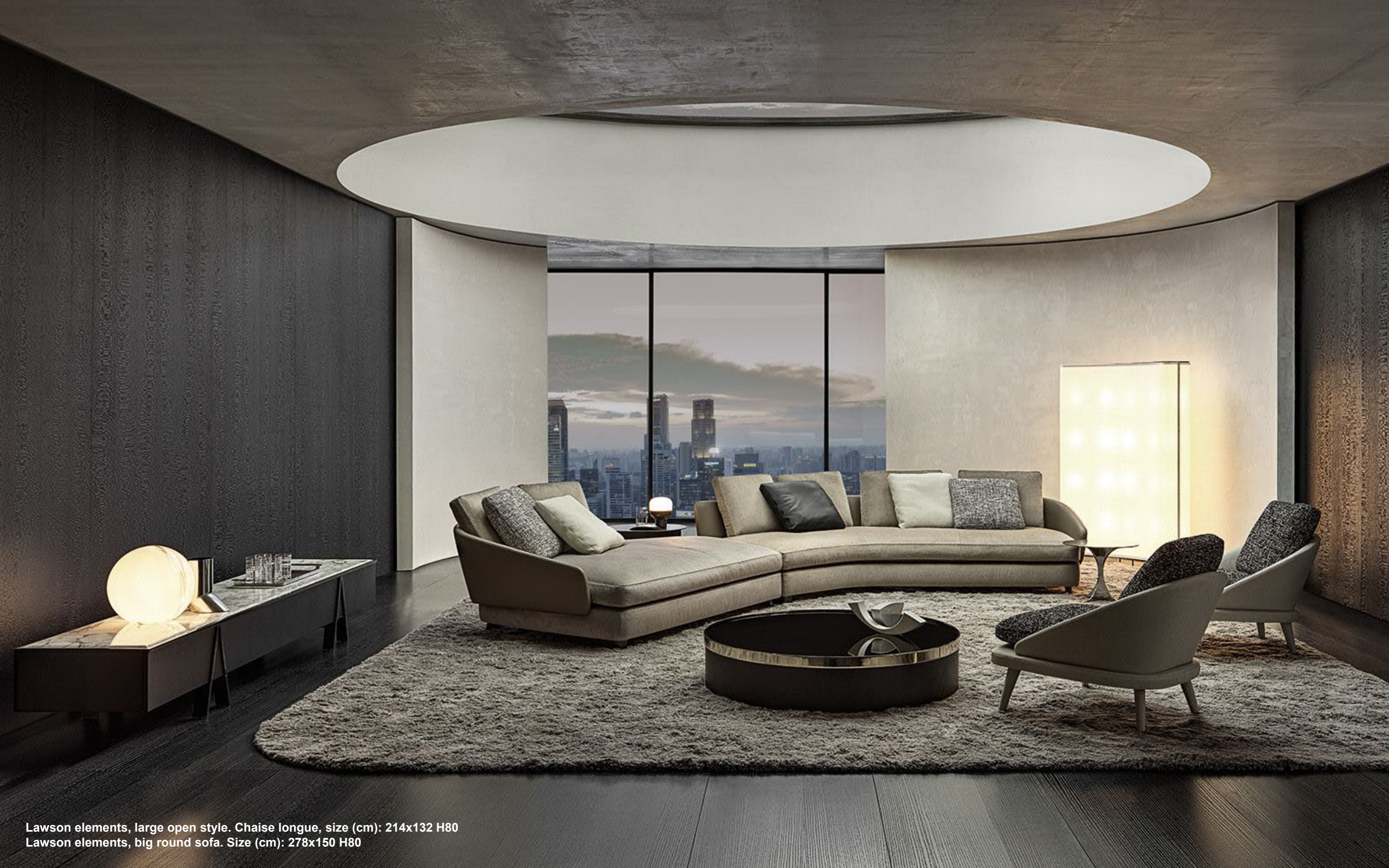
Lawson elements, large open style. Chaise longue, size (cm): 214x132 H80 Lawson elements, big round sofa. Size (cm): 278x150 H80