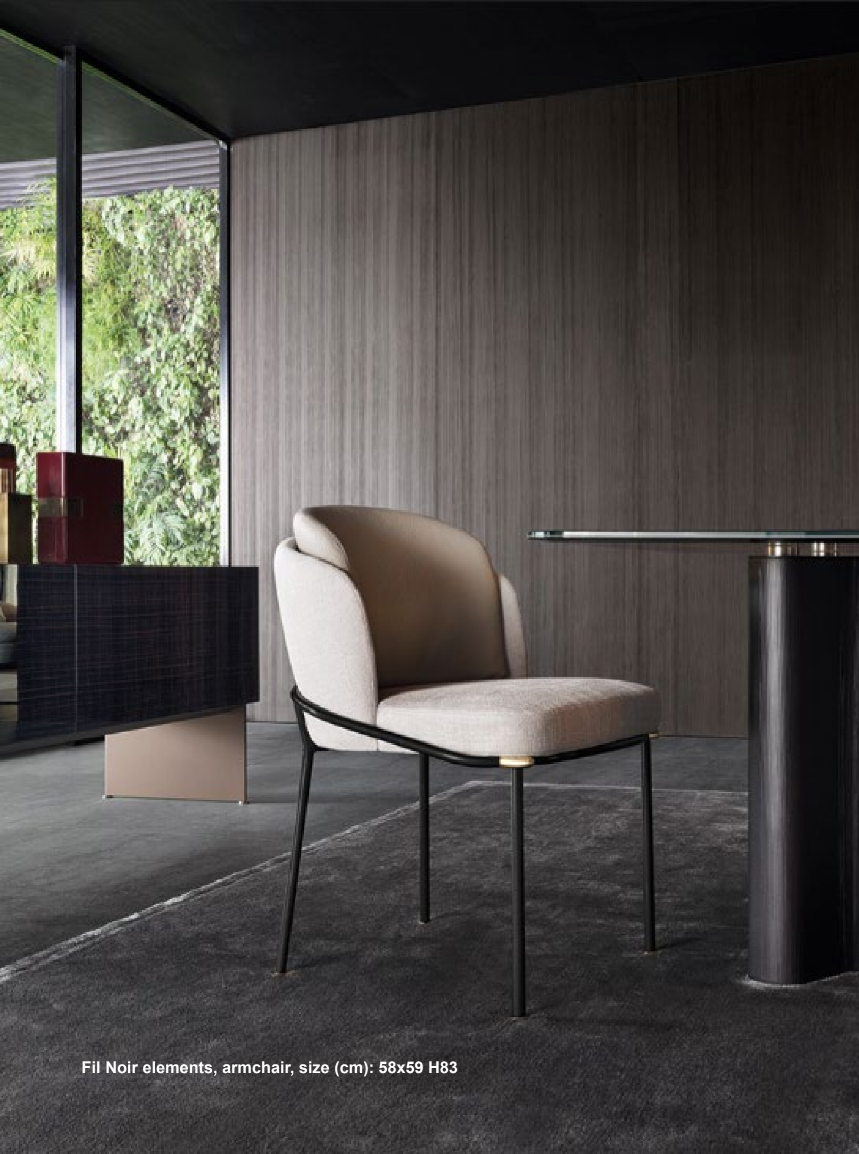
Fil Noir elements, armchair, size (cm): 58x59 H83