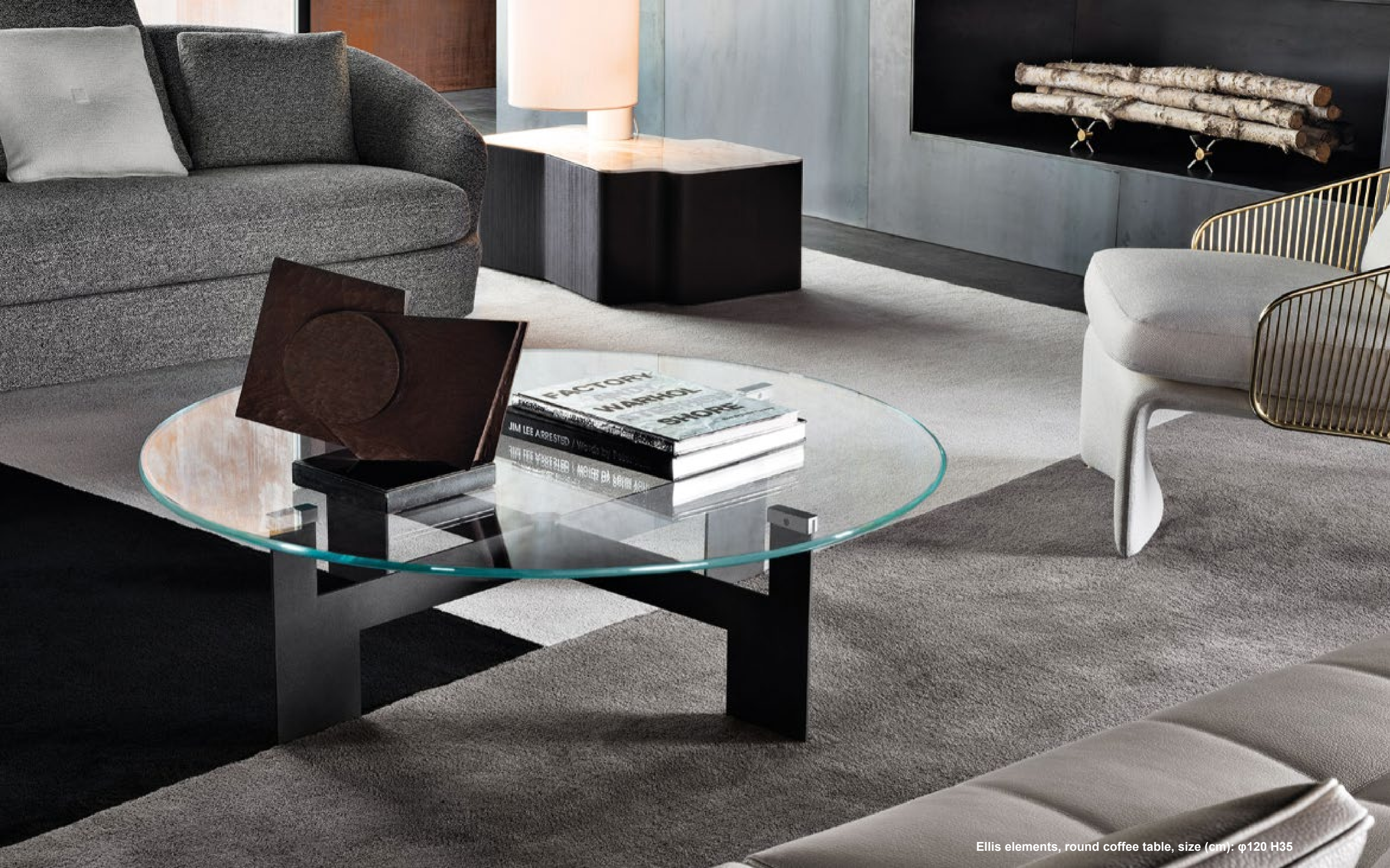
Ellis elements, round coffee table, size (cm): \phi 120 H35