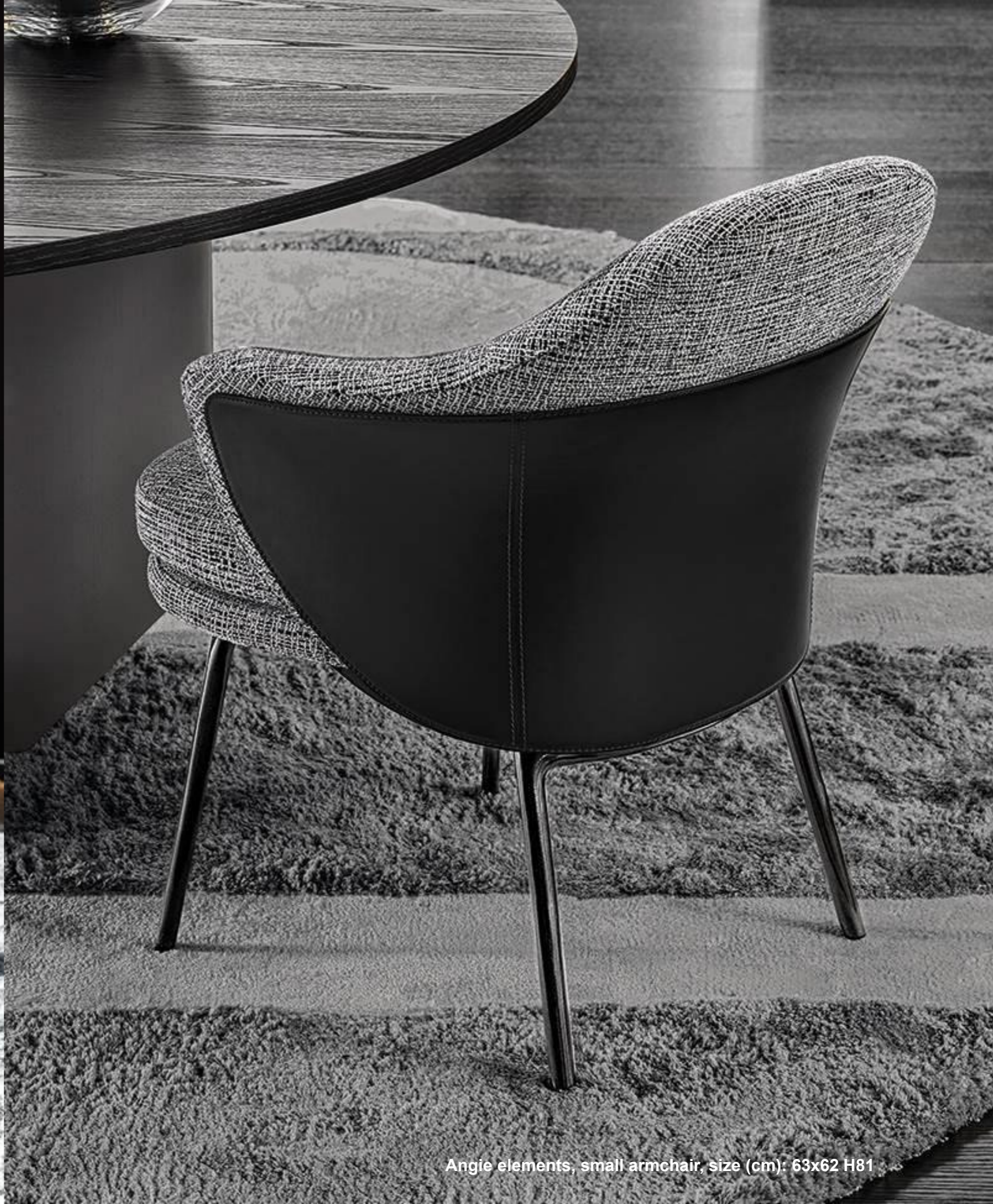
Angie elements, small armchair, size (cm): 63x62 H81