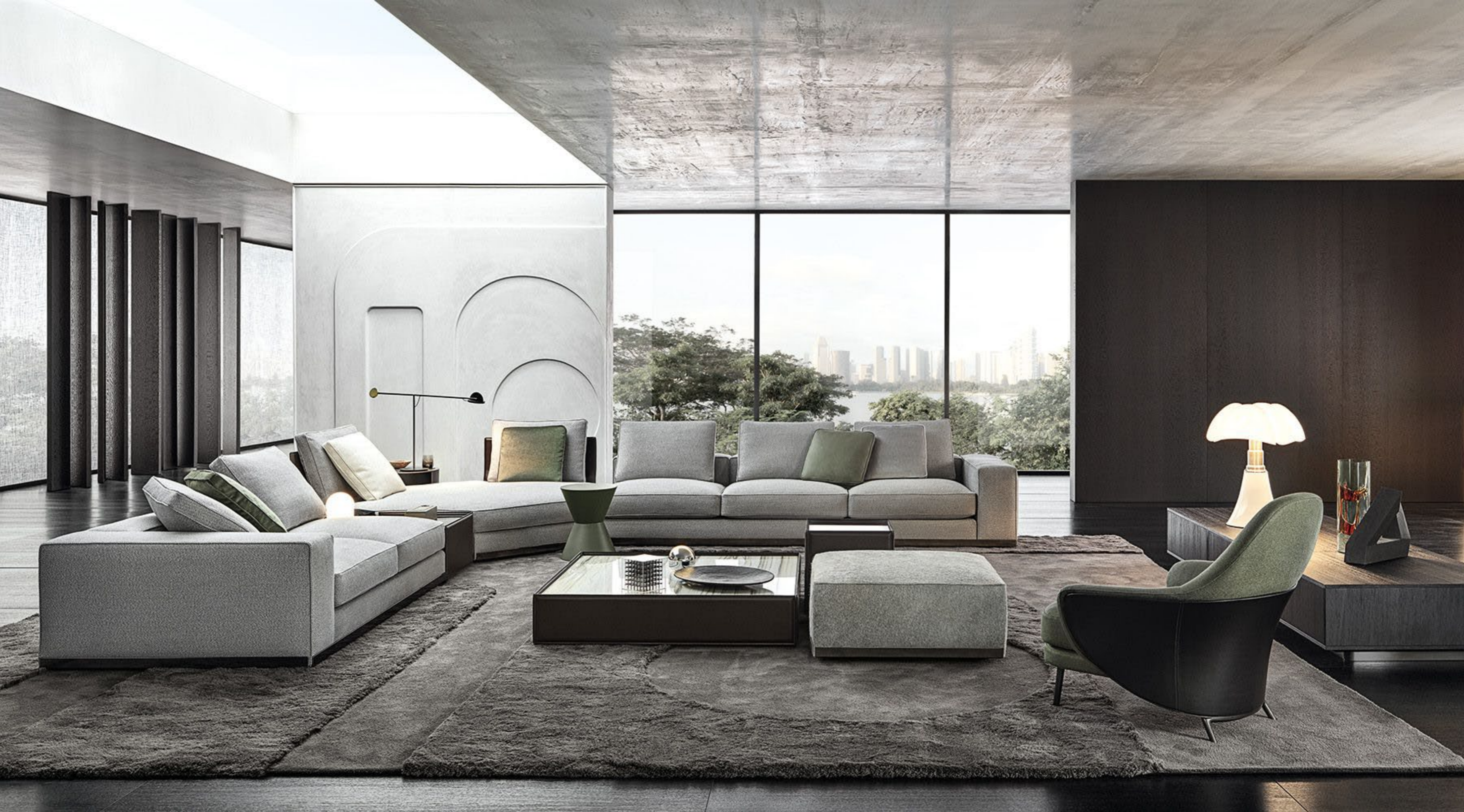
West element, with an armrest, traditional backrest. Size (cm): 200x114 H79 West element, hexagonal chaise longue, saddle backrest. Size (cm): 180x180 H79 West element, with an armrest, traditional backrest. Size (cm): 285x144 H79