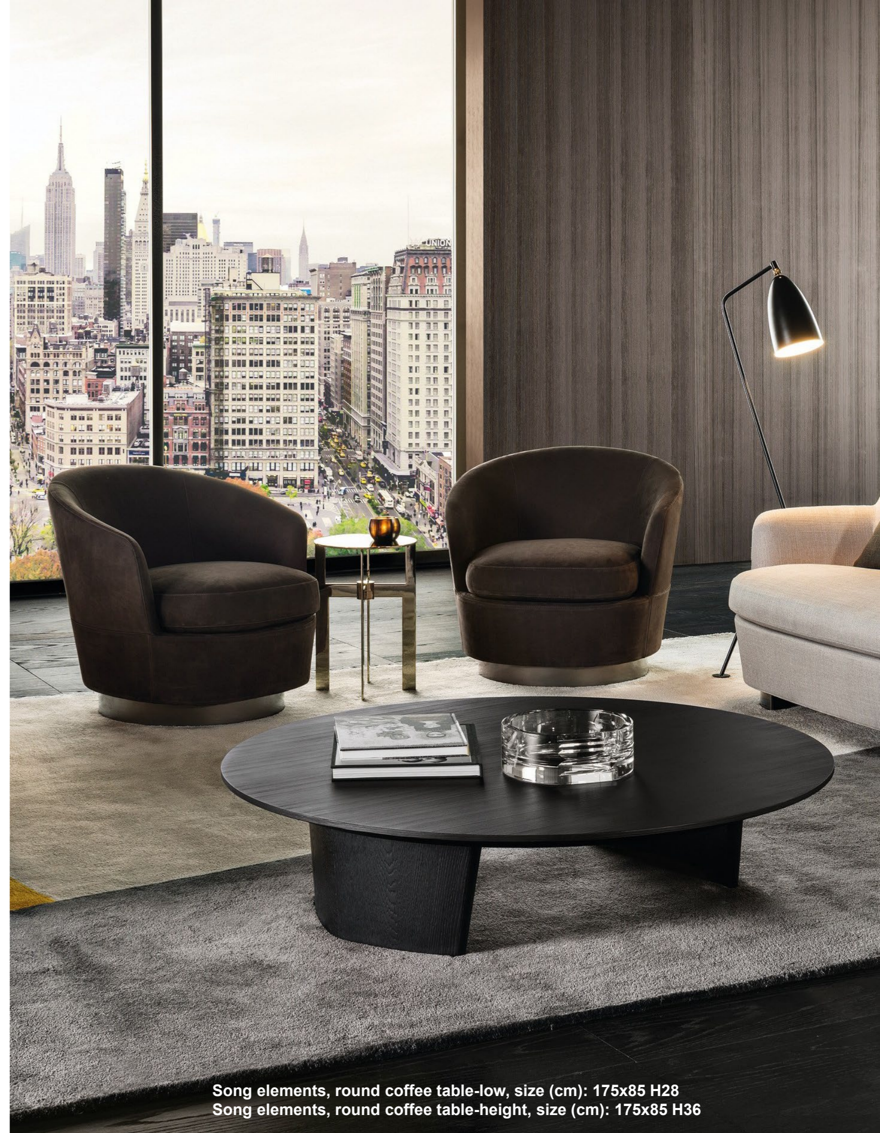
Song elements, round coffee table-low, size (cm): 175x85 H28 Song elements, round coffee table-height, size (cm): 175x85 H36