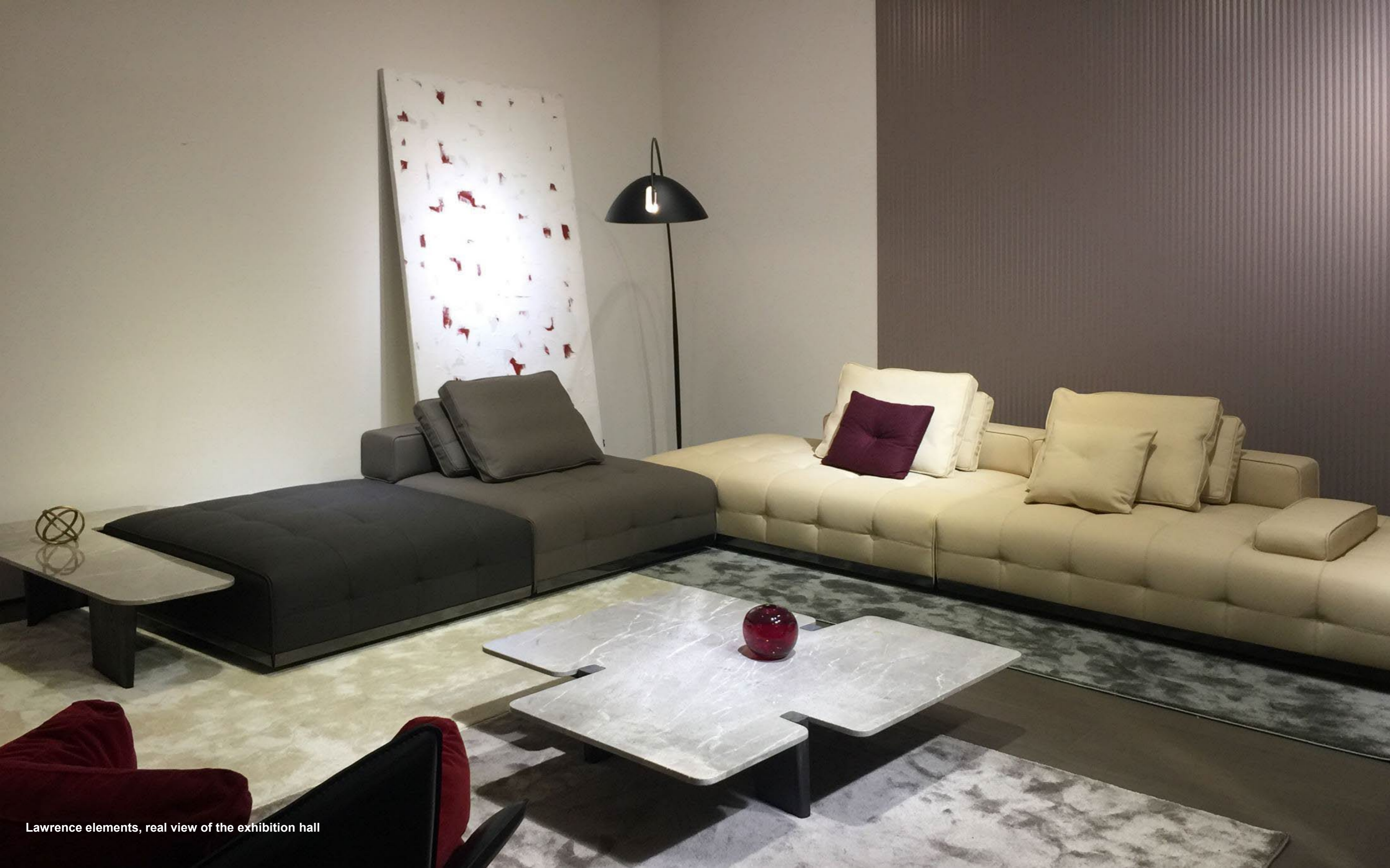
Lawrence elements, real view of the exhibition hall