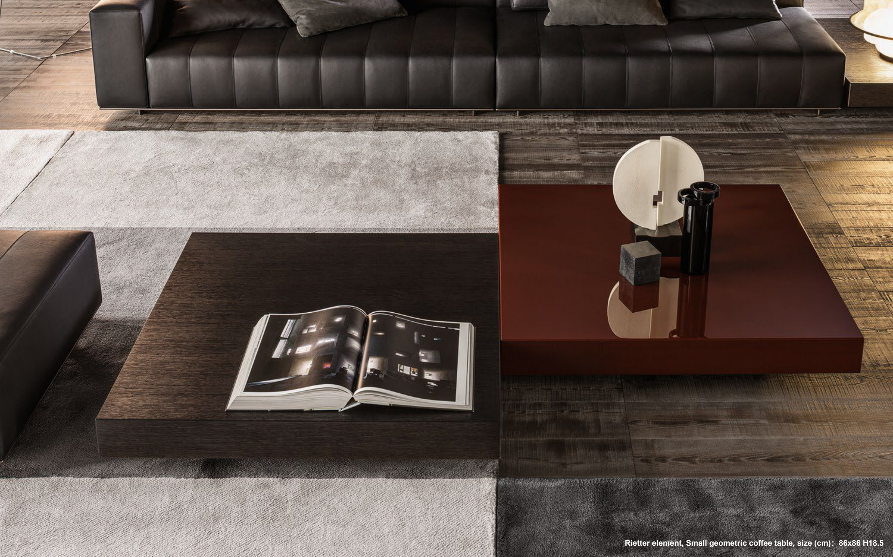
Rietter element, Small geometric coffee table, size (cm): 86x86 H18.5