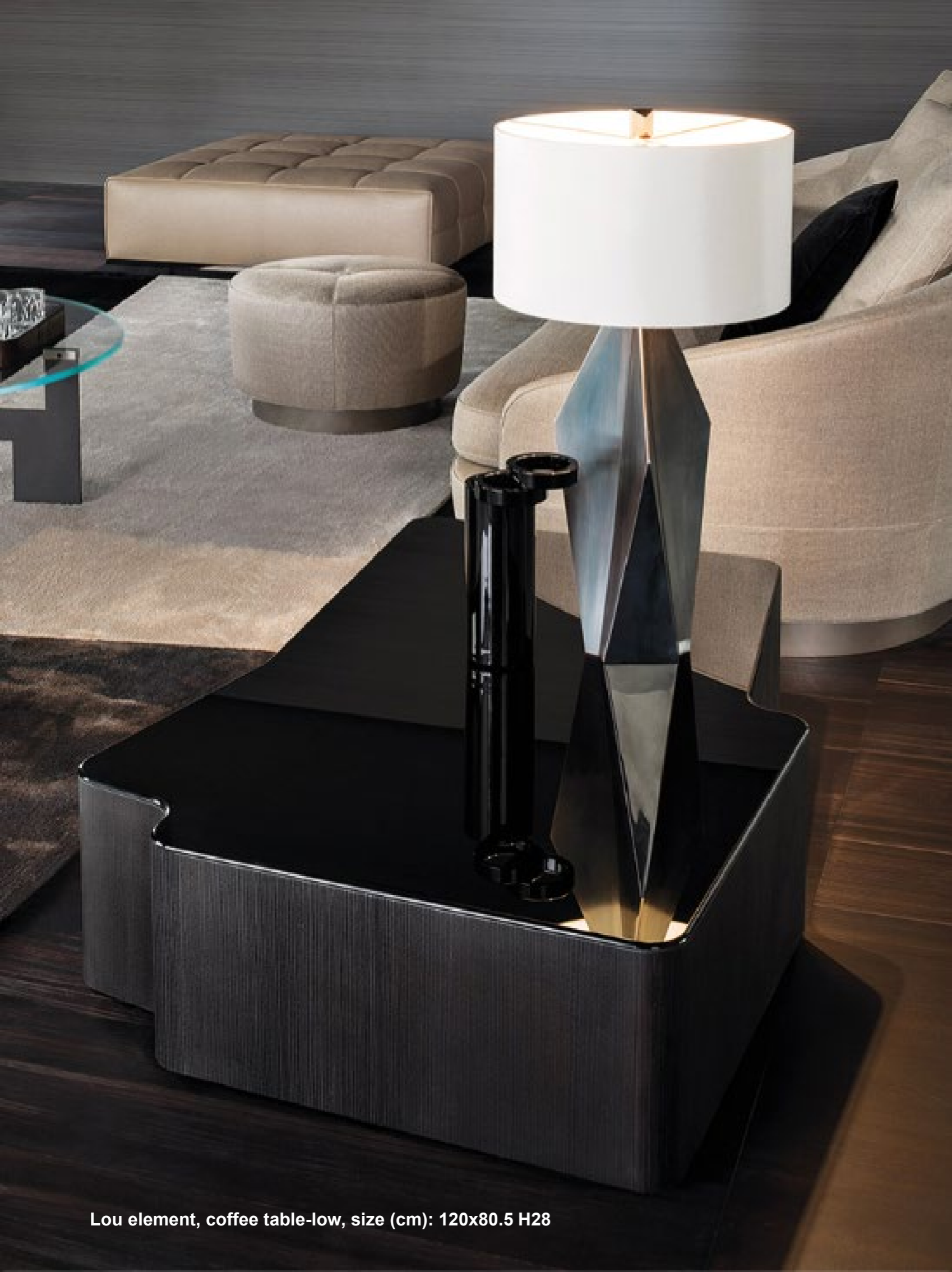
Lou element, coffee table-low, size (cm): 120x80.5 H28