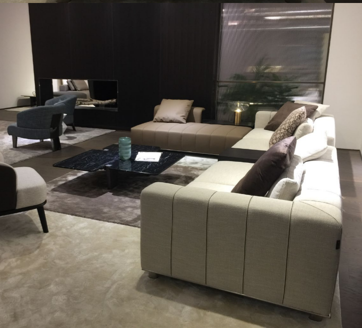
Freeman elements, real view of the exhibition hall