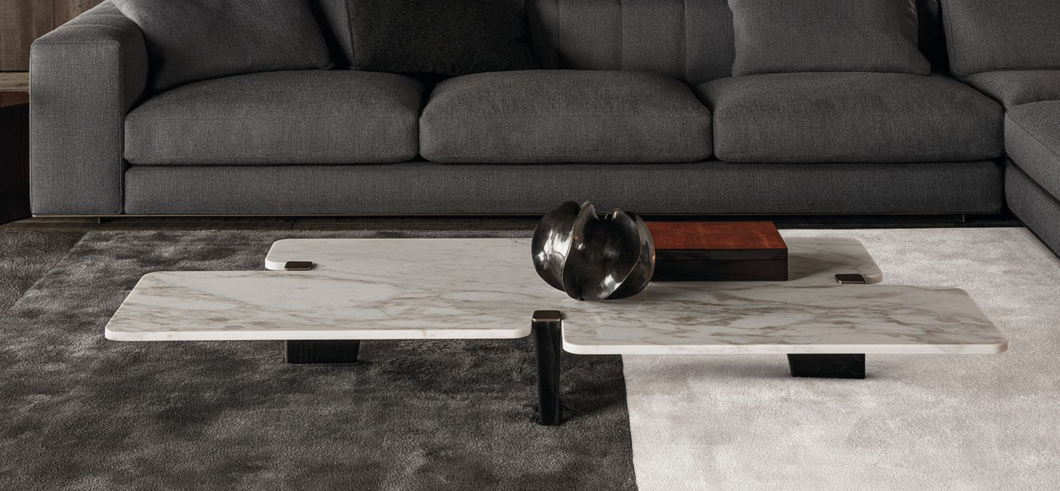
Jacob element, large geometric coffee table - low, size (cm): 180x80 H22 Jacob element, large geometric coffee table - high, size (cm): 180x80 H28