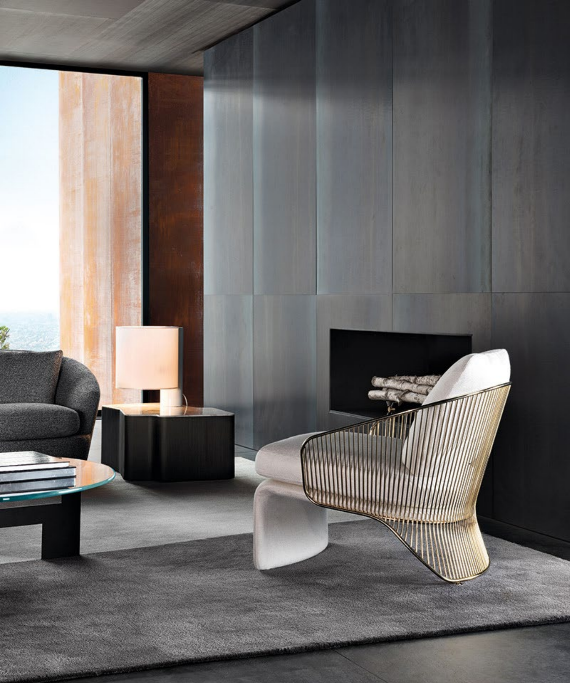
Curtis elements, armchair, size (cm) : 72x85 H84