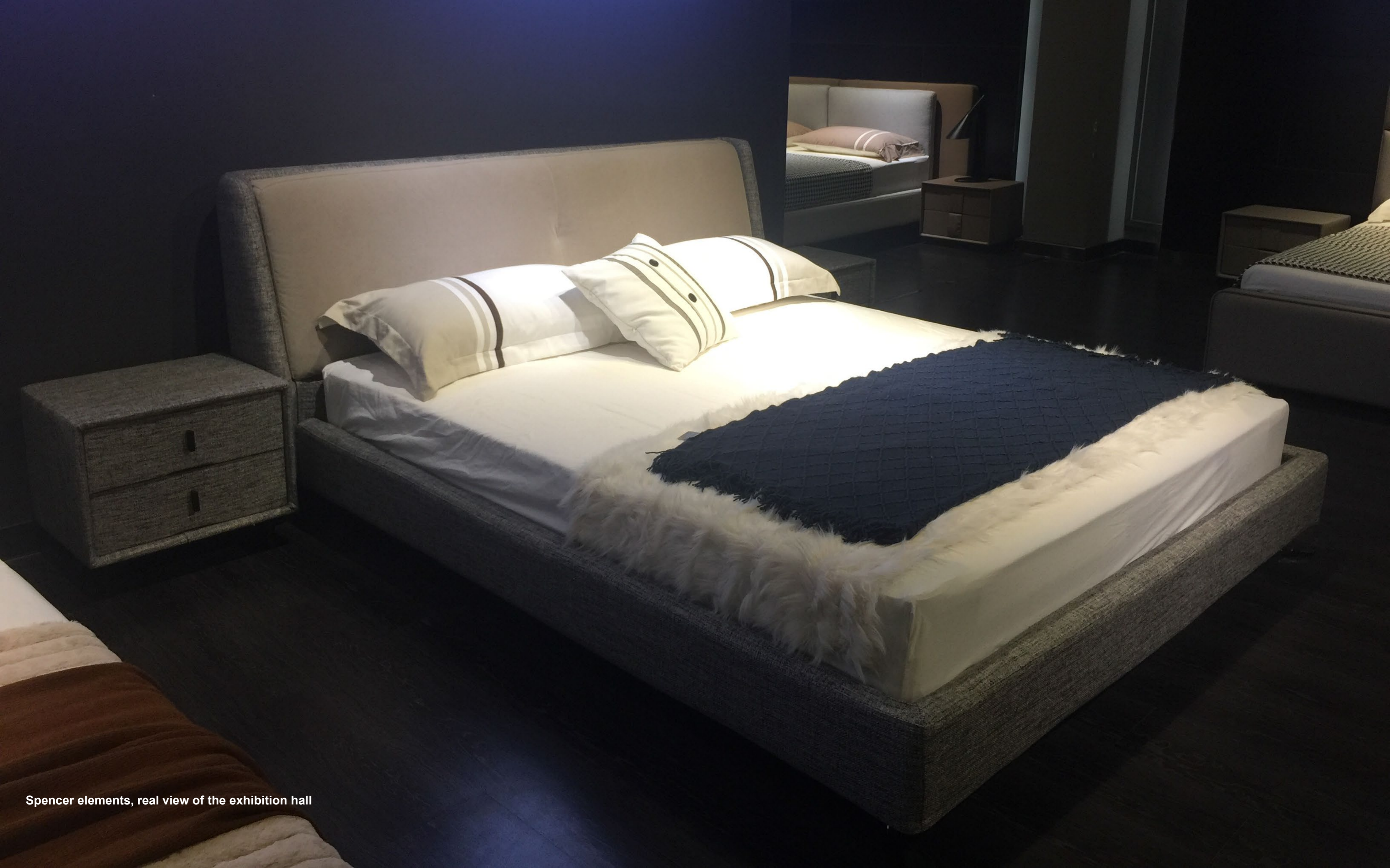
Spencer elements, real view of the exhibition hall