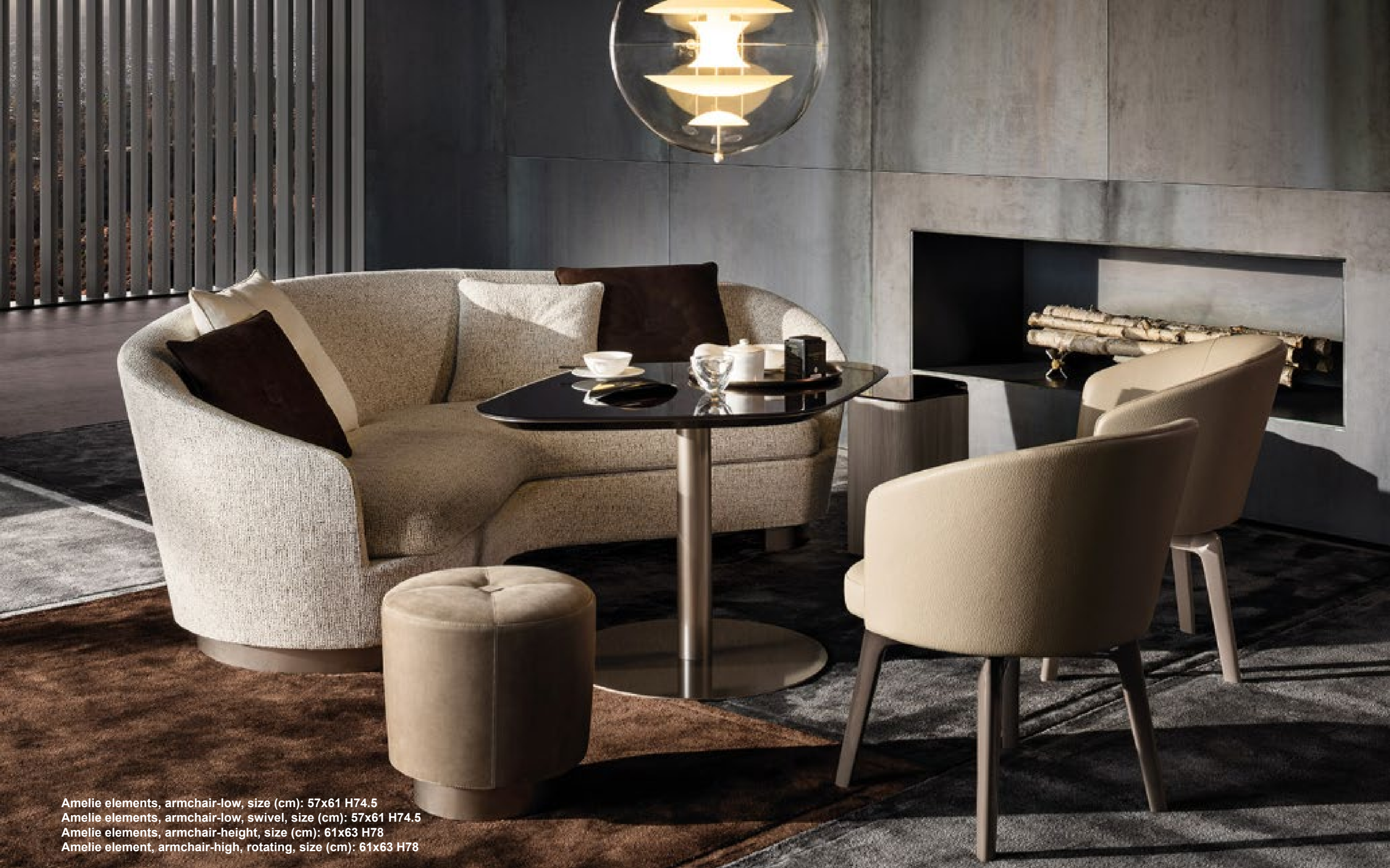
Amelie elements, armchair-low, size (cm): 57x61 H74.5 Amelie elements, armchair-low, swivel, size (cm): 57x61 H74.5 Amelie elements, armchair-height, size (cm): 61x63 H78 Amelie element, armchair-high, rotating, size (cm): 61x63 H78