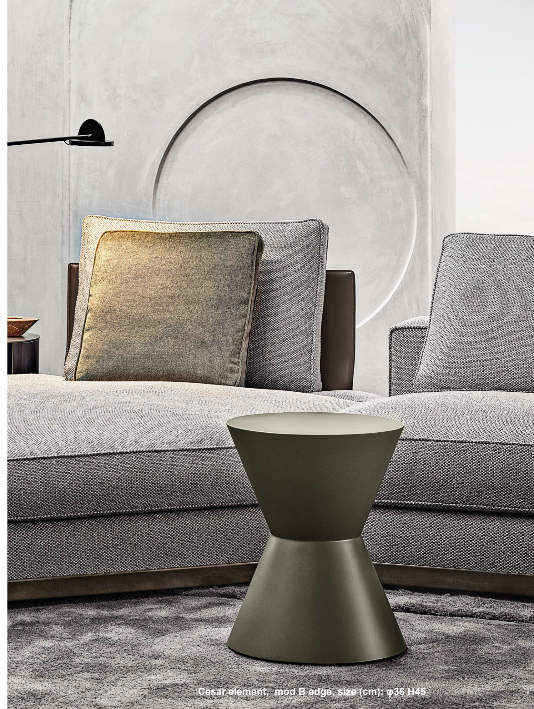
Cesar element, mod B edge, size (cm): \varnothing 36 H45