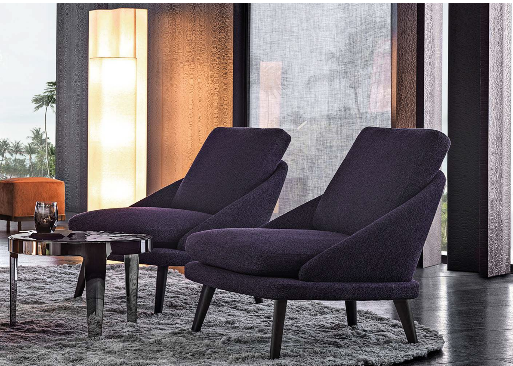
Lawson element, Legs lounge armchair, size (cm): 79x89 H80