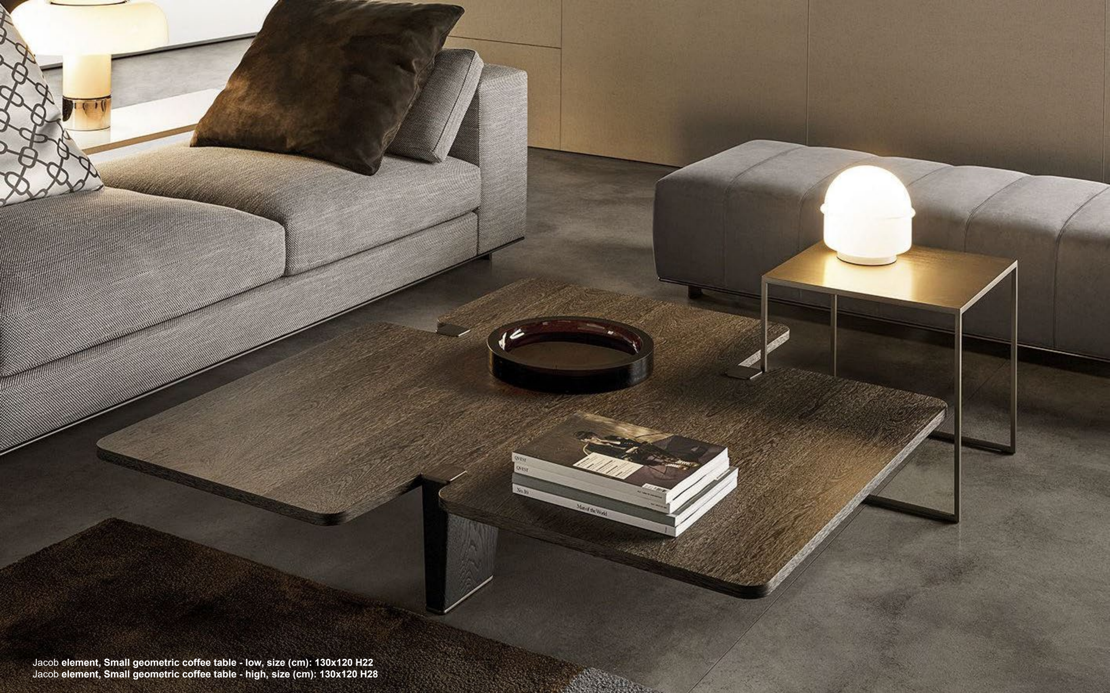
Jacob element, Small geometric coffee table - low, size (cm): 130x120 H22 Jacob element, Small geometric coffee table - high, size (cm): 130x120 H28