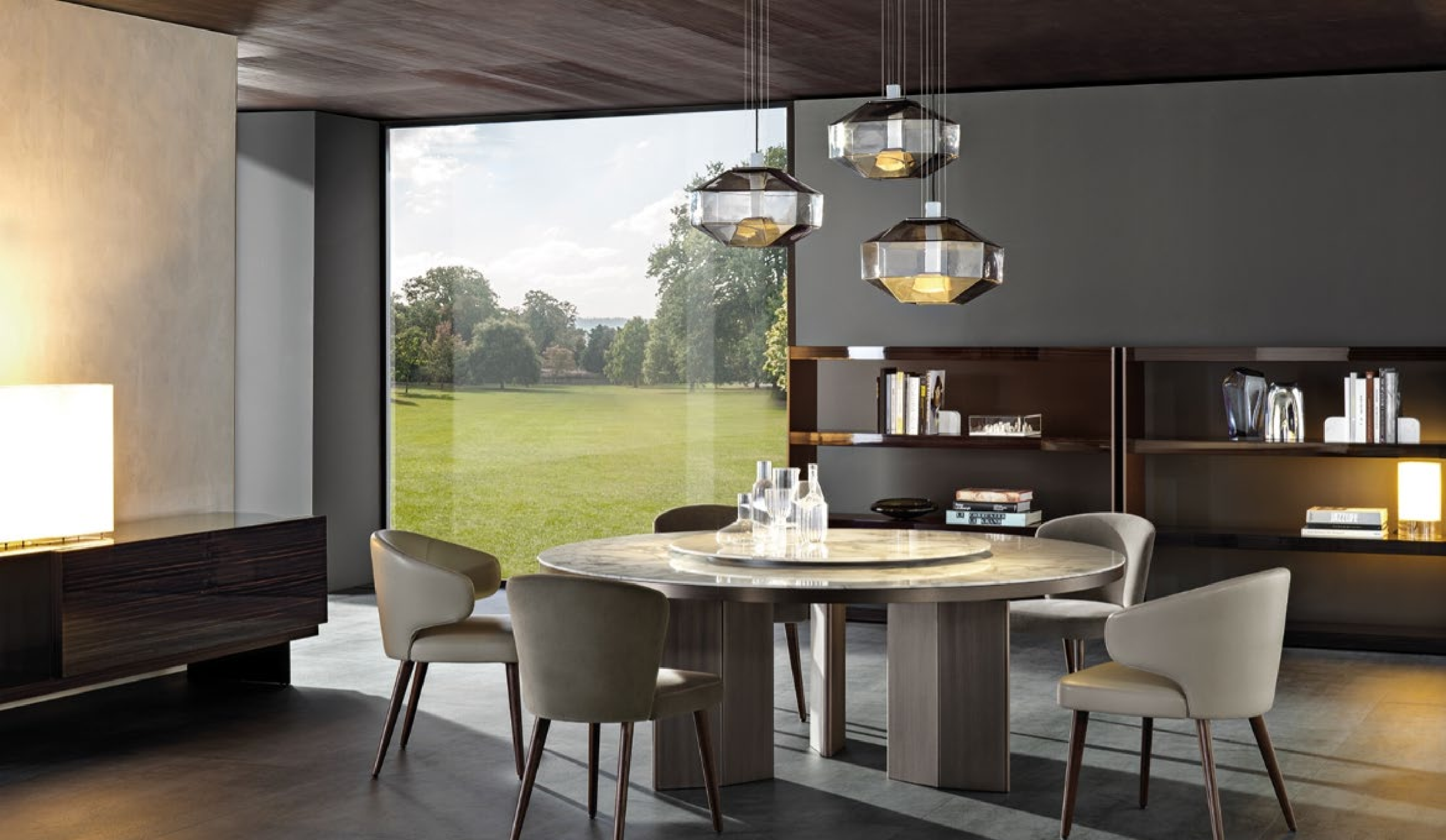
Morgan elements, with turntable, small round dining table, size (cm): \phi 160 H73 Morgan elements, with turntable, medium round dining table, size (cm): \phi 180 H73 Morgan elements, with turntable, large round dining table, size (cm): \phi 200 H73