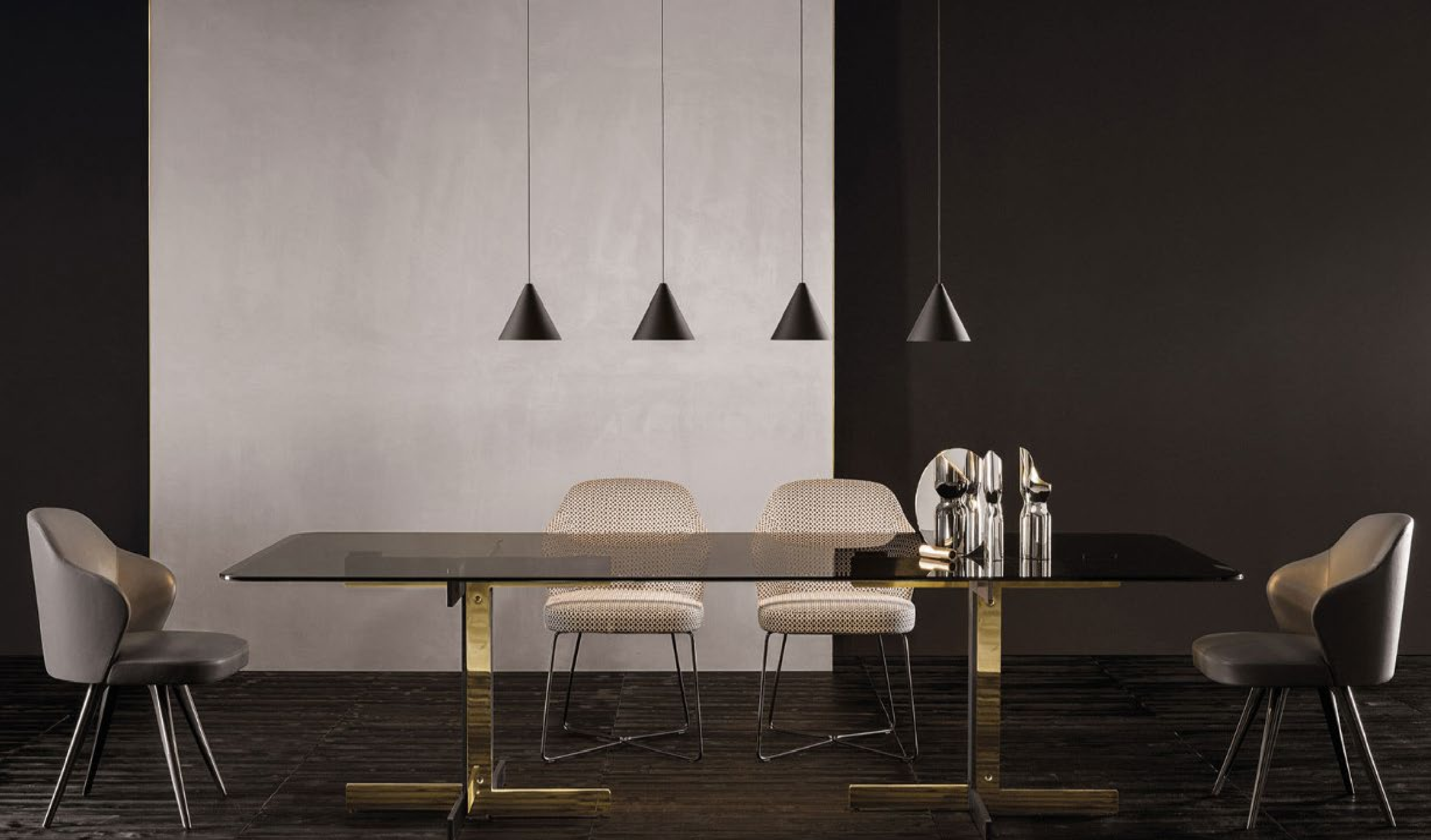
Catlin elements, small square dining table, size (cm): 260x120 H73 Catlin elements, large square dining table, size (cm): 280x120 H73