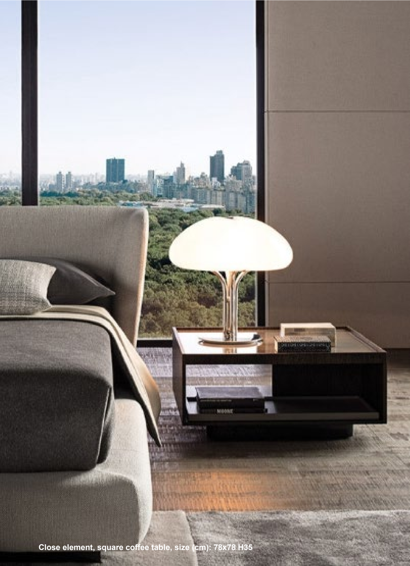
Close element, square coffee table, size (cm): 78x78 H35