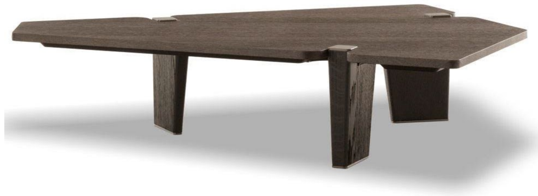
Jacob element, triangle coffee table - low, size (cm): 148x8 H22 Jacob element, triangle coffee table - high, size (cm): 148x8 H28