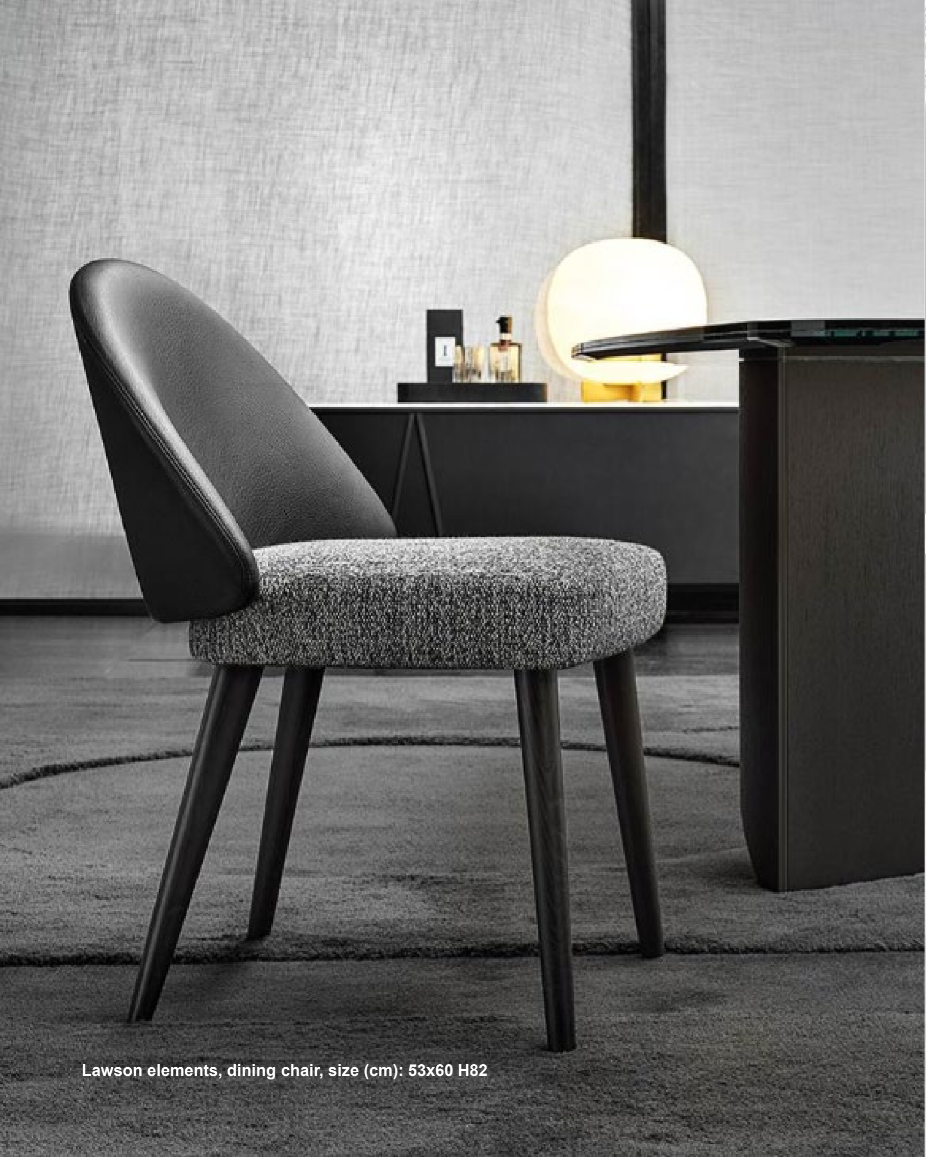
Lawson elements, dining chair, size (cm): 53x60 H82