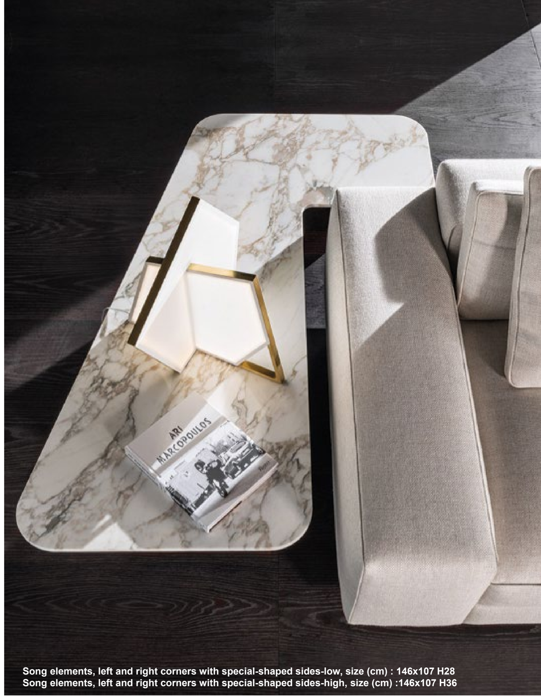
Song elements, left and right corners with special-shaped sides-low, size (cm) : 146x107 H28 Song elements, left and right corners with special-shaped sides-high, size (cm) :146x107 H36