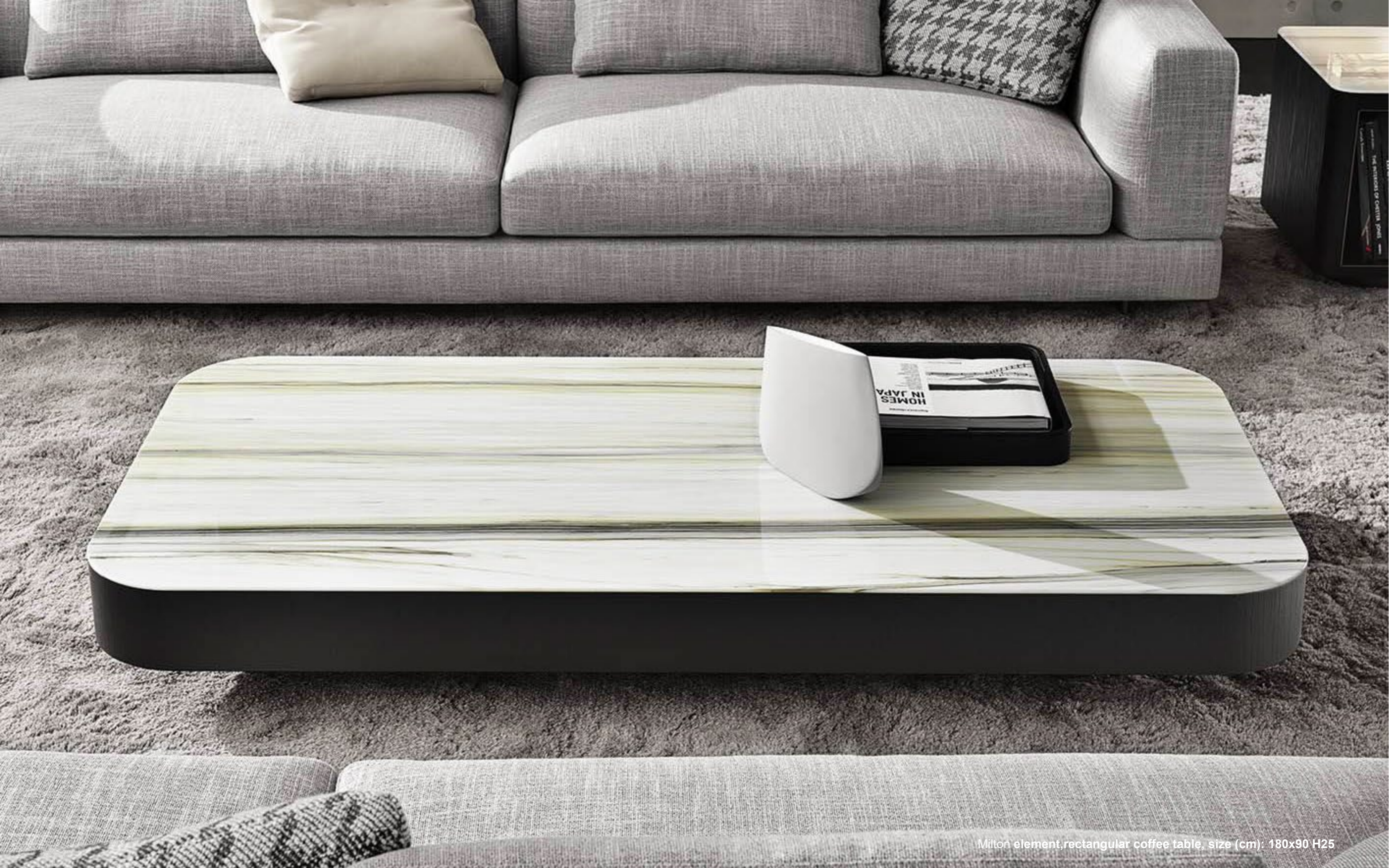
Milton element, rectangular coffee table, size (cm): 180x90 H25