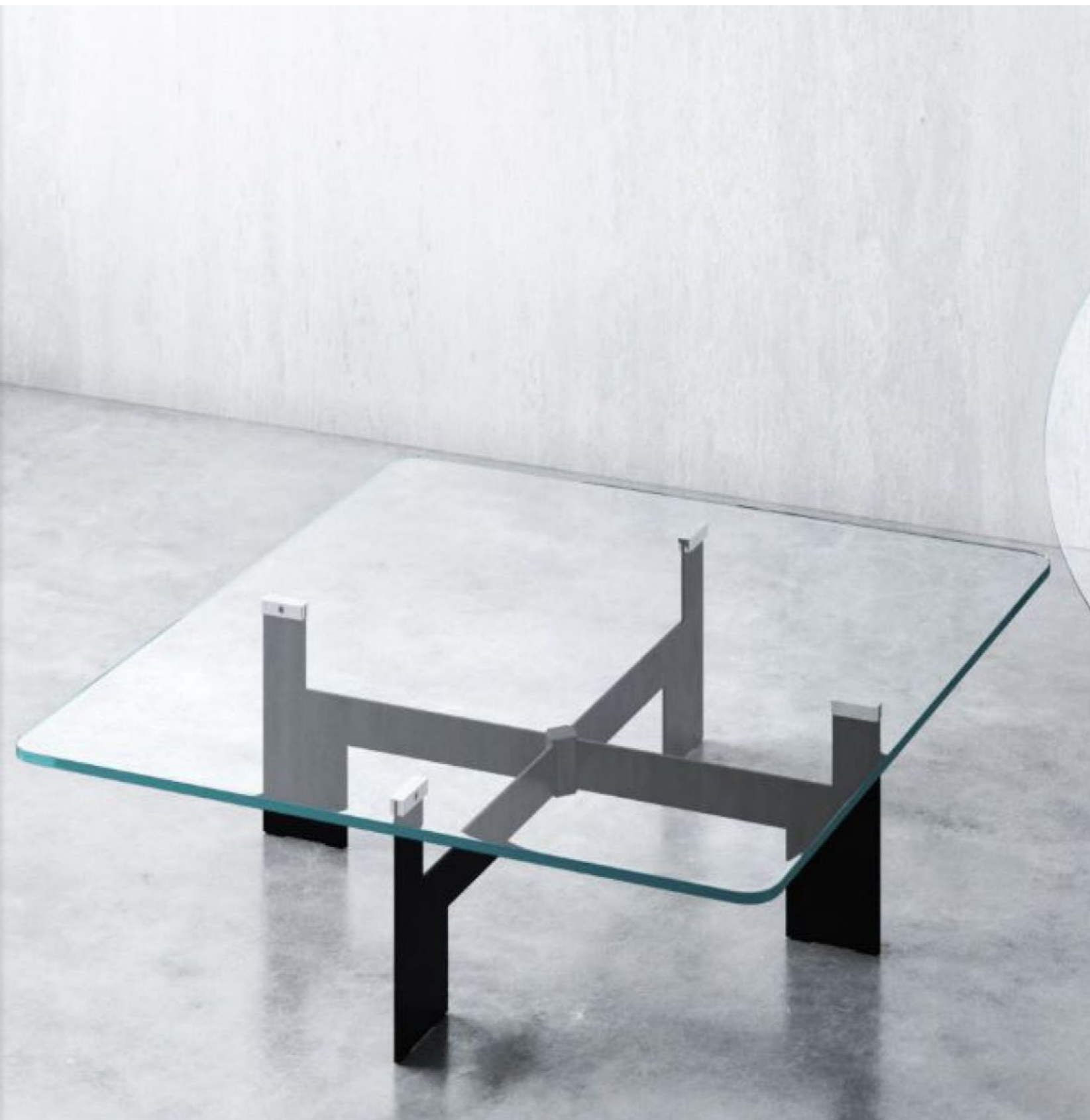
Ellis elements, square coffee table, size (cm): 120x120 H35