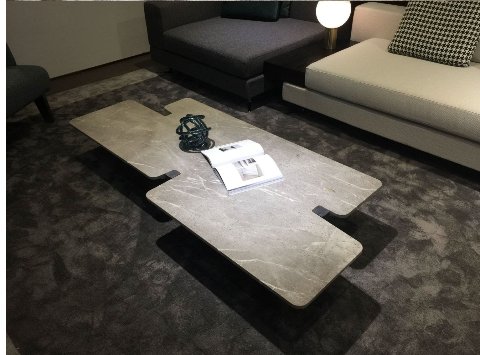
Jacob elements, real view of the exhibition hall