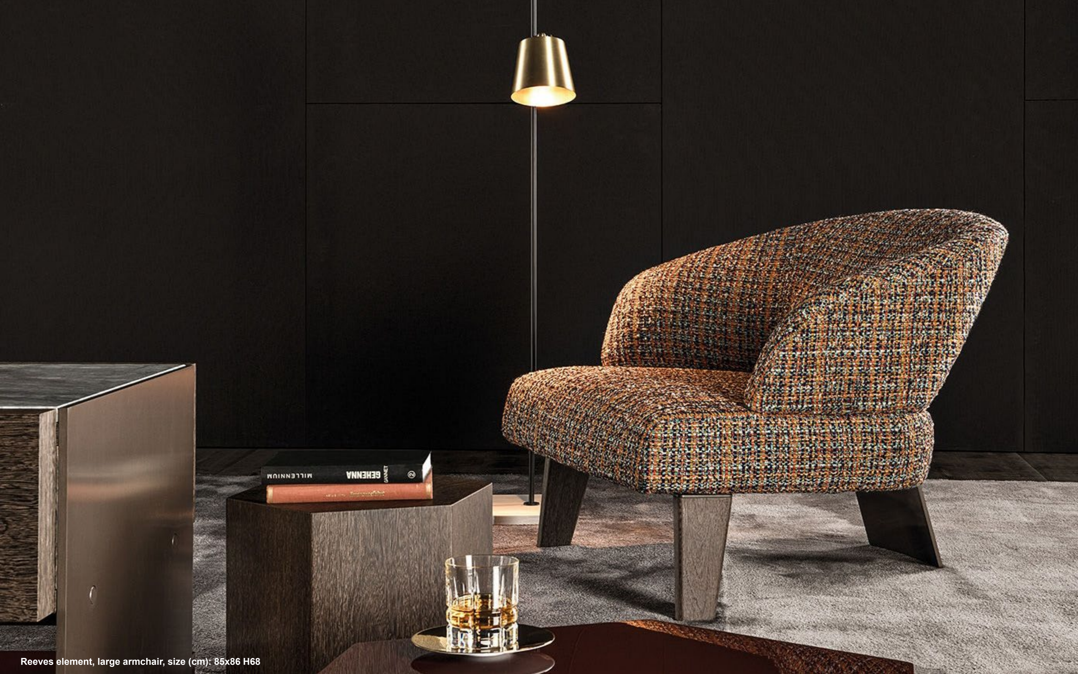
Reeves element, large armchair, size (cm): 85x86 H68