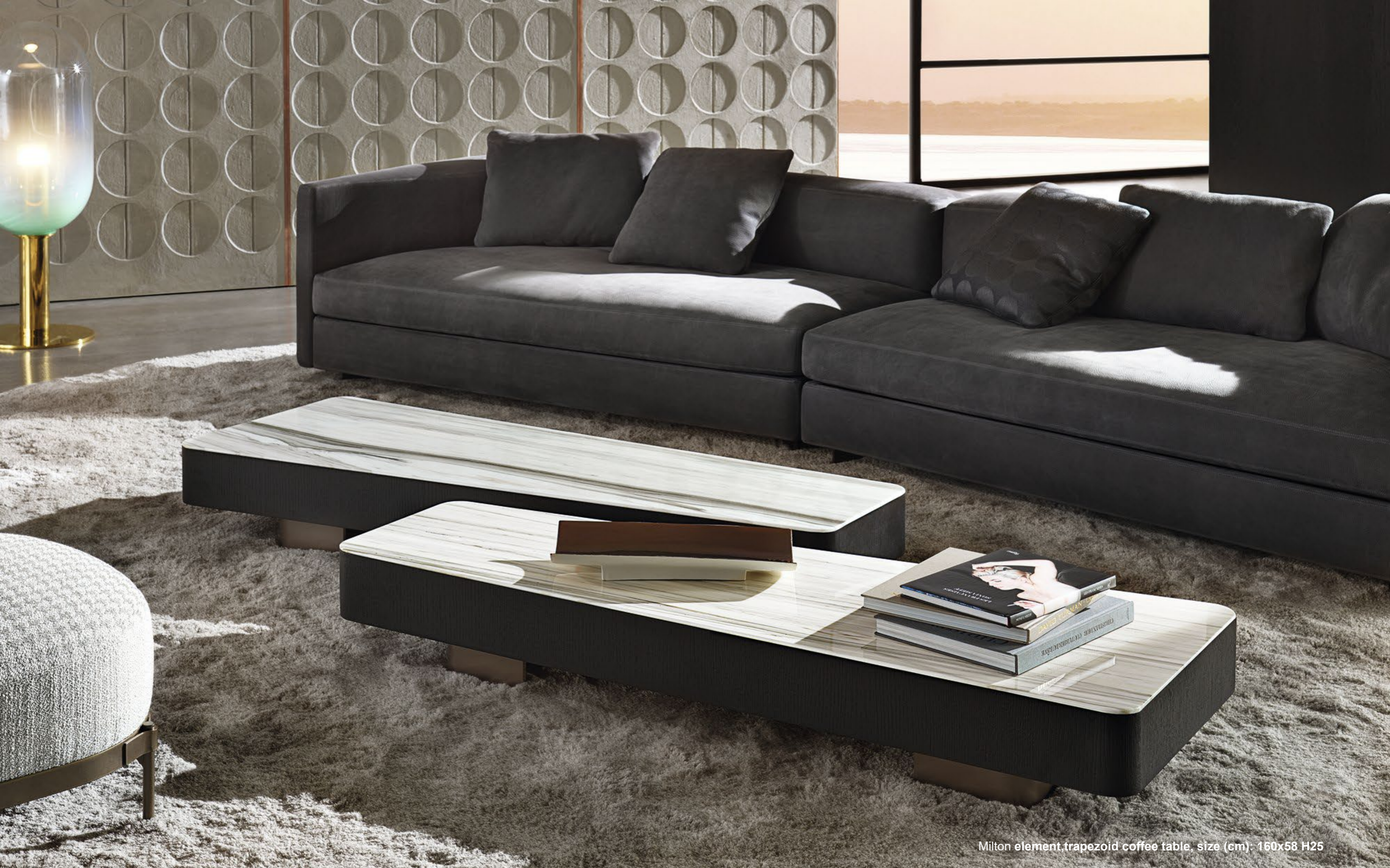
Milton element, trapezoid coffee table, size (cm): 160x58 H25