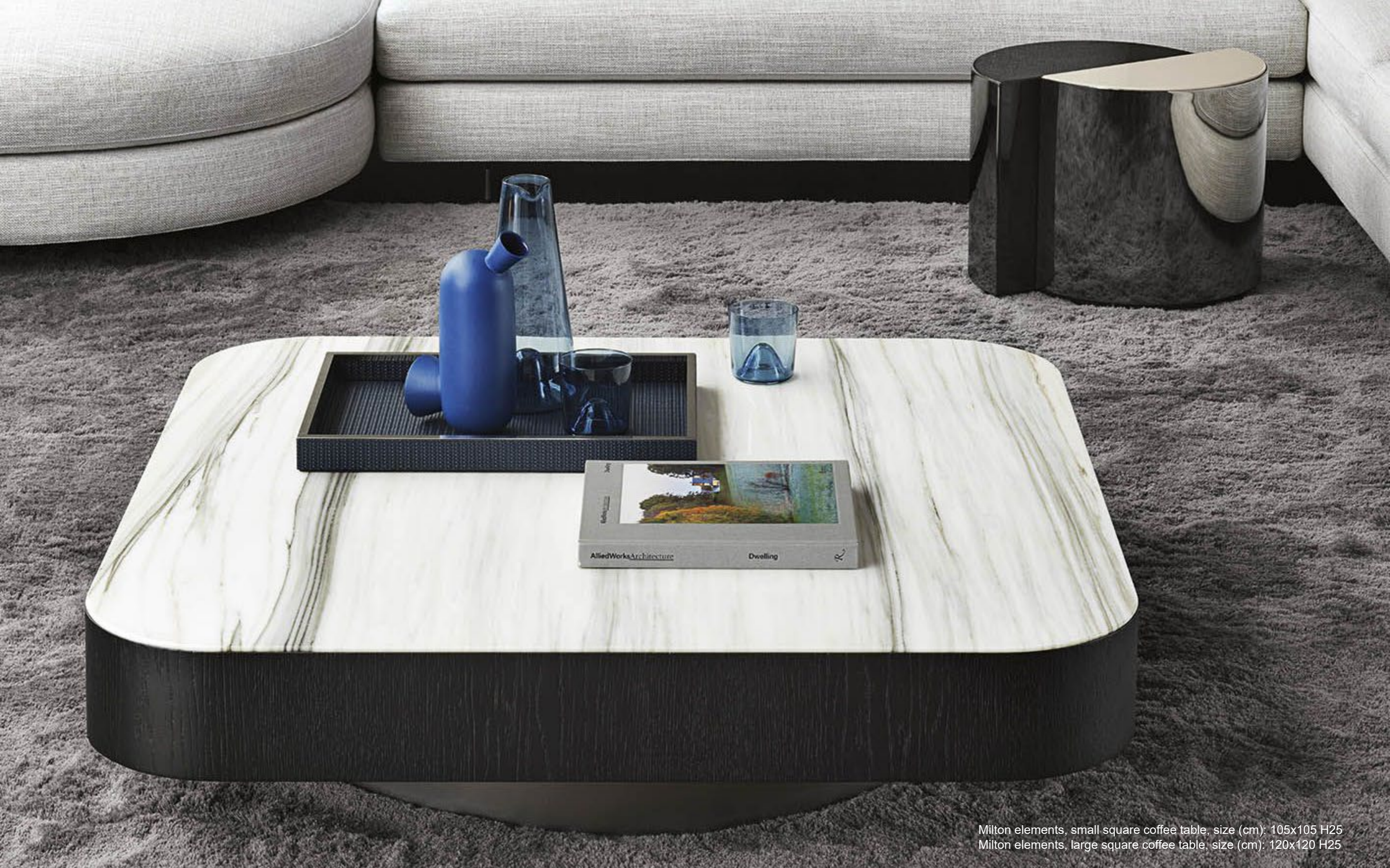
Milton elements, small square coffee table, size (cm): 105x105 H25 Milton elements, large square coffee table, size (cm): 120x120 H25