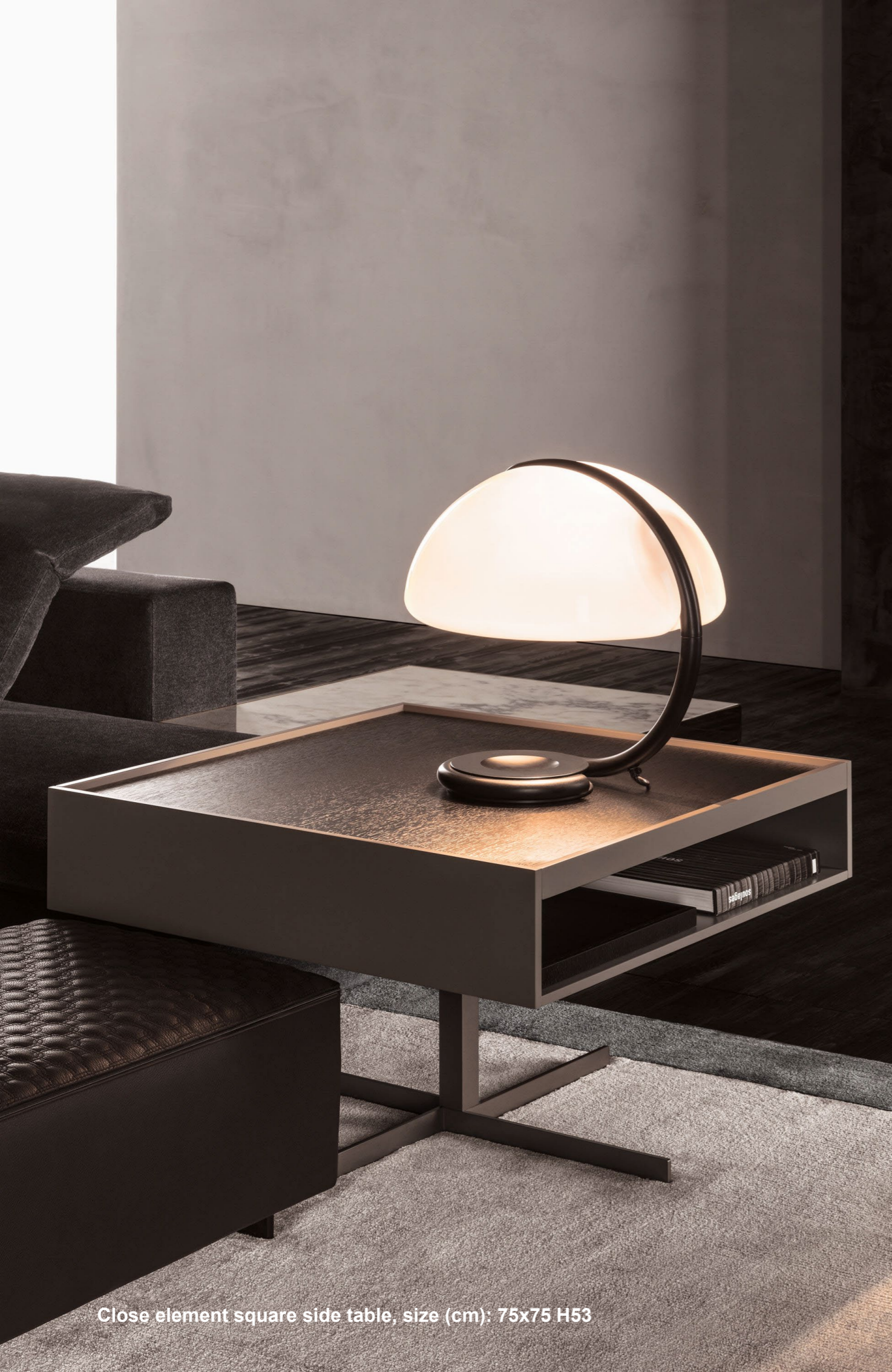
Close element square side table, size (cm): 75x75 H53